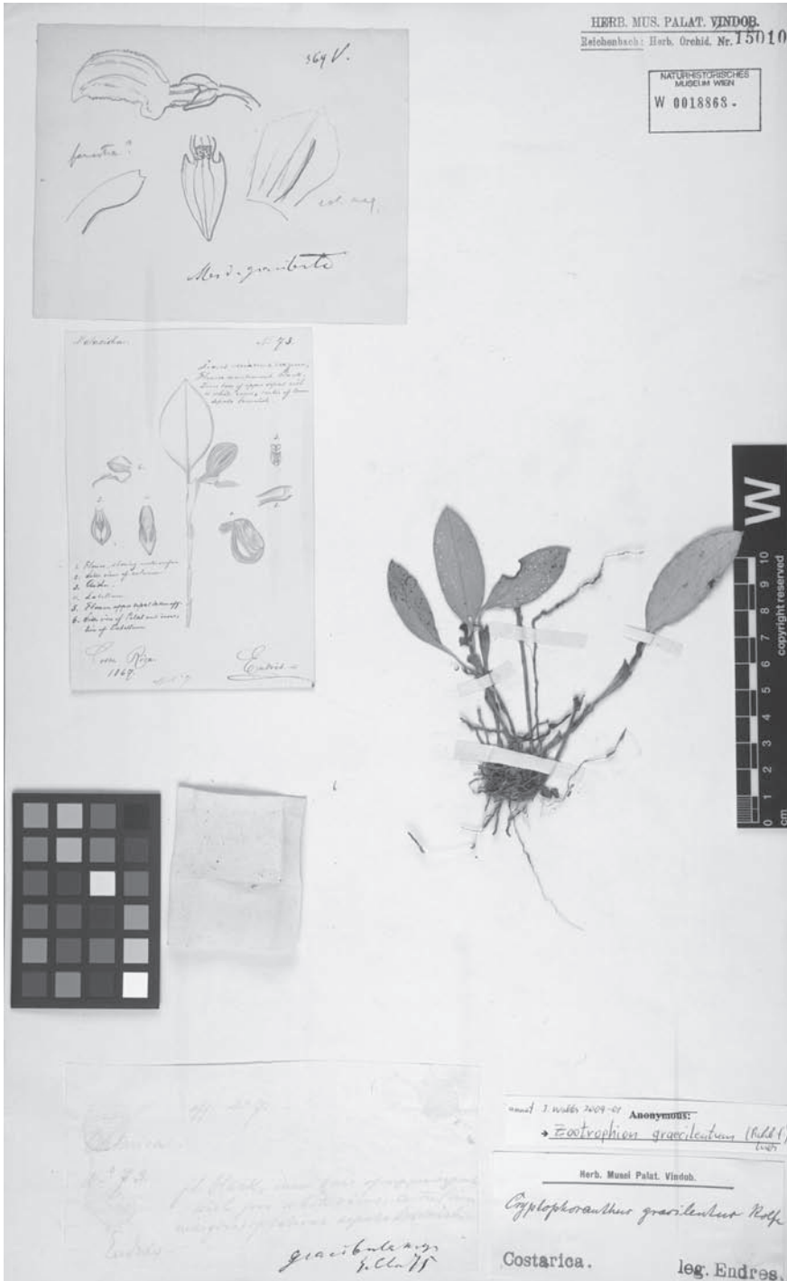
Fig. 1: Lectotype of Masdevallia gracilentia . Costa Rica, 1867, A.R. Endrés 73 [W 0018863 / Rchb. Orch. 18868].