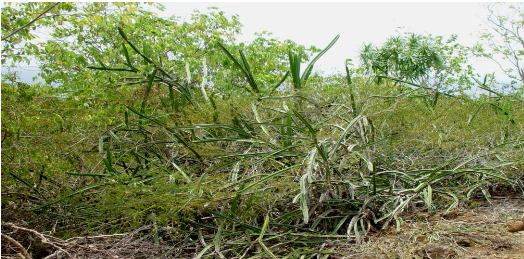
VMT Upper South Hill Cacti Population

The drainage basins and watersheds at the site are a consequence of the site’s ridge, saddle and steep elevation contours. The areas immediately adjacent or within the drainage catchment areas typically harbor the most undisturbed, dense and diversified ecosystems. Also, these areas include the least stable soils of the site. The drainage basins are not permanent streams but dry drainage systems that functions upon the occurrence of major rains. The flora and fauna ecosystem that inhabit these drainage systems enjoy the benefit of receiving more water during the intermittent rain events and some concentration and accumulation during smaller events. Most rainfall during the dry season is quickly absorbed by the dry land and vegetation.