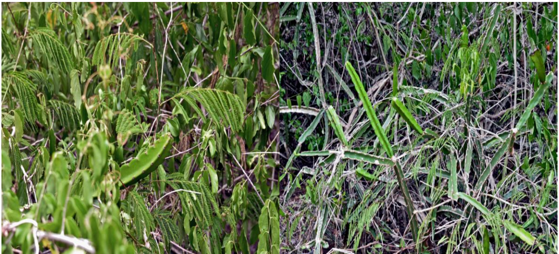
Protective Growth with other Spiny Celtis Iguanaeae Species