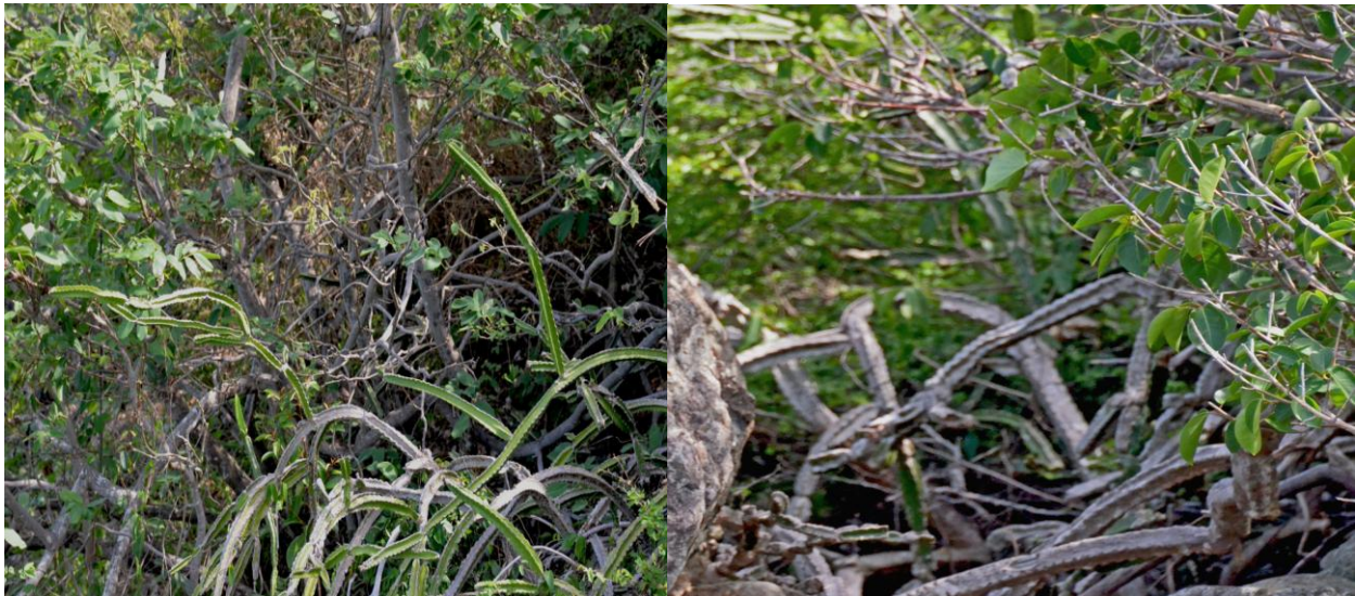
Punta Melones Population base and stem segments

The original population in the Punta Melones area was observed in both in July 2011 and May 2012 as continuing to do well. It is a mature population as can be observed from the color and size of many of its base stems and newer upper plant segments. It is, however, more exposed and threatened today, 18 years later, than in 1995, when the USFWS Recovery Plan was approved.