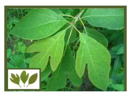
SASSAFRAS (Sassafras albidum) Locations - #44, 47 and 49