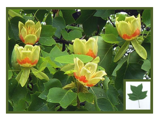
Tulip Poplar (Liriodendron tulipifera) Location - #46