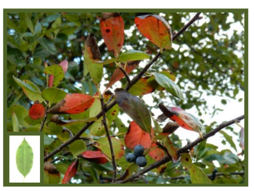
Black Gum (Nyssa sylvatica) Location - #41