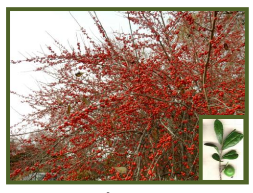
Possumhaw (Ilex decidua) Locations - #19 and 53