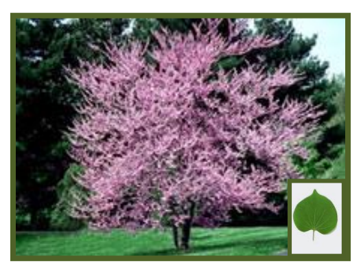
EASTERN Redbud ( Cercis canadensis ) Locations - #5, 9, 12 and 21