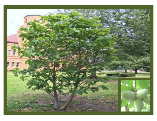
Pawpaw (Asimina tribola) Location - #10