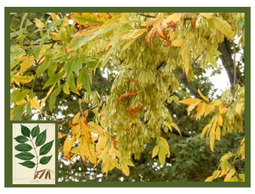
GREEN Ash ( Fraxinus pennsylvanica ) Locations - #8, 26 and 30