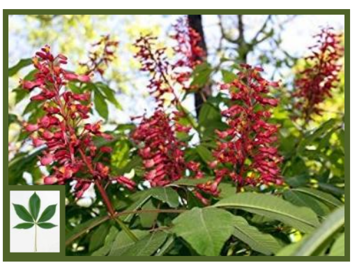
Red Buckeye (Aesculus pavia) Location - #57