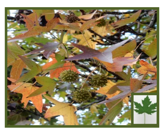
SWEETGUM ( Liquidambar styraciflua ) Locations - #2, 17 and 45