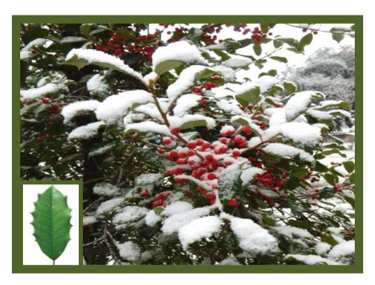
American Holly (Ilex opaca) Locations - #27 and 40