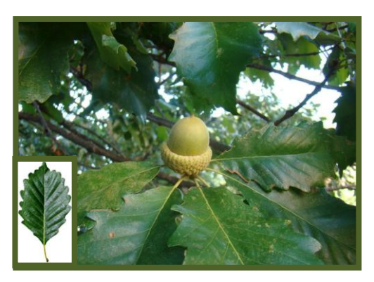
SWAMP CHESTNUT Oak ( Quercus michauxii ) Locations - #54 and 60