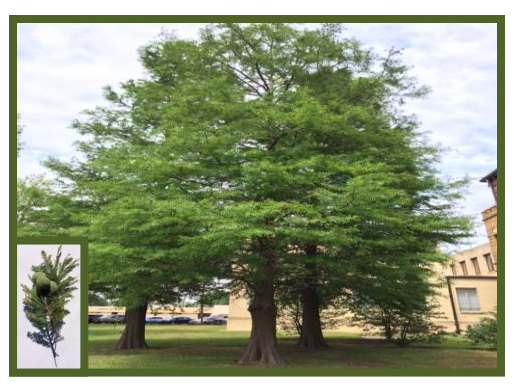
Bald Cypress ( Taxodium distichum ) Location # 22, 23 and 24