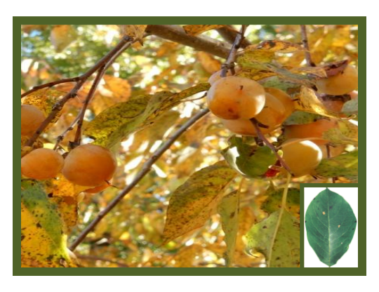
PERSIMMON (Diospyros virginiana) Location - #39