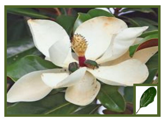
Southern Magnolia ( Magnolia grandiflora ) Locations - #1,4,36,48,61 and 63