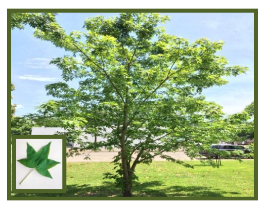
Silver Maple (Acer saccharinum) Location - #50