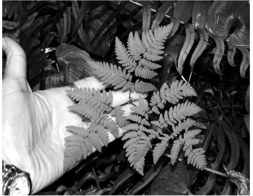
Figure 3. Oak Fern - Gymnocarpium dryopteris

The small, low-growing Oak Fern ( Gymnocarpium dryopteris , Fig. 3) was also a stand-out of the day because its light green triangular lamina—held horizontally above the forest floor—made it seem almost out of place among the larger, more robust-looking, dark-green ferns of the understory. Other ferns checked off our list at the LSCR were the Spiny Wood Fern ( Dryopteris expansa ), Braun's Holly Fern ( Polystichum braunii ), Narrow Beech Fern ( Phegopteris connectilis ), and Mountain Fern ( Thelypteris quelpaertensis ).