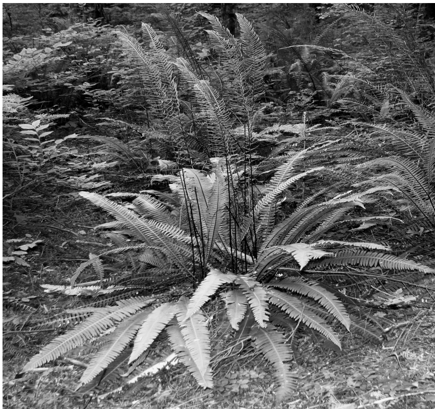
Figure 1. Deer Fern- Blechnum spicant

We entered the trails at the top of a gentle slope and were greeted with a mixed deciduous/coniferous forest with trees draped in epiphytes, their lower branches arching down over boulders that were cloaked in bryophytes and ferns. Immediately we encountered our first ferns of the trip (if we don't take into account the ubiquitous roadside Bracken Fern, Pteridium aquilinum ): the Sword Fern ( Polystichum munitum ), the Lady Fern ( Athyrium filix-femina ssp. cyclosorum , Fig. 2), and the Deer Fern ( Blechnum spicant , Fig. 1). All three of these species were frequent along the trail, with B. spicant appearing particularly stunning with the erect fertile leaves set