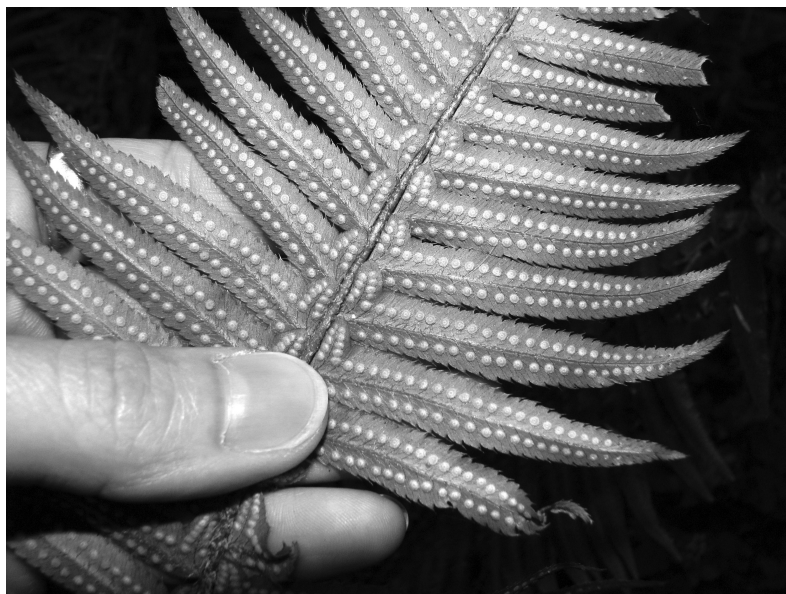
Figure 7. Polystichum munitum sori .

The third and final stop for the field trip was Larson Bay in West Vancouver. After a leisurely walk through a neighborhood of spectacular homes with oceanfront views, participants reached the cobble beach and the bayside trails beyond. This site added one more lycophyte to our checklist of the day, Wallace's Spikemoss ( Selaginella wallacei ), and three more ferns: Giant Horsetail ( Equisetum telmateia ), Maidenhair Spleenwort ( Asplenium trichomanes ssp. trichomanes ), and Goldenback Fern ( Pentagramma triangularis ). A dead shark on the beach provided a non-botanical highlight for the less squeamish among us.