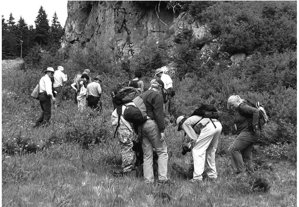
Figure 5. Foray on Mount Seymour chairlift right-of-way.

An impressive sight for some participants was the dense and expansive carpet of Common Horsetail ( Equisetum arvense ); the occasional dandelion inflorescence popping out from this lush colony of horsetails made it look like some whimsical chimera of fern and composite. The showstopper, however, was the assemblage of Botrychium species found in the chairlift right-of-way: Leather Grapefern ( B. multifidum ), Western Moonwort ( B. hesperium ), and Northwestern Moonwort ( B. pinnatum ). In some spots, the Botrychium was abundant enough that we had to carefully select where to place our next step so as not to crush the diminutive fronds. These ferns elicited so