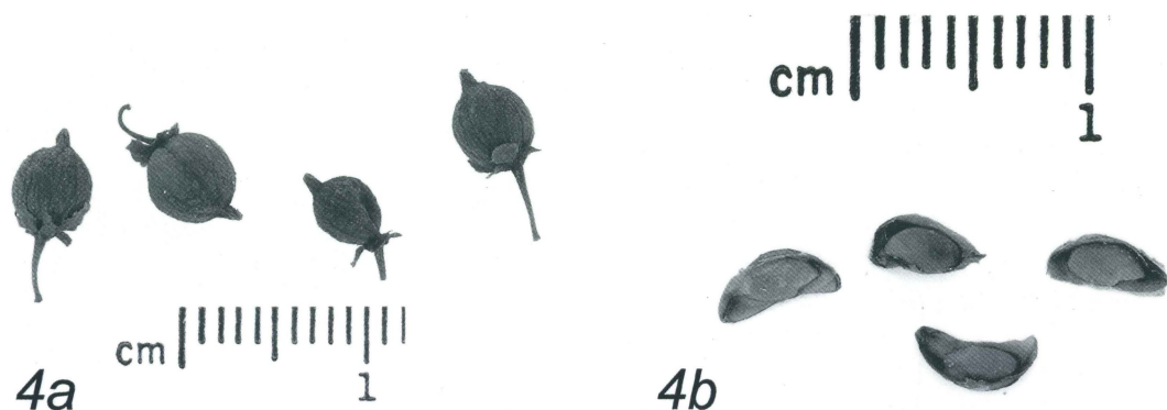
FIG. 4. Fruits and seeds: a. fruits of Phyllanthus skutchii (Herrera 3993); b. seeds of P. puntii (Solomon 17717).

copiously puncticulate; midrib incised adaxially, prominently raised abaxially; lateral veins mostly 7–10, veinlets forming an irregular network, slightly prominulous on both faces; petiole 1.5–3 mm long; stipules lanceolate, 0.7–1.5 mm long. FLOWERS in axillary pedunculate unisexual glomerules (peduncle 1–3 mm long), staminate flowers 30–40 per axil, pistillate flowers 1–4 per axil. STAMINATE pedicel 2.5–4 mm long; sepals 6, elliptic-oblong, obtuse or subacute, 1.3–1.6 \times 0.5–0.8 mm, midrib not prominent; disk 6-angled or \pm dissected,