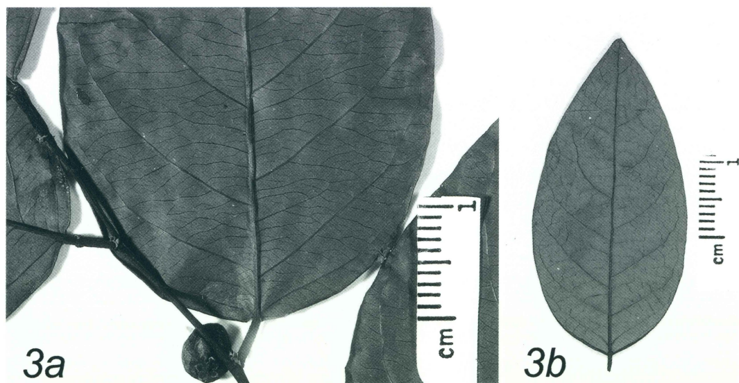
FIG. 3. Abaxial leaf surfaces. a. Phyllanthus attenuatus ssp. attenuatus (Callejas & Marulanda 6965); b. Phyllanthus madeirensis (Mori & Cardoso 17482).

LOTYPE: INPA 16822!; ISOTYPES: MO!, NY!). (Figs. 1, 3b).