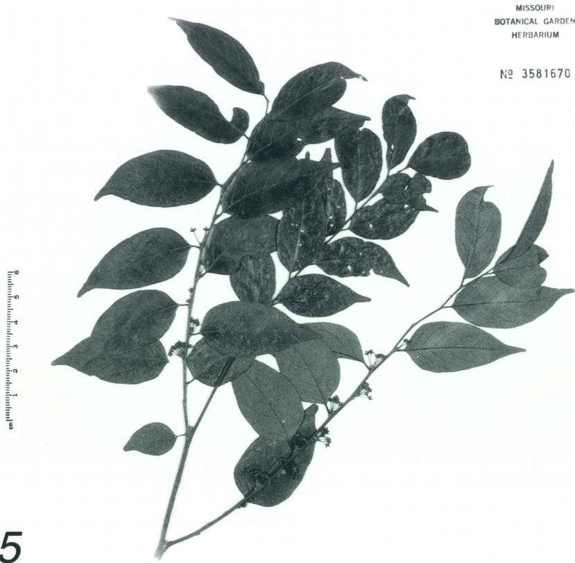
FIG. 5. Branch and branchlets of Phyllanthus punctii (Prance et al. 7712).

0.7–0.8 mm across; stamens 3, filaments connate into a stout column 0.5–0.7 × 0.3–0.4 mm; anthers ovate, apiculate, dehiscent horizontally, androecium 0.6–0.7 mm in diameter. PISTILLATE pedicel slender, 4–7 × 0.1–0.2 mm; sepals 6, elliptic, 1.2–1.7 × 0.6–1 mm; disk patelliform, c. 1 mm in diameter; ovary (3-) 4- or 5-locular; styles erect, slender, unlobed, 0.3–0.5 mm long. FRUITS subspheroidal or slightly prolate, 5–8 mm in diameter; seed tegmen 3.5–4.5 mm long.