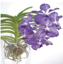
Front cover picture