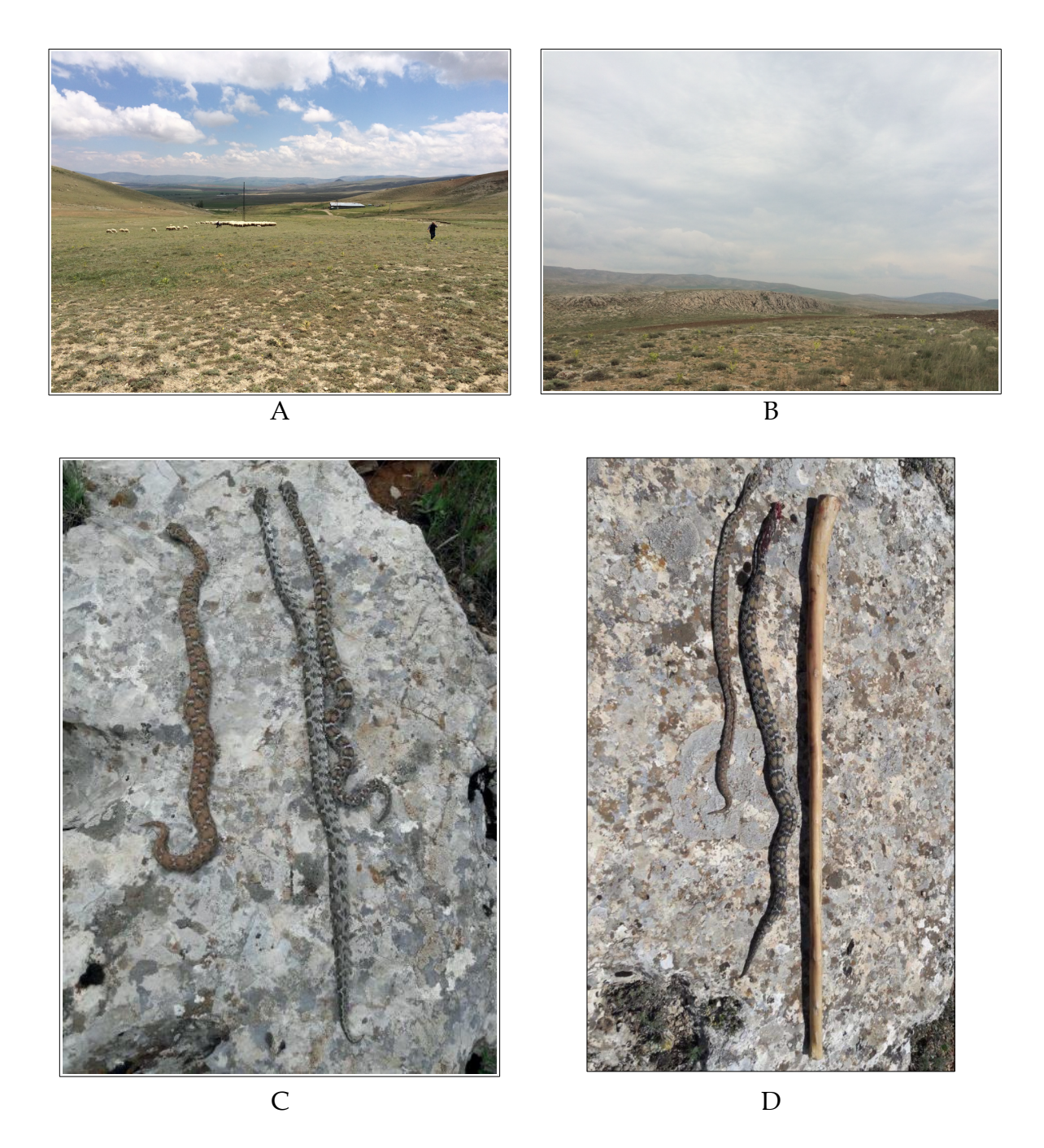
Fig. 3. Some potential threats of the Mountain viper from Sivas. A: Overgrazing activities, B: Agricultural activities, C, D: Deliberate or accidental killed vipers.

and awareness raising activities among locals to prevent illegal collection/killing of the vipers are main conservation measures for sustainability of the Mountain viper (Table 2).