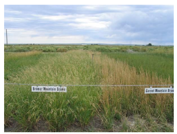
Aberdeen PMC Display nursery plots of Bromar (left) and Garnet (right).

'Bromar' was chosen from among 154 accessions collected in the Pacific Northwest and was released in 1946 cooperatively by Washington, Idaho and Oregon Agricultural Experiment Stations at Pullman, Moscow and Corvallis. It was selected for being taller, leafier and having better seedling vigor than commercial strains. It shows outstanding performance when planted in mixtures with sweetclover or red clover for short pasture rotations. Tests have shown Bromar to be moderately resistant to head smut, but chemical seed treatment is recommended. Breeder seed is maintained by the NRCS Plant Materials Center in Pullman, Washington and Foundation seed is produced by the Washington Crop Improvement Association.