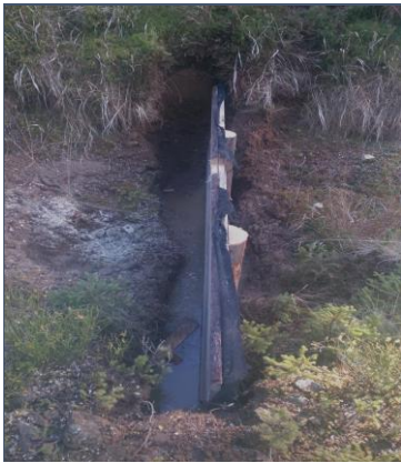
Figure 16 The dam is built with a double wall with a membrane in the middle to make it waterproof.

gradients to rise water table to a target level, stop erosion and to achieve terrestrialisation of the ditches.