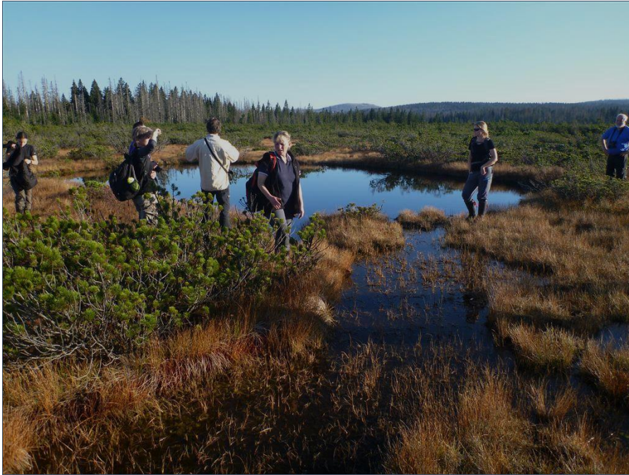
Figure 22 Intact part of the mire.