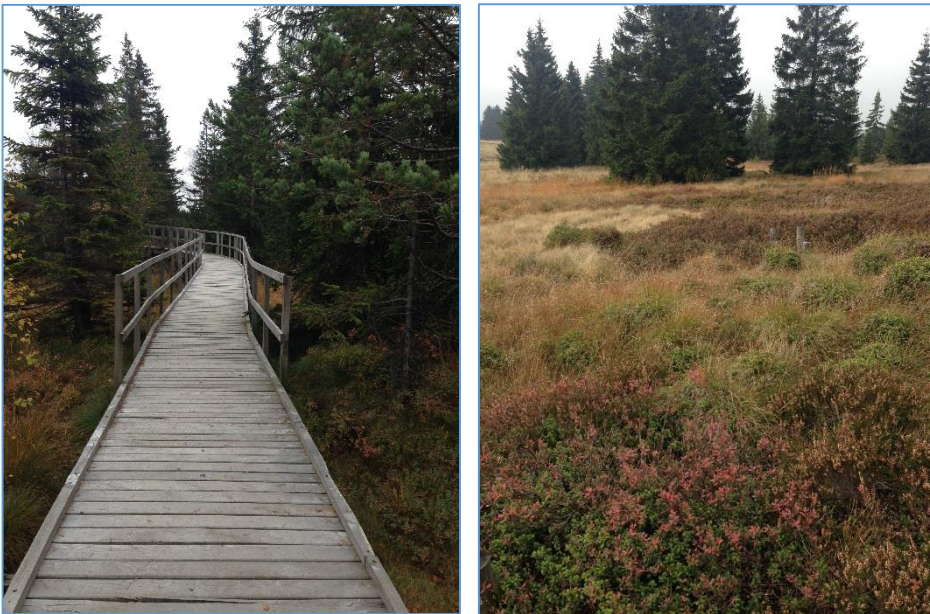
Figure 5 Boardwalk through the peatland (left) and Boží Dar Peatland (right)

The National Nature Reserve Boží Dar Peatland was proclaimed as a National Reserve in 1965. With an area of 930 ha this reserve is among the largest protected areas in the Czech Republic. Nature trails was created in 1972 by building a 3.2 km long boardwalk that runs partly through the peatland.