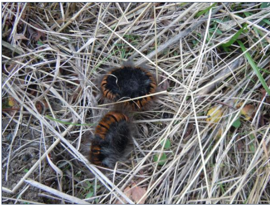
Figure 3 The rare butterfly Marsh fritillary in Bražecké hliňáky. Monitoring will start this fall