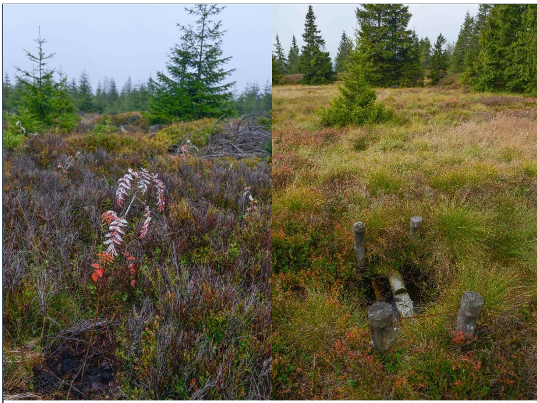
Figure 8 Different measures were made to enhance growth of deciduous trees; singel-tree fences, group-tree fences and white-anti-deer-painting (painting every year for 15 years). Wooden dams made to increase the water table. Notice the metal string on each end of the wooden structure. It prevents the deer from crossing the dam and thereby destroying the structure. Picture at right shows the “anti-deer” painting on Sorbus aucuparia

There was no monitoring of the growth of the trees, but the method used has been successful in other areas.