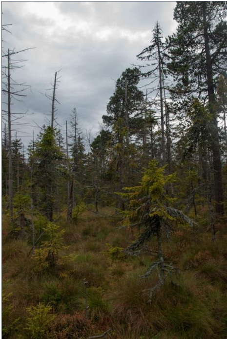
Figure 12 Water locked forest in Kladská mire

In the main ditches there were quite much water movements, which should be stopped. In some areas the succession has been faster. The explanation of this is less intensive peat extraction in these areas.