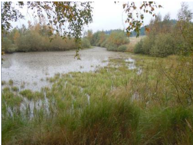
Figure 2 Man – made ponds in Bražecké hliňáky

Many amphibian species live in this area. We recorded Moor frog Rana arvalis and Common toad Bufo bufo . The area is also important for birds. Among other species we recorded Common crane Grus grus , Kestrel Falco tinnunculus and Common Buzzard Buteo buteo . As the ponds are dominated by various Potamogeton species, they also function as good feeding sites for dabbling ducks. Artificial nesting boxes for ducks are placed in some of the ponds.