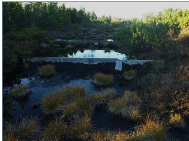
Figure 23 Dams built to re-establish water level.

No peat or other masses were added to the ditch. As can be seen from the picture above the regeneration might take some time, but in some of the small pools the terrestrialisation has started.