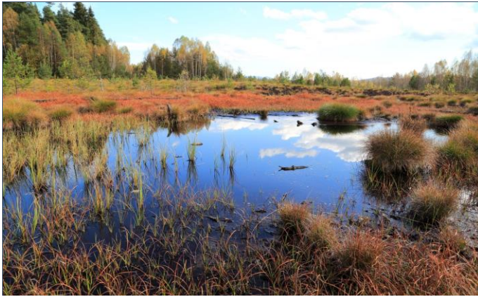
Figure 29 A small pool in Soumarsky most peatland is a results of the increased water table caused by blocking drainage ditches. These pools are important habitats for several groups of insects including dragonflies.