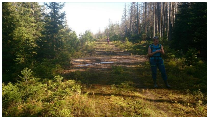
Figure 18 Restored stream crossing the Iron Curtain.