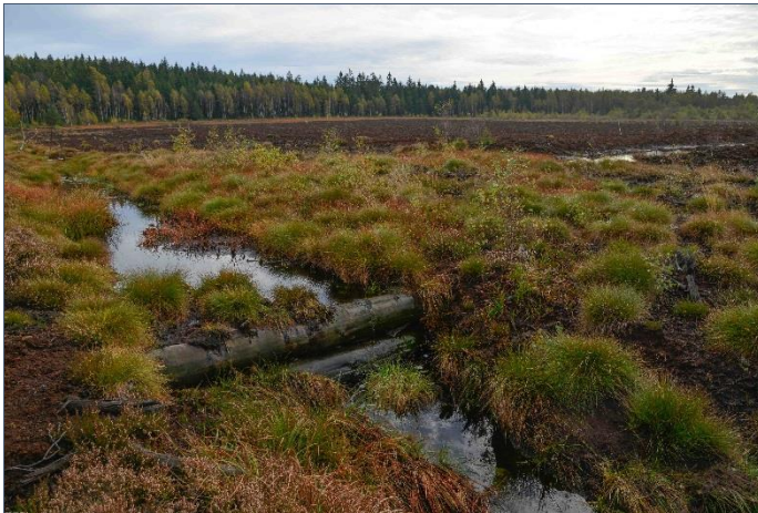
Figure 10 Wooden dam in old ditch in the Protected Landscape Area Slavkovsky les. The area was earlier an important era for peat extraction. The water level was still too low to prevent drainage of the peatlands.