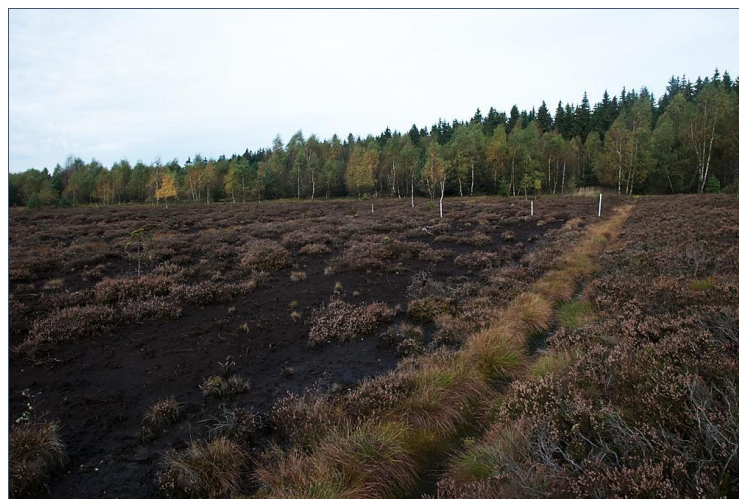
Figure 11 Revegetation of the remaining peatlands has proved difficult. This is partly due to surface temperature during summer up to about 60°C. The peat surface does not absorb water, but develops a hard and sustainable surface

As walking trough the peatlands, we were shown a pond of unknown origin. This area was of well-developed peatlands. The pond is of great importance to the dragonflies. From the edges, one could see the beginning of a succession gradient. Even though, the overall ground water level has not risen sufficiently. The goal is to raise it to about 30-40 cm below ground.