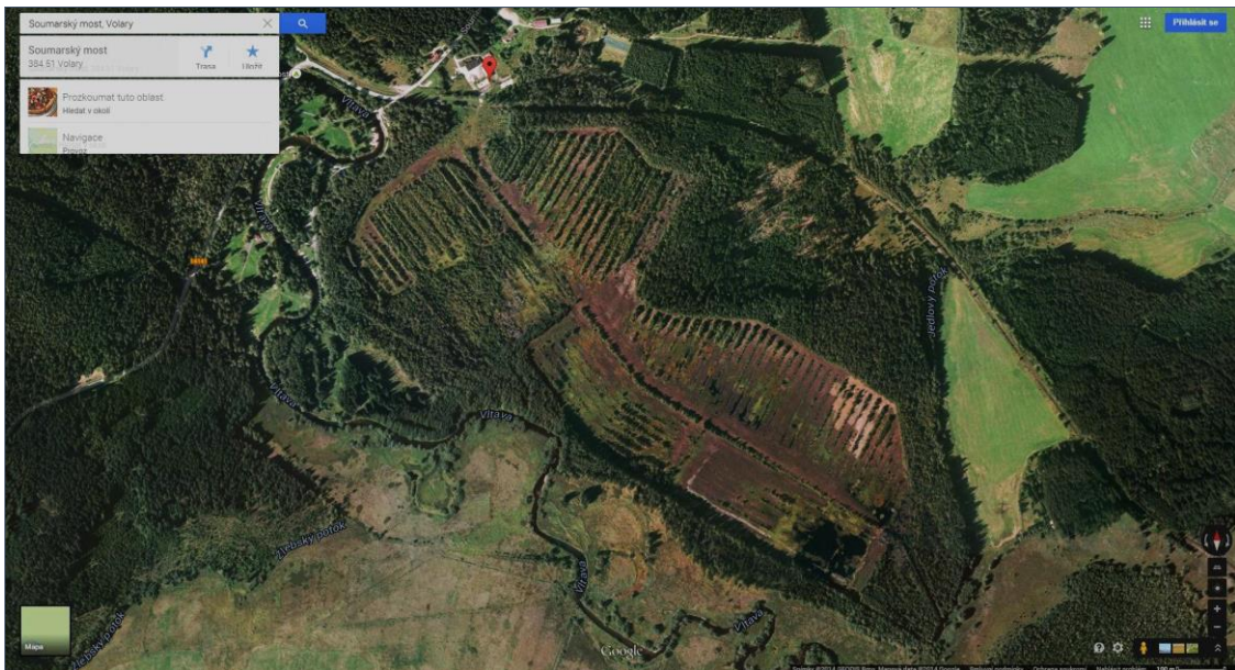
Figure 27 Aerial photo of Soumarsky most. The areas with former peat extraction are easily seen in the photo

The only industrially harvested peat bog in Sumava NP. The area was harvested by machines from 1960's to 1998. Peat was extracted from a total area of 75 ha. NP administration stopped peat mining in 1998 after negotiations with the private owner to restore the area as a wetland. There is normally an obligation by law to restore a peat-mined area after extraction, but either as agricultural land or forest. The peat was exposed on the surface. The local town restituted ownership of the bog and thus many negotiations were made to convince it about the benefit of the restoration process.