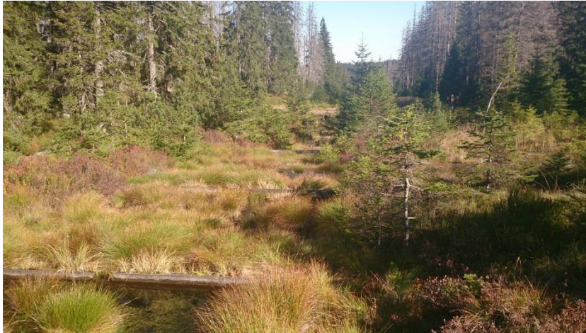
Figure 19 (left) Ditch dammed in 2006 with almost no open water surface due to terrestrialisation