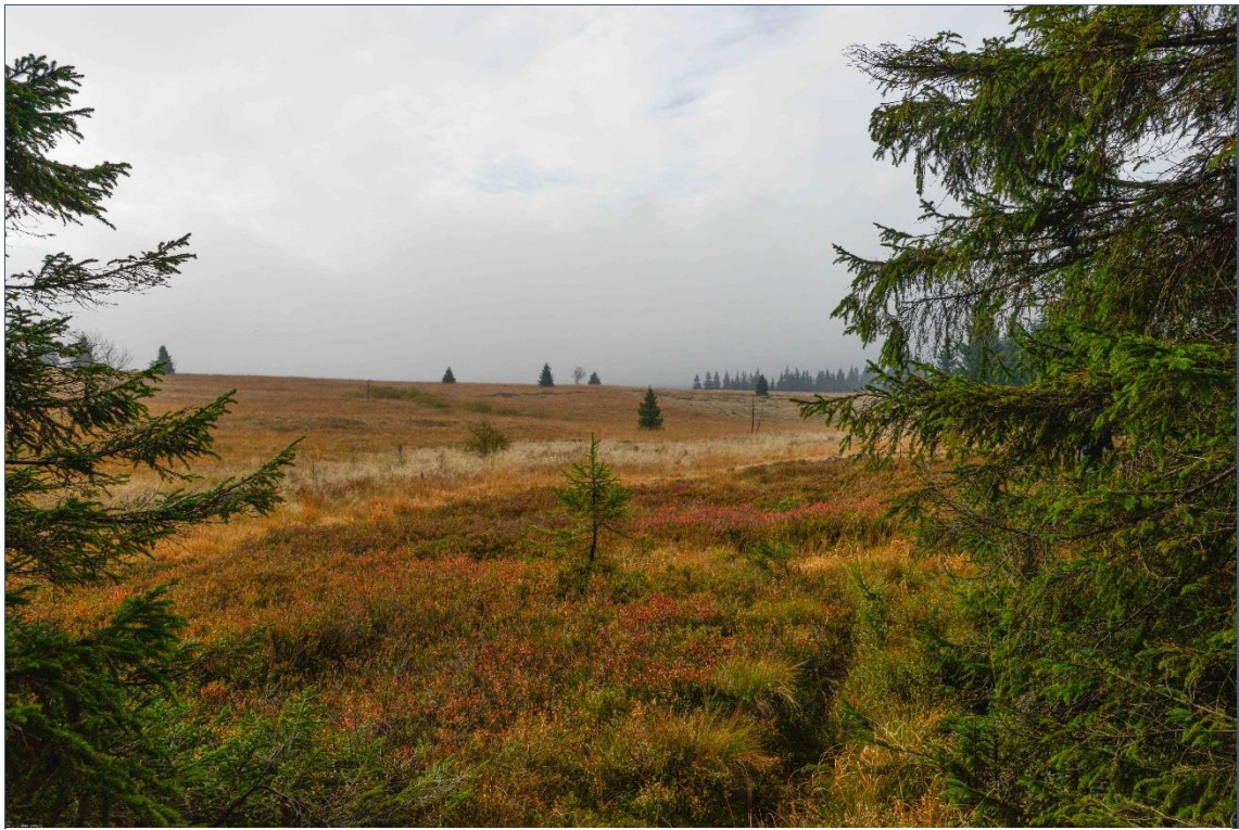
Figure 9 Landscape of Boží Dar Peatland