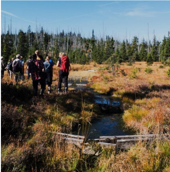
Figure 14 Dam and old ditch in a raised bog in Breznik peatlands

The water table has been raised, and botanical studies show an expansion of natural mire species. An interesting experience was that