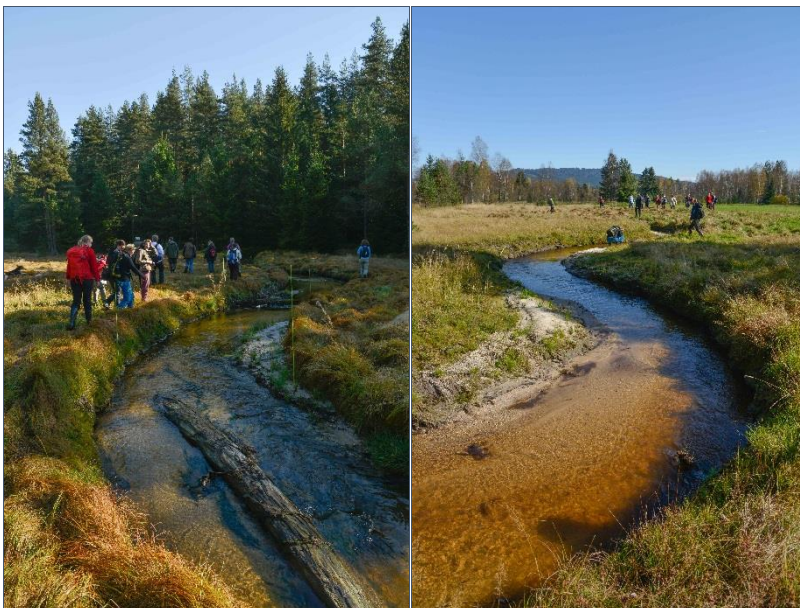
Figure 26 A section of the restored river in alluvial meadows in Hučina river system. Notice the woody debris in the photo to the left. They will enhance habitat diversity