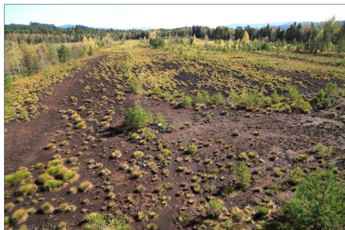
Figure 28 View from the observation tower in Soumarsky Most peatland. The bare peat is slowly being colonized by plants, especially Eriophorum tussocks

To reach the goals ditches were blocked and mulch from adjacent mire meadows was added to the bare peat to reduce extreme