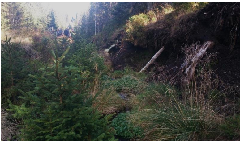
Figure 15 Ditch eroded 3-4 m deep and 6-7 m wide.

different species of Sphagnum able to grow floating on water.