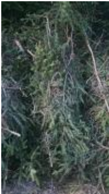
Figure 17 Also bundles of branches are made to be used in the ditches on the slope, to make fine sediments accumulate.

It is early days in the project, and along the difficult parts of the Iron Curtain the dams are still under construction. There has been no monitoring of the restoration yet, only of the pre-restoration phase.