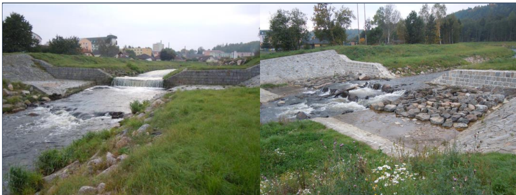
Figure 4 Two of the dams built in the 80'ies. The dam to the right has been successfully restored for migrations of fish during the latest years

The fish ladder is effective. Only one ladder is so far completed, so the fish are trapped further upstream. We did see some fish succeed to jump where no improvements were made, but we also observed several that did not make it.