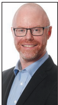
Stephen Donnelly, TD

According to the figures, the Community Healthcare East waiting