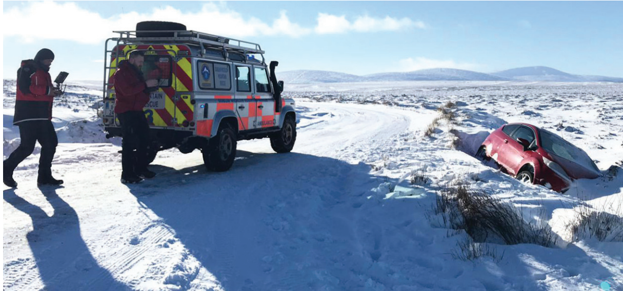
The Dublin-Wicklow Mountain Rescue Team comes to the aid of a motorist in the Wicklow Mountains.

There were chaotic scenes over the weekend of 2nd-3rd February as hordes of 'snow tourists', wanting to take in the scenery or go tobogganing, descended on the Wicklow Mountains and upland areas and became stranded, putting a strain on the resources of mountain rescue teams.