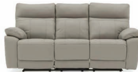
PALERMO 3+1 RECLINER (GREY) WAS €3045 NOW €1625 FOR SET