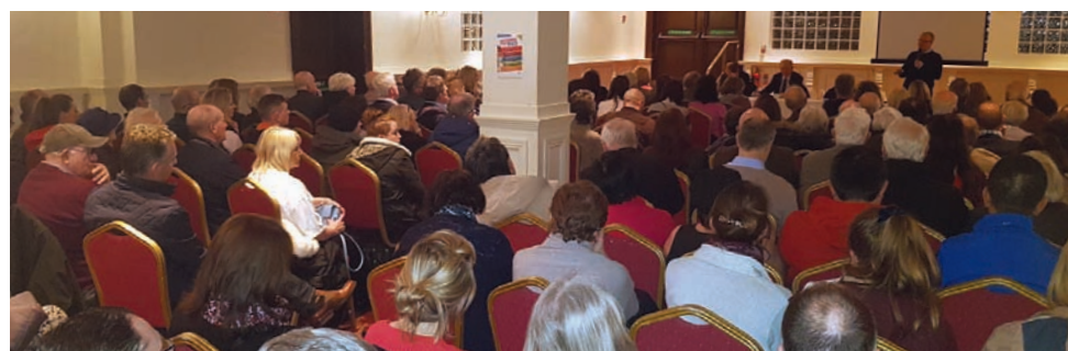
Over 200 people turned out at the Royal Hotel to hear Peadar Tobin outline his new party's policies.

growing rapidly with over 4,000 people already turned up to our public meetings. We are currently talking to 30 other politicians and hope to announce new members shortly. After the general election we would at a minimum hope to have 7 Dáil seats. Our three basic core values, National Unity; Economic Justice and Right to Life are resonating with voters."