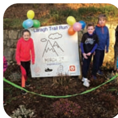
LARAGH TRAIL RUN page 2