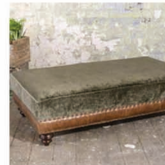
CONSTABLE GRAND SOFA, MIDI SOFA, WING CHAIR, LOUNGE STOOL WAS €9770 NOW 6450 FOR SET

Southern Cross Retail Park Bray Co. Wicklow