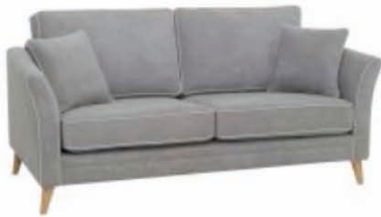
ISLA 2.5 - 2 - 1 (BETIS BEIGE) WAS €2485 NOW €1475 FOR SET