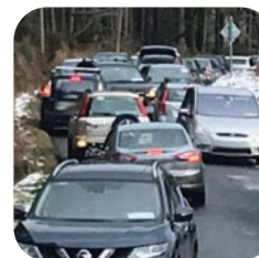
SNOW TOURISTS page 4