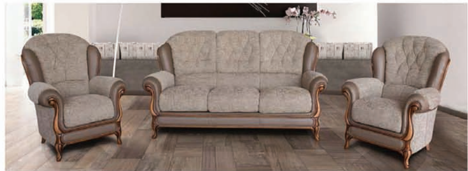
Corby 3-2-1 (montana plain coco/brushstrokes coco)

Selection of display models for IMMEDIATE delivery and FREE disposal of replaced sofas