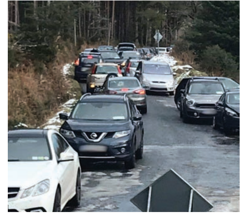
'Snow tourists descent on the Wicklow Uplands'

Over that weekend, Dublin & Wicklow Mountain Rescue Team and Glen of Imaal Mountain Rescue Team were tasked twice to rescue people from upland roads. On the afternoon of Wednesday, January 20th, and very early on Saturday morning, February 2nd