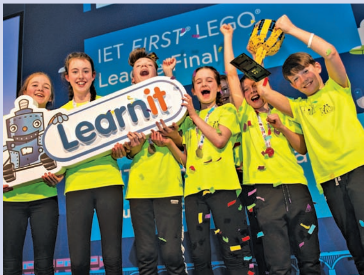
Students from Wicklow Montessori celebrate their victory

FIRST is an acronym for 'For Inspiration and Recognition of Science and Technology', and the FIRST LEGO League encourages children to think like scientists and engineers, working on real-world issues.