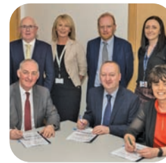
HOUSING FIRST page 7