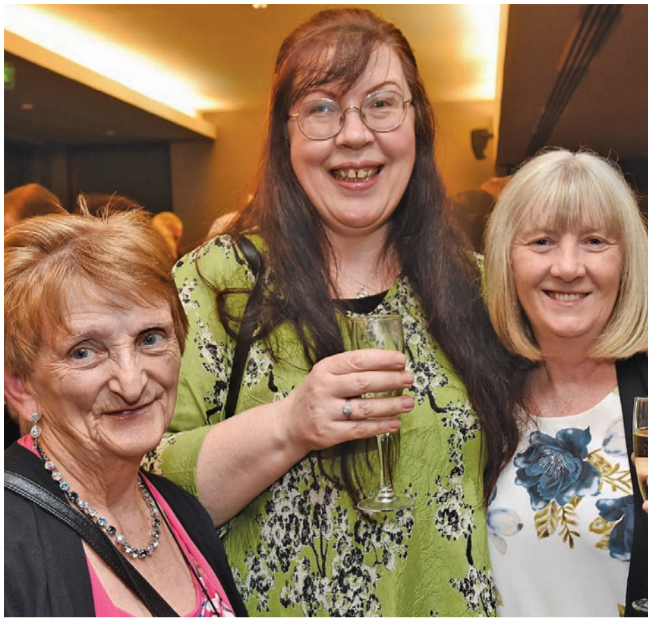
Local Wicklow family carers are pictured at Family Carers Ireland's National Respite Weekend. TD and Leader of Fianna Fáil Micheál Martin met with Wicklow family carers at Family Carers Ireland's 'National Respite Weekend' at The Clayton Hotel Cork City on Saturday 7th March. The charity took the opportunity to call on Micheál Martin to make Family Carers Ireland's GE2020 Manifesto 'asks' a red line issue in formation talks for the next Government and to give full-time family carers a right to 20 days respite each year in line with statutory leave available to paid workers.