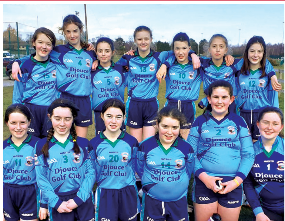
Pictured is the Moneystown team that participated in the Cumann na mBunscol Wicklow Times Shield Day 1 in Bray Emmets on Thursday March 5th. This was the first round of the competitive Girls Gaelic blitz for this Cumann na mBunscol year. All hands were on deck as 23 teams competed over 11 pitches in the group stages. The games were played at a blistering pace supported by Transition Year students from local schools who have been trained as Young Referees.