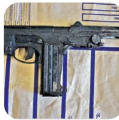
GUN SEIZED page 6