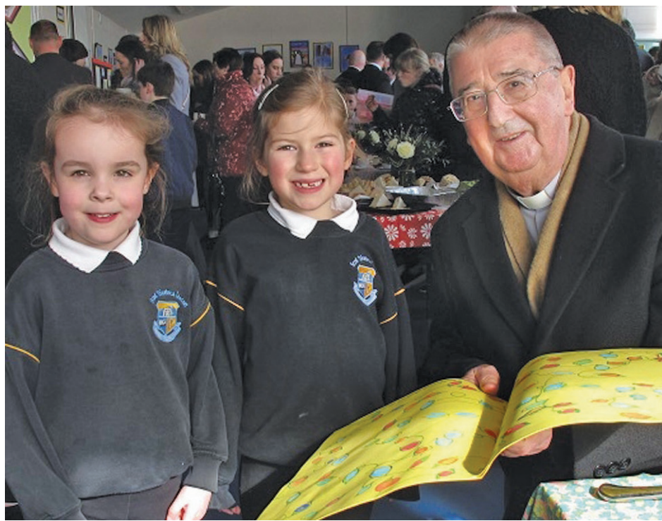
Lacken National School pupils presenting a gift to Archbishop Diarmuid Martin who attended the recent confirmation ceremony in Lacken Church.