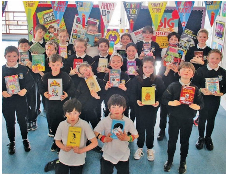
The pupils at Lacken National School, Blessington, celebrate World Book Day, which took place on Thursday 5th March.