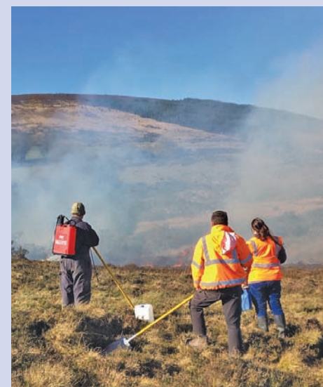
Controlled Burning at Granamore with SUAS project last year. The Uplands Council says it continues to advocate for the need to permanently extend the permissive controlled burning season to "more realistic and workable dates"

"There have been calls from some elected officials for hedge-cutting to be allowed in March. We reject this call, on the basis that it is reckless and goes against the calls of many in the farming circles for recognition of hedgerows as important habitats on farms for wildlife and carbon sequestration. In addition, we stress that hedge-cutting is already fully permitted in cases of bona fide road safety concerns."