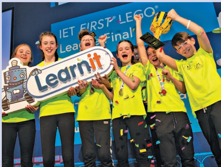
Students from Wicklow Montessori celebrate their victory

FIRST is an acronym for 'For Inspiration and Recognition of Science and Technology', and the FIRST LEGO League encourages children to think like scientists and engineers, working on real-world issues.