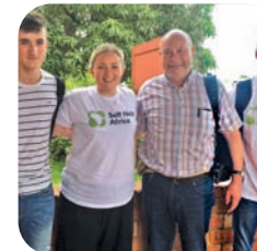
ZAMBIA page 14