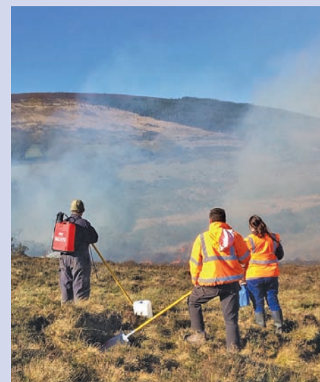
Controlled Burning at Granamore with SUAS project last year. The Uplands Council says it continues to advocate for the need to permanently extend the permissive controlled burning season to "more realistic and workable dates"

"There have been calls from some elected officials for hedge-cutting to be allowed in March. We reject this call, on the basis that it is reckless and goes against the calls of many in the farming circles for recognition of hedgerows as important habitats on farms for wildlife and carbon sequestration. In addition, we stress that hedge-cutting is already fully permitted in cases of bona fide road safety concerns."