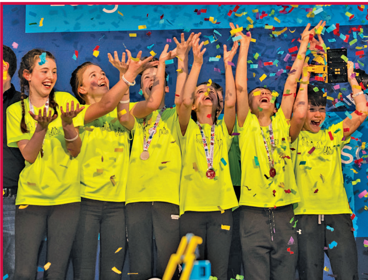
Budding engineers at Wicklow Montessori Primary School were crowned the All-Ireland Lego League Champions, and will head off to the FIRST LEGO League world finals in the USA to represent Ireland. See story page 8