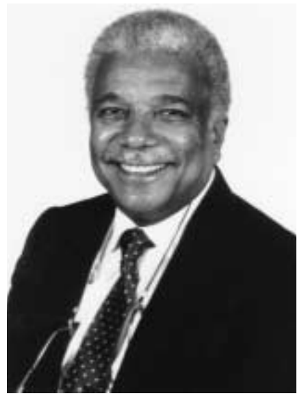
Ali M. Mazrui

Mazrui is also the author and narrator of the nine-part public television documentary The Africans: A Triple Heritage , aired around the world