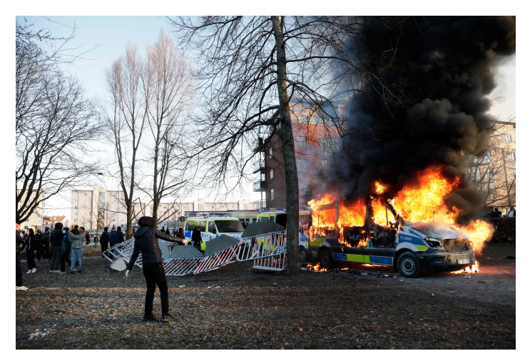
Anti-Nashist uprising in Sweden, 2022.