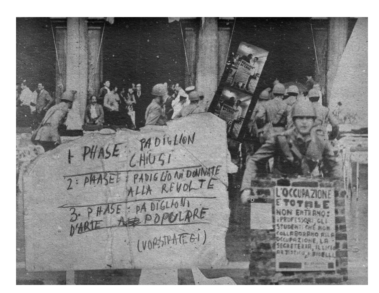
Plan for the disruption of the Venice Biennale in 1968.

The fascist gestures of Paludan and his ilk are undergirded by the "great replacement" master narrative, a conspiracy theory claiming that a secret global cabal is intent on replacing white, cis-gendered people with non-white people. This narrative is an enabling device for necropolitical racialization, stigmatization, and ultimately murder. In Paludan's antics one can also hear the echoes of Nash and Thorsen's outcry after forcing their way into the Swedish pavilion at the Venice Biennale in 1968 and transforming it into a "pavilion of revolt": "This year they don't exhibit art, but policemen." 39