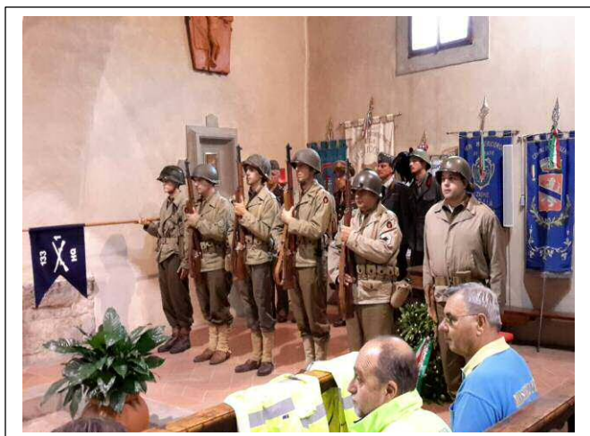
This photos shows the Italian, “Iron Man Battle Group” at a Memorial Day service at a Italian church.