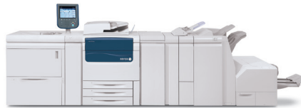
Xerox® Color C75 Press

Note: The Xerox® SquareFold Trimmer Module requires the Booklet Maker Finisher and can be used with any of the print servers for the Xerox® D Series Copier/Printer or Xerox® D Series Printer.