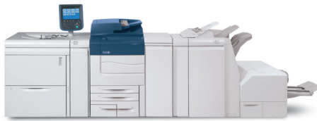
Xerox® Color C60/C70 Printer

Note: The Xerox® SquareFold Trimmer Module requires the Booklet Maker Finisher and can be used with any of the print servers for the Xerox® Color C75/J75 Presses.