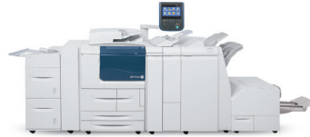
Xerox® D Series Copier/Printer

Note: The Xerox® SquareFold Trimmer Module requires the Booklet Maker Finisher and can be used with any of the print servers for the Xerox® Versant™ 2100 Press.