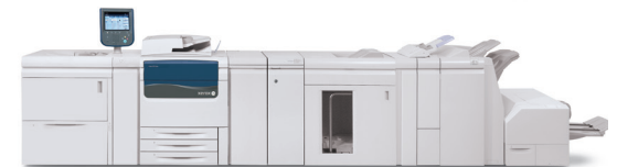
Xerox® Color J75 Press

Note: The Xerox® SquareFold Trimmer Module requires the Booklet Maker Finisher and can be used with any of the print servers for the Xerox® Color C75/J75 Presses.