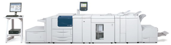
Xerox® D Series Printer

Note: The Xerox® SquareFold Trimmer Module requires the Booklet Maker Finisher and can be used with any of the print servers for the Xerox® D Series Copier/Printer or Xerox® D Series Printer.