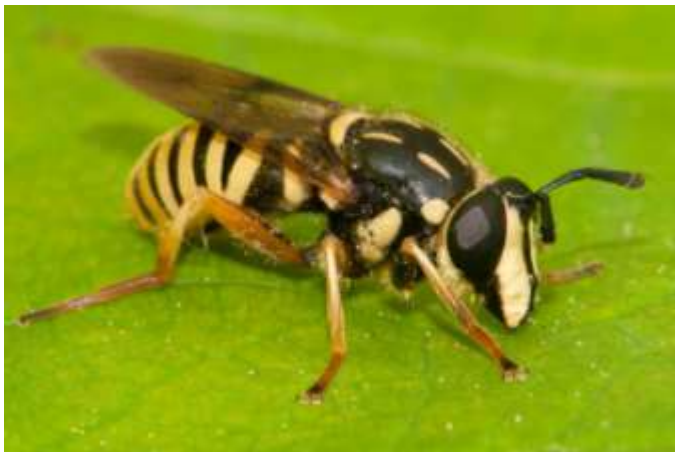
Sphecomyia vittata - This species and genus was recorded for the first time ever in Nova Scotia during the surveys.

Perhaps the most interesting species found was Heringia intensica . This species was found in Corema barrens at Bowers Meadows (13km southwest of Shelburne). Very little is known about Heringia intensica - it is only known only from a few specimens collected in Ontario, it hasn't been collected anywhere else in Canada or the US. Heringia in general is a poorly understood genus, it has not been studied in detail since the 1920s, and many museum specimens remain unidentified. Nonetheless, the specimen collected in this study represents the only records for the species from outside of Ontario.