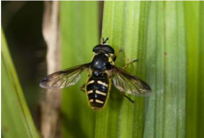
Sericomyia chrysotoxoides - a common and widespread flower fly

The documentation of such disjunct populations is important from a national conservation perspective, as many of these species may be found nowhere else in Canada. These disjunct populations might also be very important for the pollination of Atlantic Coastal Plain flora. Documenting the bee and flower fly community of the Atlantic Coastal Plain is a first step in identifying species with special relationships with rare plant hosts. Nova Scotia's Atlantic Coastal Plain was specifically mentioned by Sheffield et al. (2003) as one of three areas in the province that would benefit most from studying bee-floral host relationships.