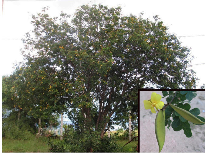
Fig.1. A tree of Poincianella pyramidalis . Inset: flower and pods of the plant.

In October 2013, on a visit to a farm in Belém do São Francisco municipality, located in the semiarid region of the state of Pernambuco, Brazil, after a shortage of forage in the pastures, a flock of 350 sheep and 6 rams were transferred to an area of native vegetation (caatinga) with large amounts of P. pyramidalis . After 70 days in the pasture,