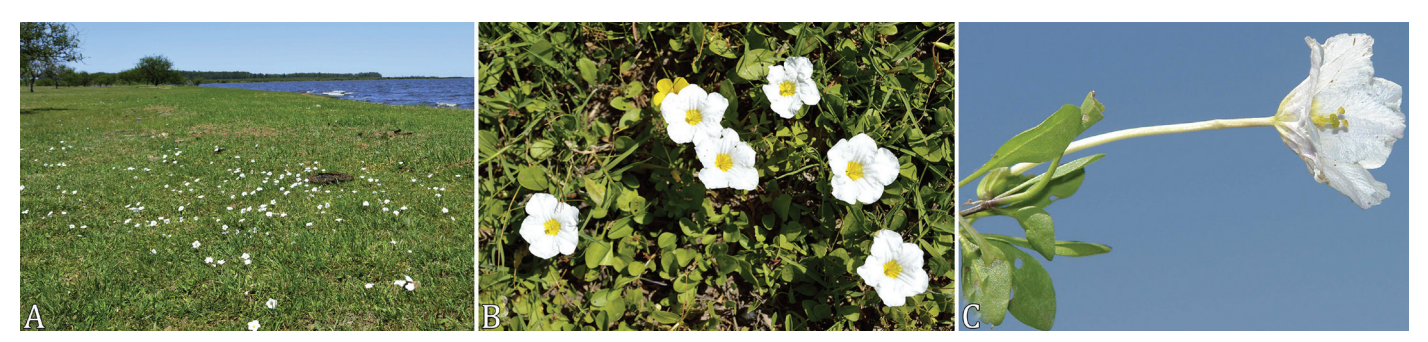
Fig.2. Location of outbreaks of enzootic calcinosis in sheep caused by Nierembergia rivularis in Uruguay. (A) Outbreak A. The border of the Rincon del Bonete lake is invaded by the plant. (B) Natural pasture invaded by Nierembergia rivularis . (C) Details of the flowering plant.

The cadavers were emaciated and showed widespread soft tissue calcification. Muscular and elastic arteries were diffusely rigid, with marked loss of elasticity. The intimal surface was irregular with multiple white, prominent, and multifocal-to-coalescing intramural plaques (Fig.3B). The bicuspid and semilunar aortic valves exhibited similar plaques that were also identified in the tendinous and endocardial cords. The lungs did not collapse and showed multifocal calcification, mainly in the caudal lobe. The kidneys exhibited whitish, opaque, linear, and radially arranged striations in the cortical and medullary region (Fig.3C). Marked thickening of