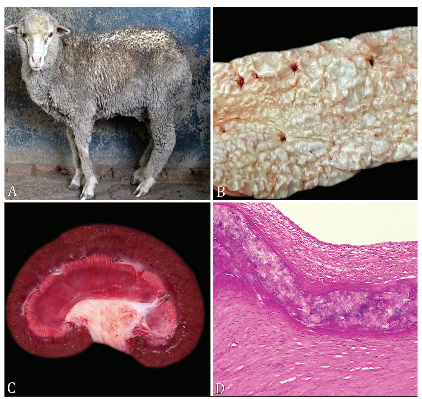
Fig.3. Enzootic calcinosis in sheep caused by Nierembergia rivularis in Uruguay. Outbreak B. (A) Sheep exhibiting kyphosis, retracted abdomen, poor body condition, and arched limbs. (B) Aorta. Diffusely irregular intimal surface with extensive calcified plates. (C) Kidney. Nephrocalcinosis characterized by white streaks radially arranged at the corticomedullary junction. (D) Carotid artery. Moderate intimal hyperplasia and tunica media calcification. HE, obj.10x.

Mild to marked calcification of the alveolar septa occasionally replaced the lung parenchyma with dense areas of calcification with bone and chondroid metaplasia. Calcification was also verified on renal tissues, affecting the distal tubular lumen, arterioles, and interstitium. Thyroid C-cell hyperplasia and carcinoma were observed in Sheep A (Machado et al. 2020). Sheep B showed thyroid C-cell hyperplasia and parathyroid chief cell atrophy. The parathyroid was not examined in Sheep A. In Sheep B, the cortical bones were moderately thickened,