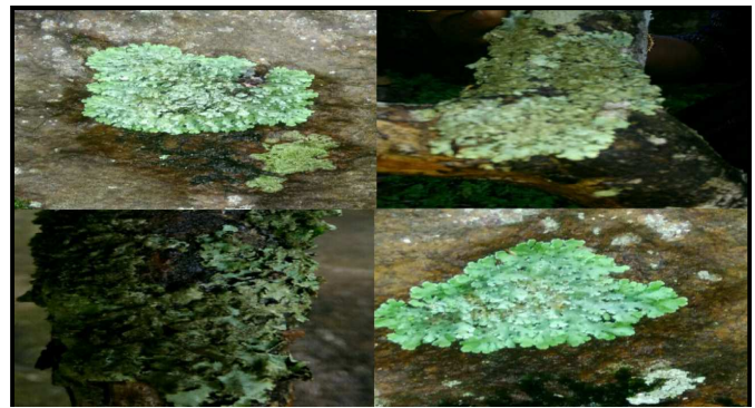
Figure No.1: Habit of Hypotrachyna infirma

Gokilavani R and Rehana Banu H. / Asian Journal of Phytomedicine and Clinical Research. 8(2), 2020, 95-103.