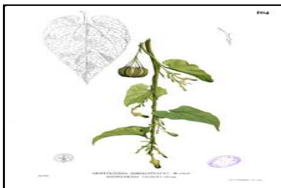
A. acuminata habitus drawing

A.bracteolata is used in Sudanese folkloric medicine for the improvement of health by increasing body weight and treatment of various disorders. Bovans-type chicks were fed 10% A.bracteolata seed and 5% mixture of A.bracteolata and Astragalus gummifer of standard diet for two weeks. The given concentration mixture of the plants were toxic but not lethal to chicks and caused reduced body weight gain. Mild diarrhoea was observed in te chicks on the 5% mixture of two plants. Alteration of serum AST and ALT activities and total protein, albumin, globulin, cholesterol and uric acid were correlated with changes in haematology and pathological effects on vital organs 19 .