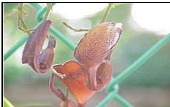
A. maxima flowers