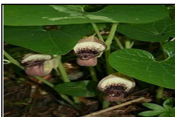
A. pontica flower