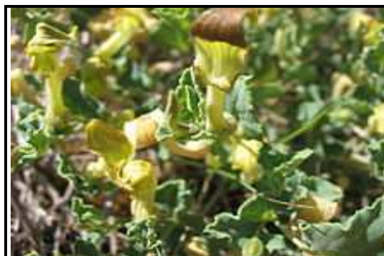
A. pistolochia flowers