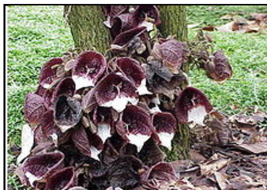
A. arborea flowers