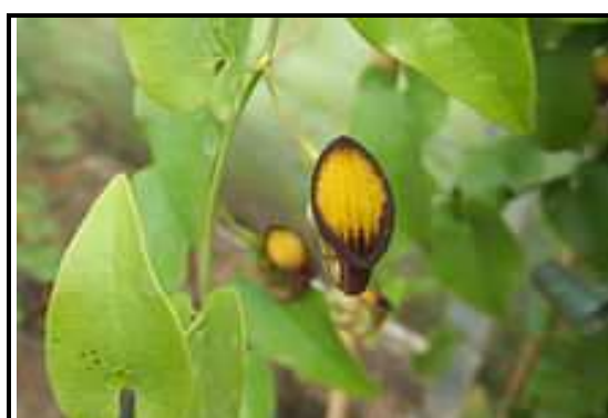
Figure No.1: Species of Aristolochia