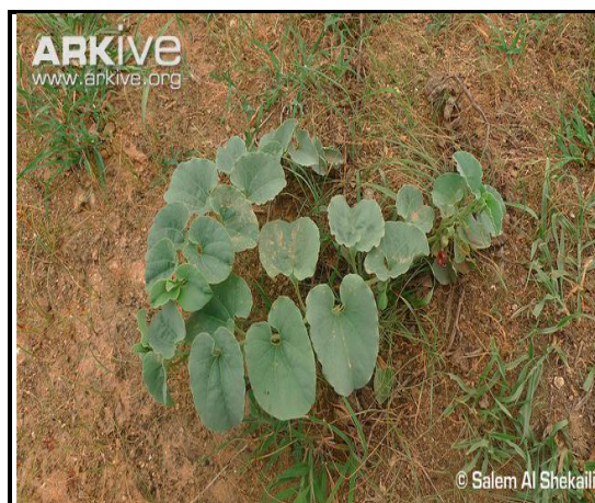
Figure No.2: Leaf of Aristolochia