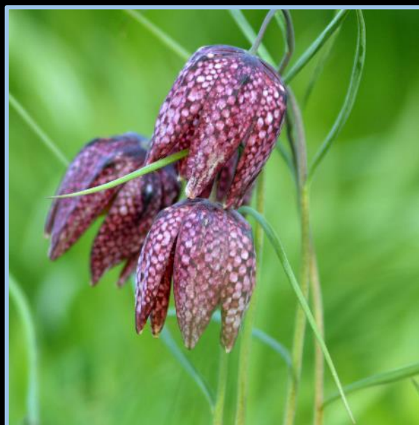
Fritillaria meleagris