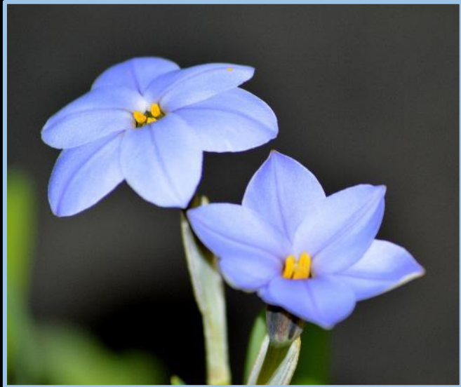
Ipheion 'Rolf Fiedler' – Mac Dunlop