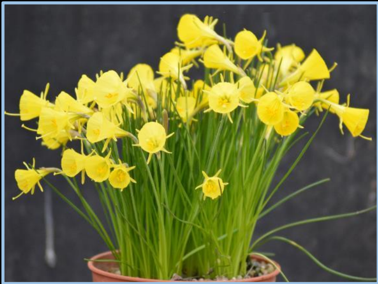
Narcissus bulbocodium v conspicuus – Mac Dunlop