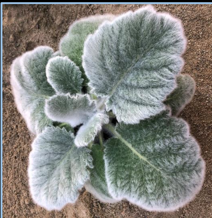
Salvia argentea – Moyra McCandless