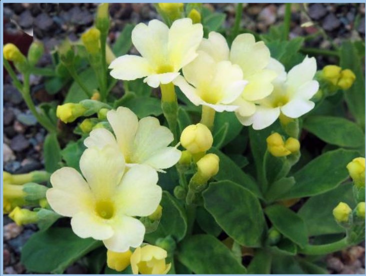
Primula 'Timpany lemon'