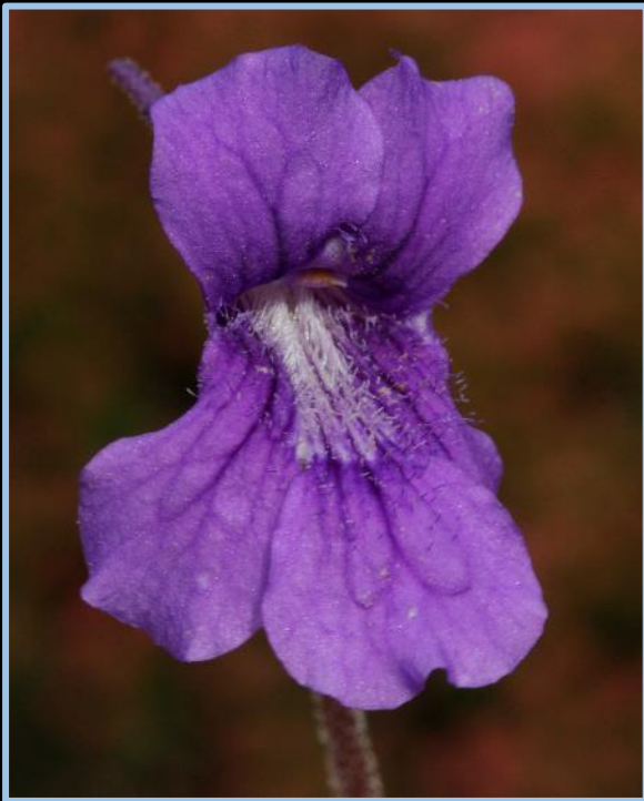
Pinguicula grandiflora