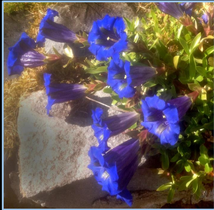
Gentiana acaulis