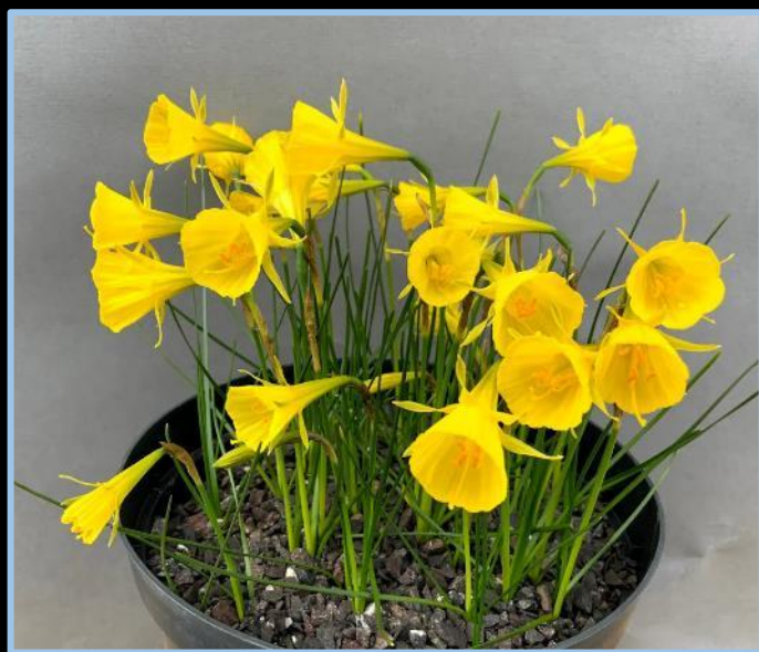
Narcissus conspicuus