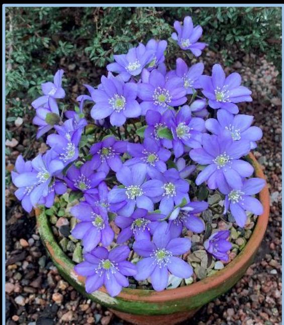
Hepatica nobilis