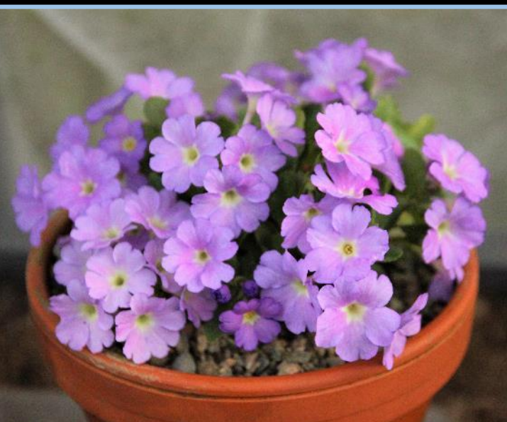
Primula allioni 'Lindum Wedgwood' – W&H Mckelvey