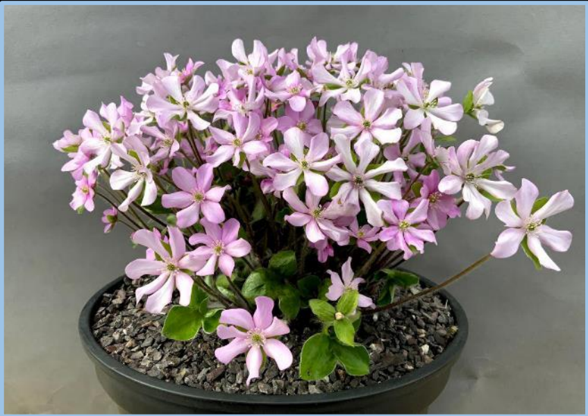
Hepatica maxima x pubescens – Paddy Smith