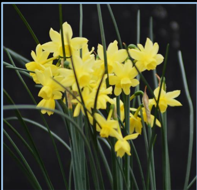
Narcissus 'Angel's breath'