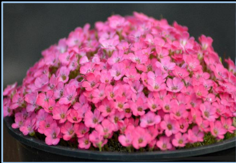
Saxiraga 'Coolock Kate'