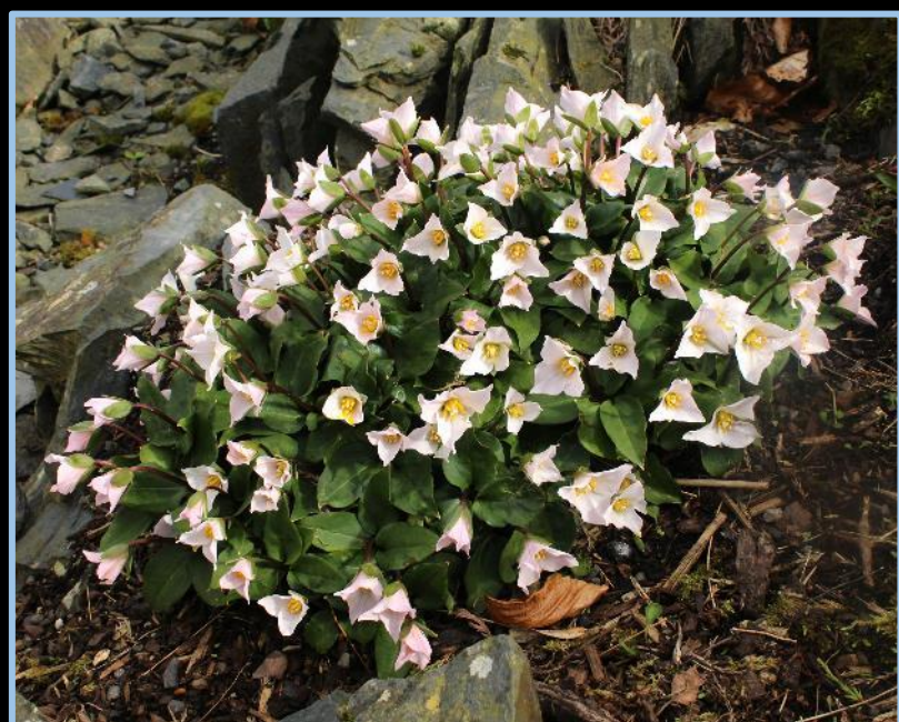
Trillium rivale – Liam McCaughey