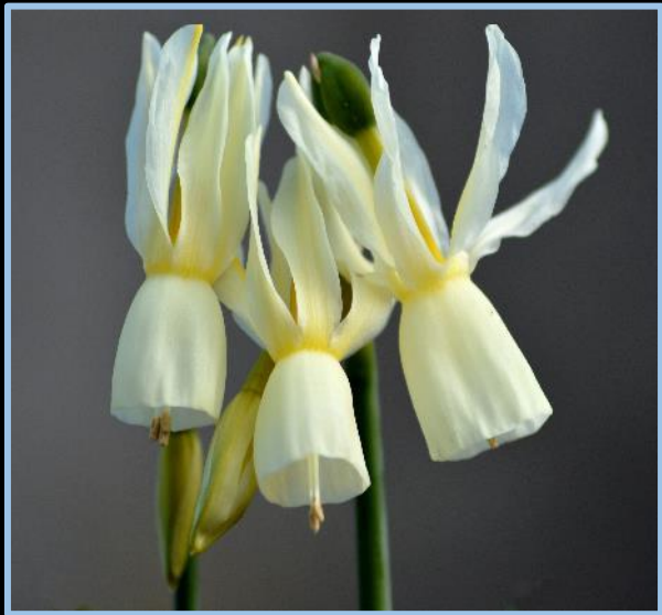
Narcissus triandrus