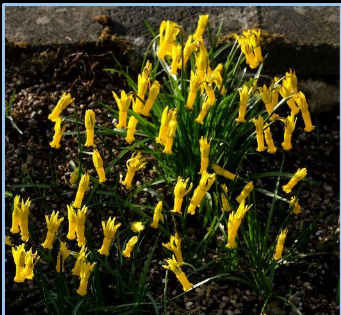
Narcissus cyclamineus – Pat Crossley