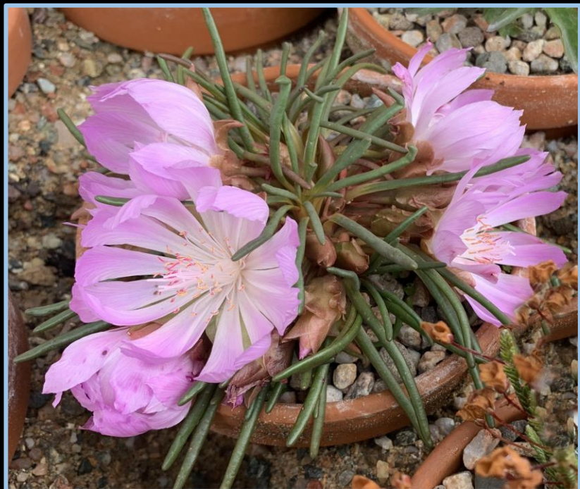
Lewisia rediviva