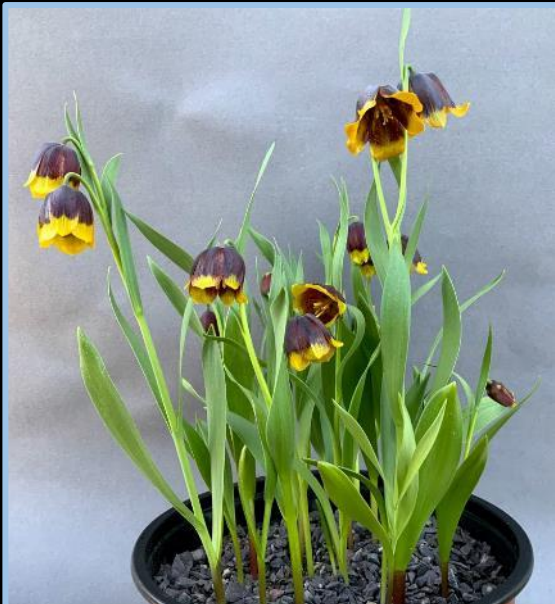
Fritillaria michailovskyi