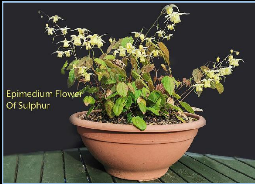
Epimedium Flower Of Sulphur