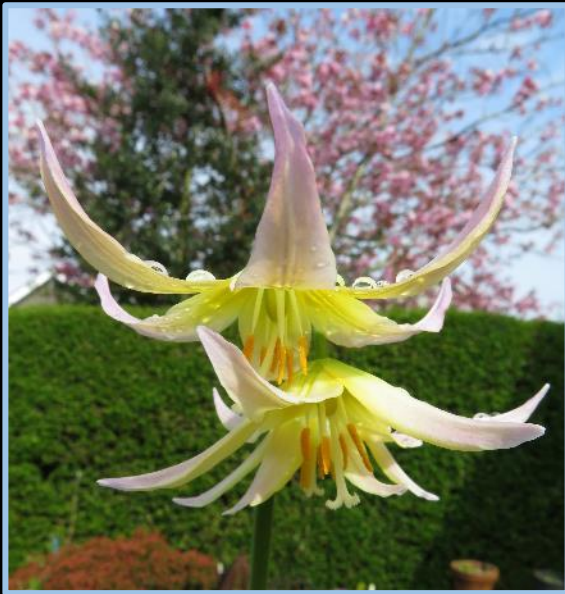
Erythronium 'Joanna'