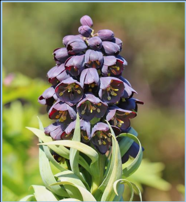
Fritillaria persica