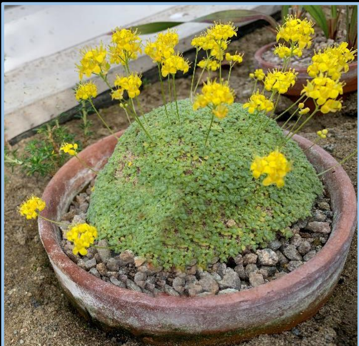
Draba mollissima - Montalto