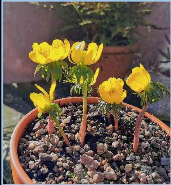
Eranthis hyemalis