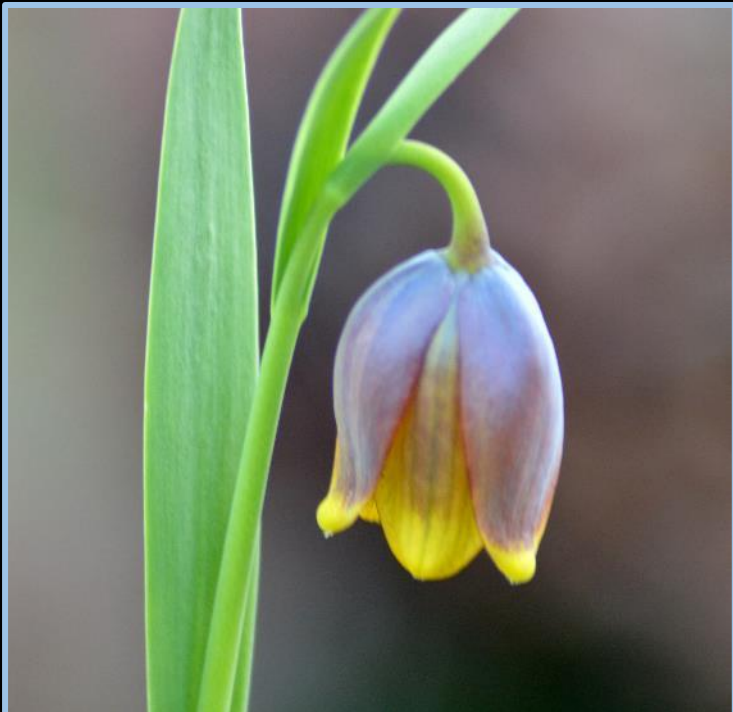
Fritillaria assyriaca