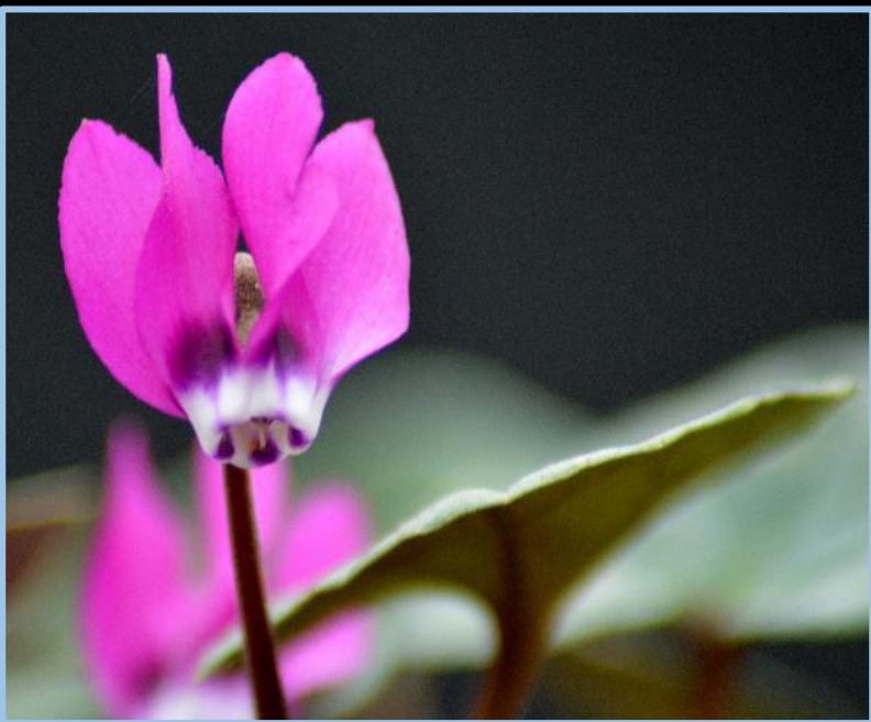
Cyclamen pseudibericum – Mac Dunlop