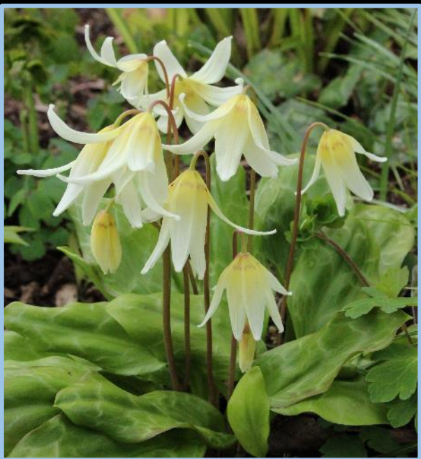
Erythronium 'White Beauty' – W&H McKelvey