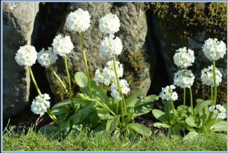
Primula denticulata alba – Mac Dunlop