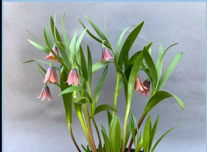
Fritillaria minima