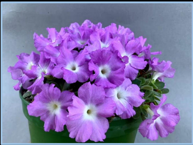
Primula allioni 'Joe Elliott'