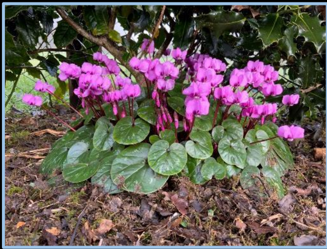
Cyclamen coum