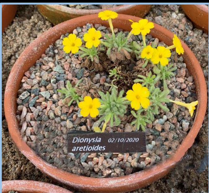
Dionysia aretioides