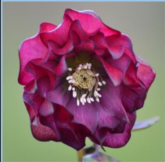
Helleborus – Ashwood seed – Mac Dunlop