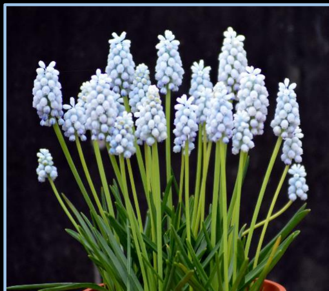
Muscari sp.