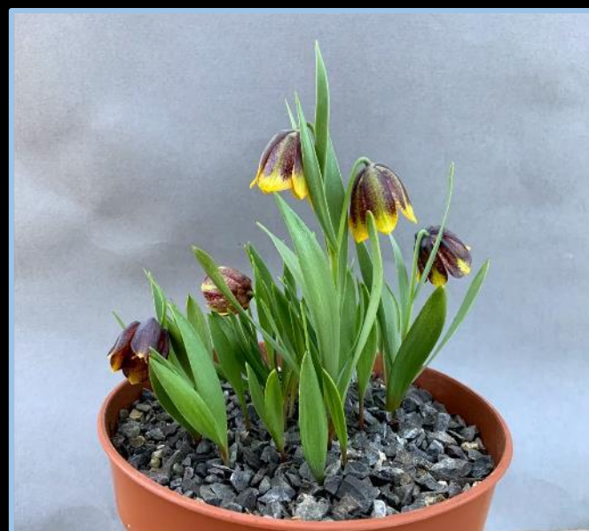
Fritillaria crassifolia Kurdica