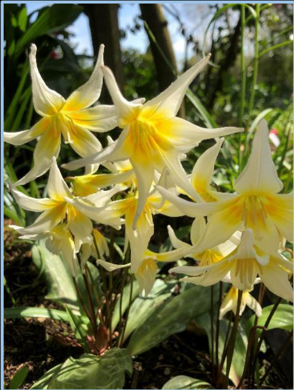
Erythronium cliftonii – Moyra McCandless