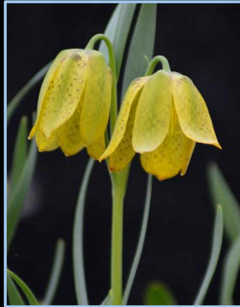
Fritillaria kurdica