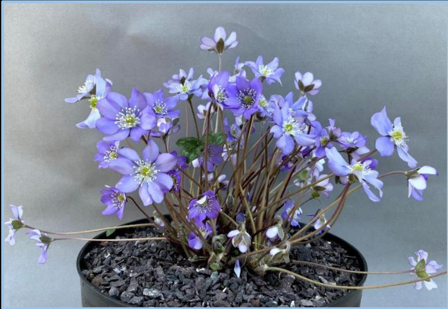
Hepatica nobilis