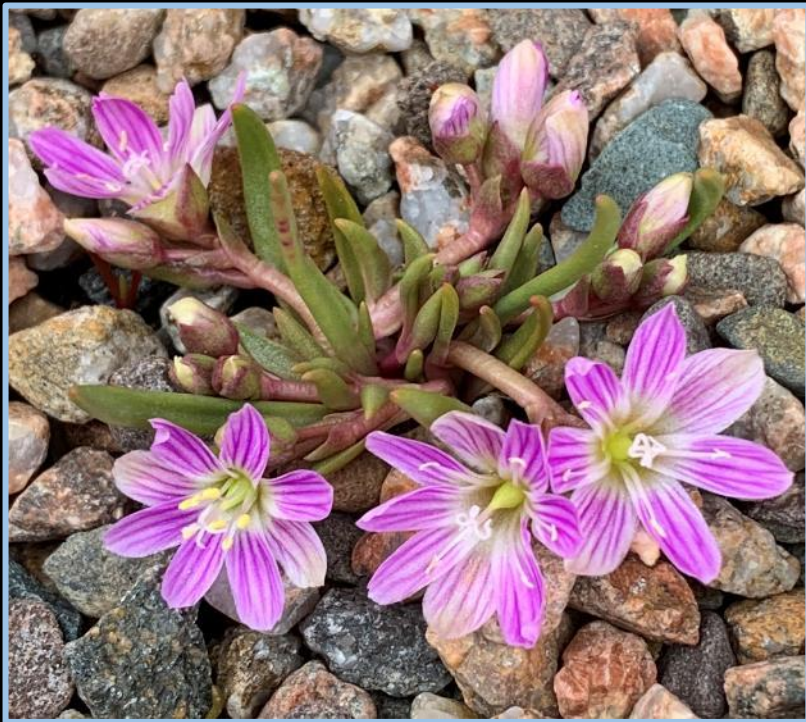
Lewisia pygmaea