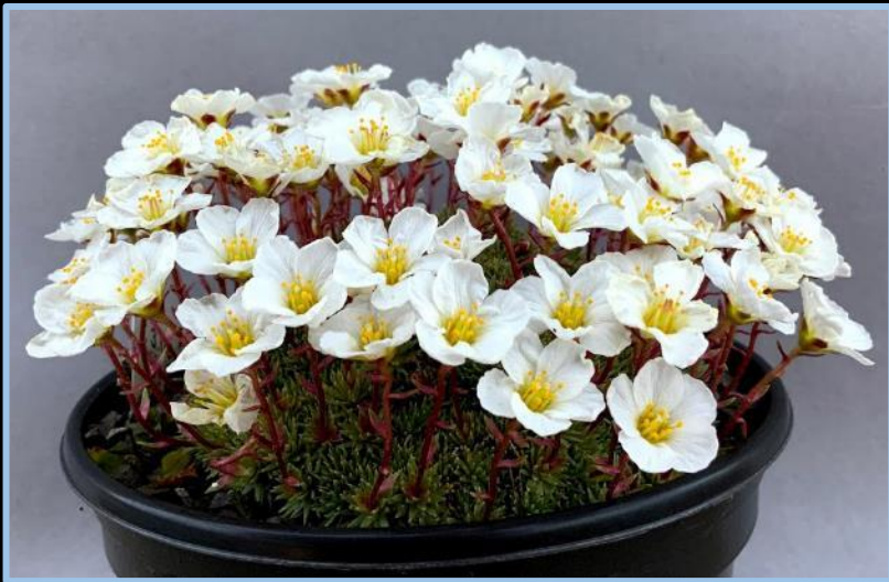
Saxifraga burseriana