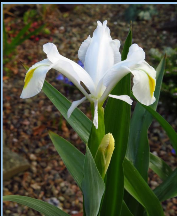
Iris Juno, Turkey