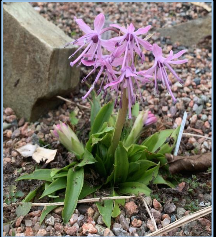
Heloniopsis japonica