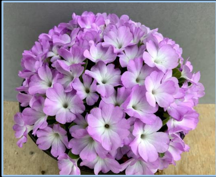
Primula allioni 'Adrian Jones