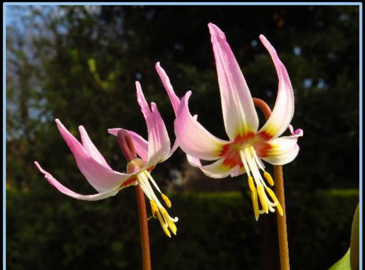
Erythronium 'Rosalind'