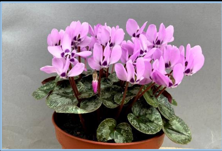
C. pseudibericum roseum ex CSE 'PS' 0200IT – Paddy Smith