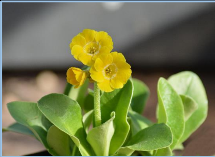
Primula auricula