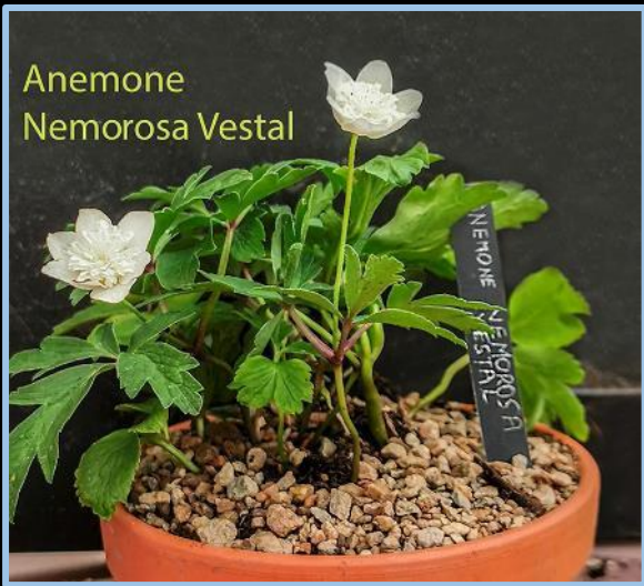
Anemone nemorosa 'Vestal'