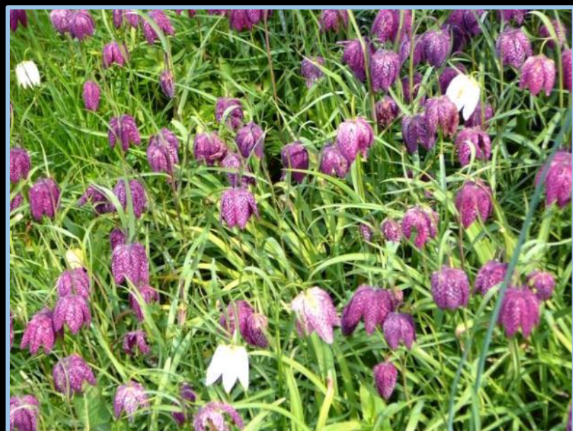
Fritillaria meleagris