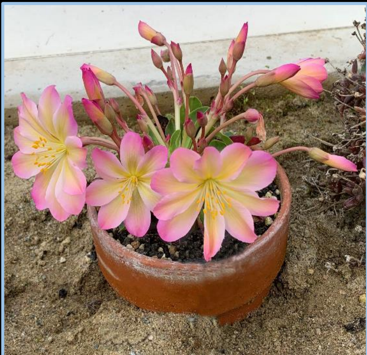
Lewisia – Montalto Estate