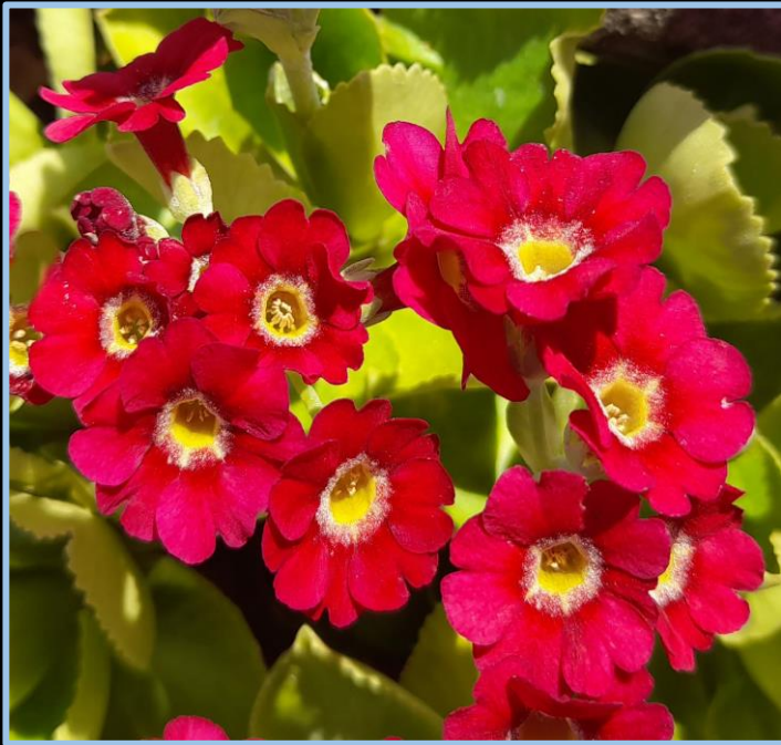
Primula 'Rufus' – Cilla Dodd