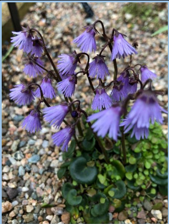
Soldanella carpatica – Moyra McCandless