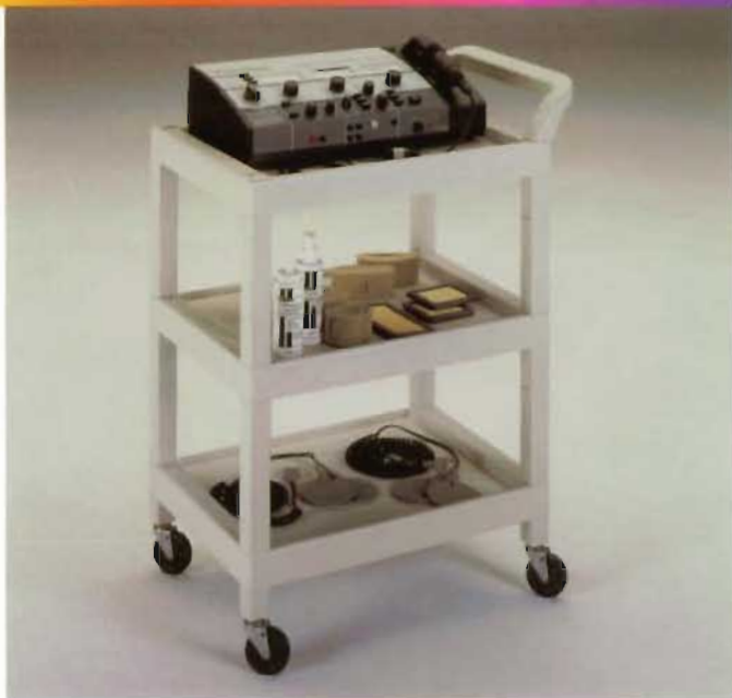
SynchroSonic U/HVG50 with optional three shelf utility cart