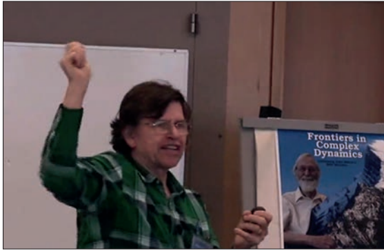
Thurston lecturing at “Jackfest”, Banff, 2011.

we planned to meet in Manhattan to discuss holomorphic dynamics in one variable and the analogy with hyperbolic geometry and Kleinian groups that I had been preoccupied with. We were not disciplined and began talking about other things at the apartment; we finally got around to our agenda about thirty minutes before Bill had to leave for his train back to Princeton. I sketched the general analogy: Poincaré limit set, domain of discontinuity, deformations, rigidity, classification, Ahlfors finiteness theorem, the work of Ahlfors-Bers,...to be compared with Julia set, Fatou set, deformations, rigidity, classification, non-wandering domain theorem, the work of Hubbard-Douady..., which he perfectly and quickly absorbed until he had to leave for the train. Two weeks later we heard about his reformulation of a holomorphic dynamical system as a fixed point on Teichmüller space, analogous to part of his hyperbolic theorem. There were many new results, including those of Curt McMullen some years later, and the subject of holomorphic dynamics was raised to another higher level.