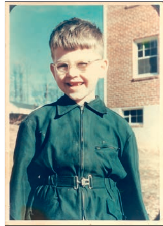
Bill Thurston, 1952, Wheaton, MD.