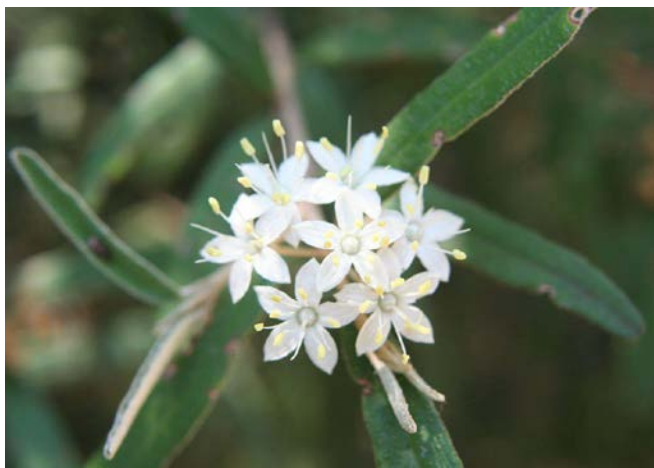
Phebalium daviesii – St. Helen's Wax-flower