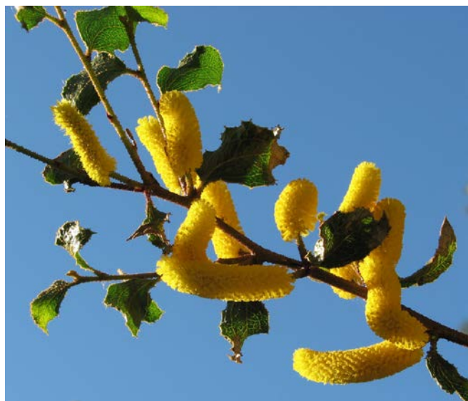
Acacia denticulosa – Sandpaper Wattle