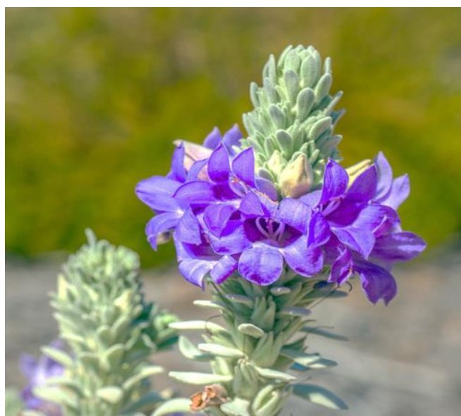
Eremophila mackinlayi – Photo: Russell Scott

There were a large number of Chamelaucium s on display, and it seems to have been a very good year for them. They ranged in colour and size from the large white flowers of Seeton's form, through all the pinks of the C. uncinatum forms, to a tiny, deep purple C. floribundum . Great plants which everyone should be growing.