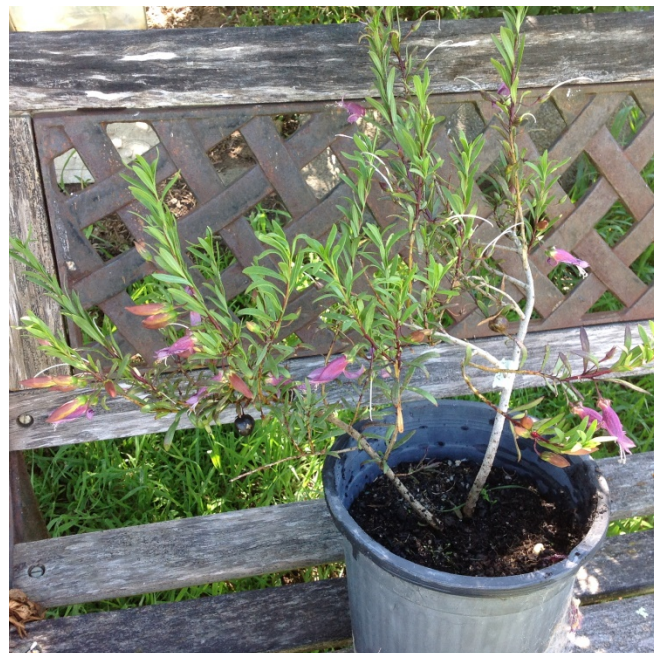
Carmel's Eremophila maculata

Carmel's specimen was a lovely pink/purple, with a heavily spotted throat, which she is growing in a pot. It was struck from a cutting in August 2014.