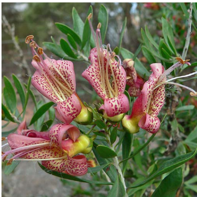
E. maculata 'typical' flowers.

Eremophilas have always been popular garden plants, and have become more so since the beginning of the century, when people were looking for drought tolerant plants. The name ' eremophila ' is derived from the ancient Greek - erêmos meaning "lonely" or "wilderness" and phílos meaning "dear" or "beloved", so 'beloved of the lonely wilderness' or desert.