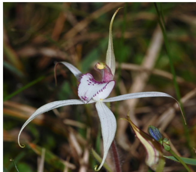
Caladenia pumila – Inverleigh Common

There are many such projects happening, whether they be structured like the Koala Count or the Aussie Backyard Bird Count, or just a random encounter with a rare or unusual species. This last was beautifully illustrated a few years back when, in 2009, a couple of amateur orchid photographers discovered the tiny Caladenia pumila on the Inverleigh Common. This orchid was believed to be extinct since the 1920s.