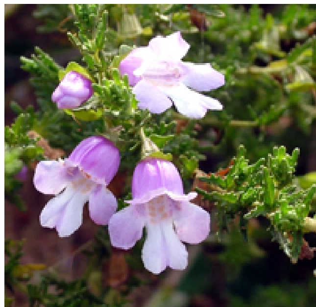
Prostanthera cryptandroides – Wollemi Mint-Bush