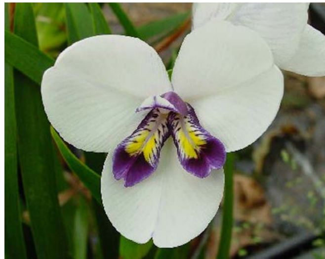
Diplarrena latifolia – Western Flag Iris