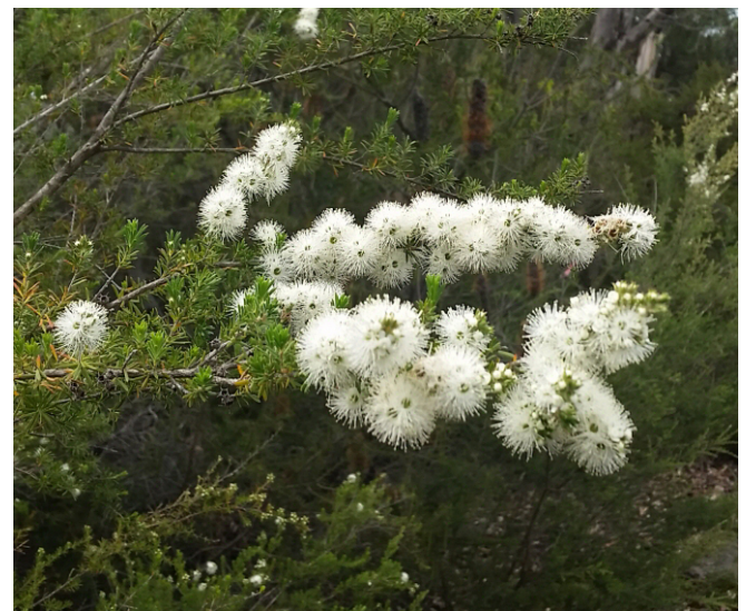
Kunzea ambigua – Tick Bush

Grevilleas always feature given their variety of form, colour and flowering seasons. There seems to be a Grevillea in flower every month. This month was no exception with G. treueriana , G. paradoxa , and G. zygoloba as true species, and many cultivars including G. 'Caloundra Gem' , G. 'Red Hooks' , and G. 'Molly' . There was a lovely hybrid G. longifolia x G. 'Honey Gem' , which produced vibrant red longifolia-type flowers and a compact little G. lavandulacae x G. alpina with lovely bright pink flowers.