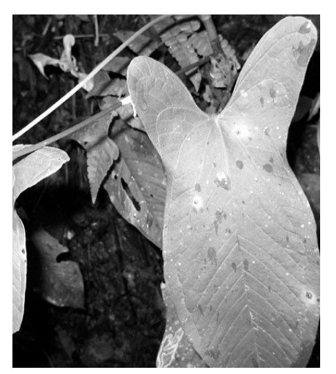
Fig. 10: New species of Anthurium with narrowly ovate-cordate blades (Croat 91641)

Disappointed that there was no road to Guayzimi, we pursued a side road. It ended at a steel fence with a gate and armed guard. After turning around, we stopped at an excellent site among huge boulders (this apparently discouraged attempts to clear it for farming). The area had two new,