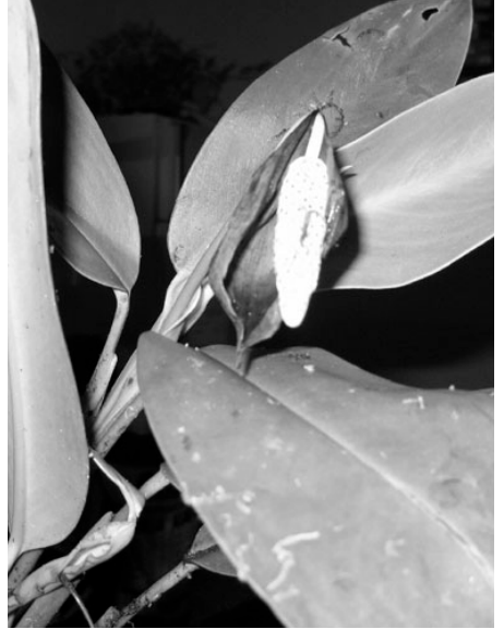
Fig. 5: Stenospermation killipii Croat & A. P. Gomez

there is a bridge over the Río Zamora and a road on the other side of the bridge leads into the mountains and to the village of El Sarsa (Fig. 7). Another road at the far end of the Los Encuentros bridge goes to the right, along the Río Zamora, then follows the Río Nangaritza, apparently extending all the way to the town of Paquisha. At 1455 m elevation, we found a second collection of Chlorospatha portillae , as well as A. lapoanumi Croat, a very attractive new member of section Cardiolonchium . We have not yet made