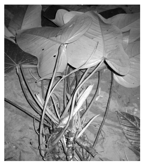
Fig. 12: Anthurium bomboizoanum (Croat 91573)