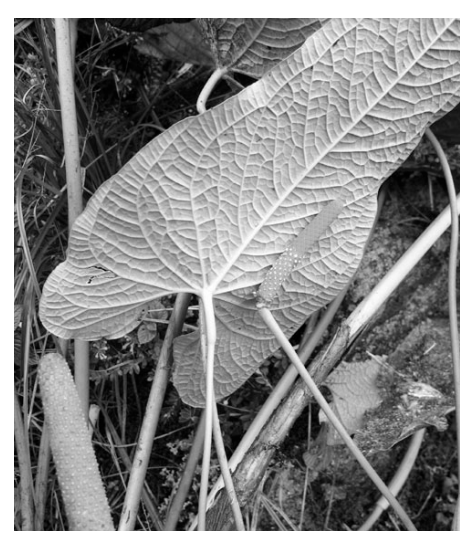
Fig. 15: Anthurium tuntiakii (Croat 92687)