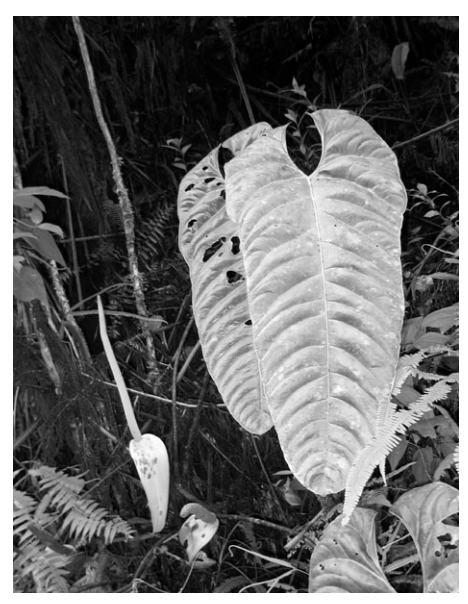
Fig. 8: Anthurium effusispathum (Croat 91000)

Driving a road beyond Paquisha, which according to the map led to the summit of the Cordillera, eventually ended in a landslide. We were able to go only