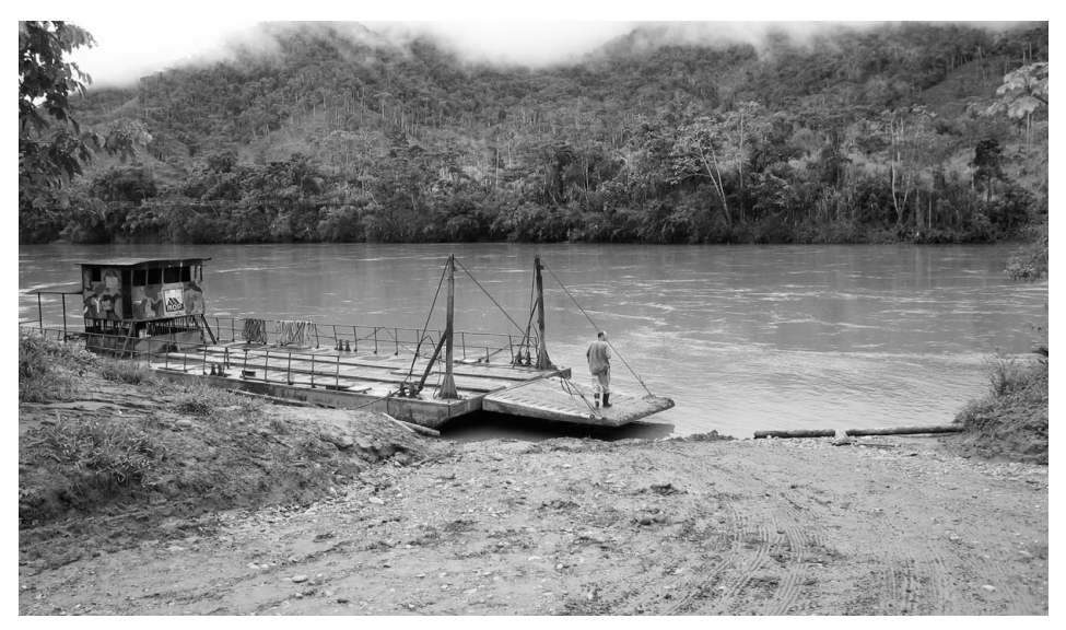
Fig. 3: Quime ferry crossing the Río Zamora, 6.8 km S of Chuchumbletza

small hotel near the bus terminal. The previous year we had spent several days around El Panguí, the home town of Pepe Portilla, the now famous orchid and aroid dealer in Gualaceo. However, since no bus goes directly from Panguí to Quito, shipping plants was not possible. For this reason, we decided to stay in Yantzaza, farther to the south.