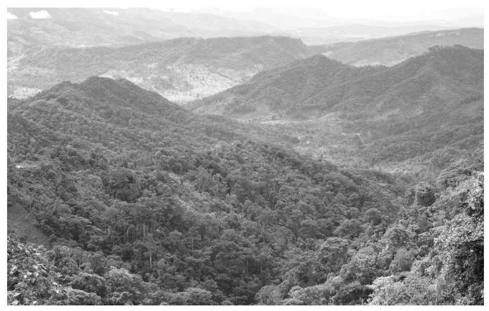
Fig. 7: Cordillera del Condor, road to El Sarsa

it to the end of this road, so that still needs to be pursued. We pressed plants in a hotel in Yantzaza, taking over a small meeting room where we could spread the big 14 x 16 foot tarp out to its limit. From here, we were able to ship our next big shipment of plants back to Quito by bus.