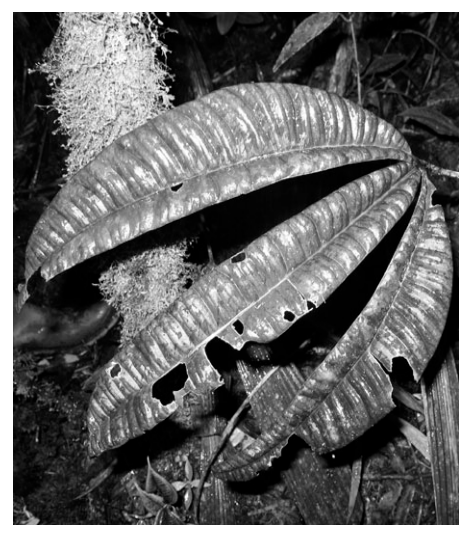
Fig. 14: Anthurium cutucuense (Croat 92105)