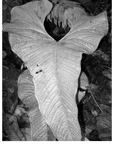
Fig. 4: New species of Anthurium section Belolonchium (Croat 91015)

Back on the main road, we drove south to El Panguí and spent the night in a