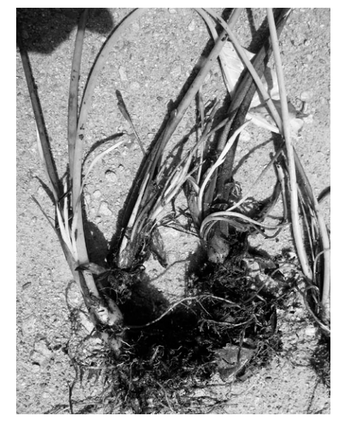
Fig. 6: Chlorospatha portillae Croat & L. P. Hannon (Croat 91089)