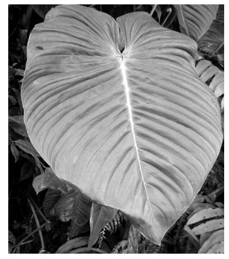
Fig. 16: Possible new species of Philodendron (Croat 92783)

umbricolum Engl., Dieffenbachia killipii Croat & Grayum, Philodendron acutissimum Engl., P. clarkei Croat, P. sparreorum Croat, P. subhastatum Engl., P. tenue K. Koch, P. verrucosum Mathieu ex Schott, Stenospermation densiovulatum Engl. and S. sodiroanum Engl. We also collected what appears to be a new species of Philodendron (Fig. 16, Croat 92783). Later we saw the same species at 580 m near Guasaganda in Cotopaxi Province.