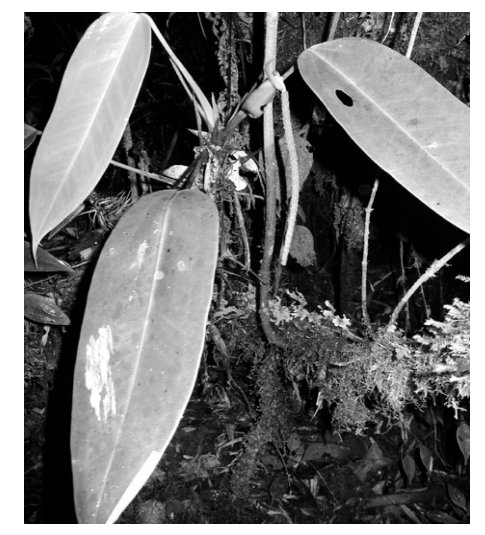
Fig. 13: Anthurium chloros (Croat 92092)

Returning to Loja, we put Greg and Tuntiak on a bus for Quito, with 12 bags of plants. Greg had agreed to work with me for only one month and was due back in Quito. Lynn and I headed for Guayaguil. We collected in the cloud forest areas between Balsas and Piñas in El Oro Province at 400-1000 m. This is a strange phenomenon because most of the western slopes are very dry, but this narrow band of rich forest lies where the afternoon clouds gather on the mountainside and it is surprisingly rich in aroids. Species found here include: Anthurium argyrostachyum Sodiro, A. cavispatha Croat & J. Rodríguez, A. dolichostachyum Sodiro, A. mindense Sodiro, A. propinguum Sodiro var. albispadix Croat, A.