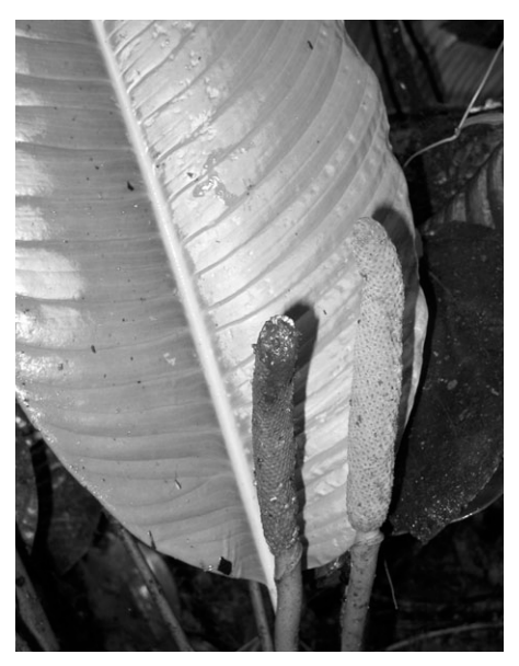
Fig. 1: Possible new species of Rhodospatha (Croat 90609)

The year before, we had arrived in Gualaquiza late at night in a rainstorm. Bundles of specimens in paper, not yet described, were soaked and we had to