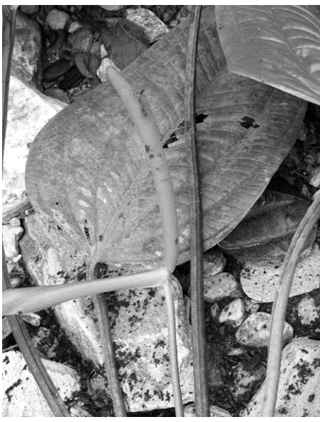
Fig. 2: New species of Anthurium section Digitinervium (Croat 90936)

more or less scrape them out of the back of the truck. This time we arrived before dark and it was not raining, which was a nice change. The next morning we traveled from Gualaquiza farther south toward Yantzaza, one of the gateways into the Cordillera del Cóndor. The road between Gualaquiza and El Panguí is now in good condition. Along the way, we crossed over the Río Chuchumbletza and the border of Zamora-Chinchipe, then