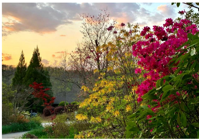
Sunset in the Kohli Garden