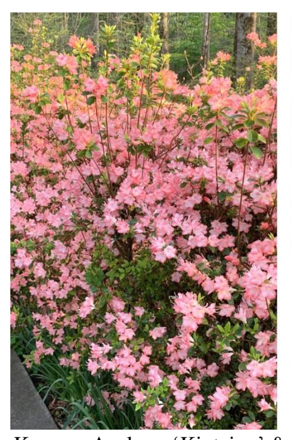
Kurume Azaleas: 'Kintaiyo' & 'Mizu-no-Yamabuki'