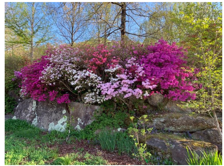
Azaleas Growing on a Rock Ledge