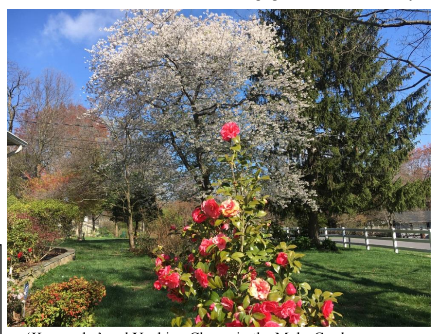
'Kumasaka' and Yoshino Cherry in the Mohr Garden

We wish everyone peace and good will through this very difficult time. This ordeal will pass and then we can get together again. Take care and stay safe.