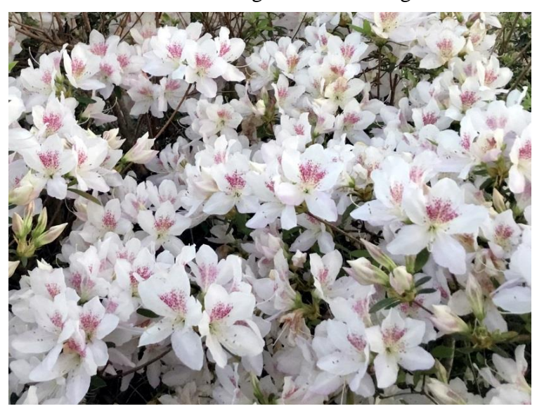
Kohli Hybrid: 'Breaking White'