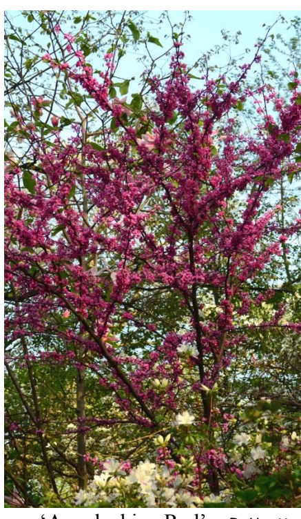
'Appalachian Red' D. Hyatt