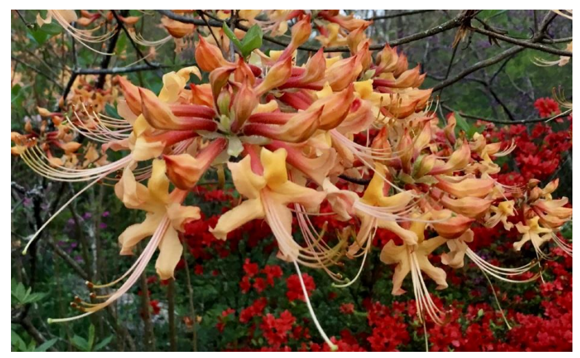
R. austrinum 'Biltmore'