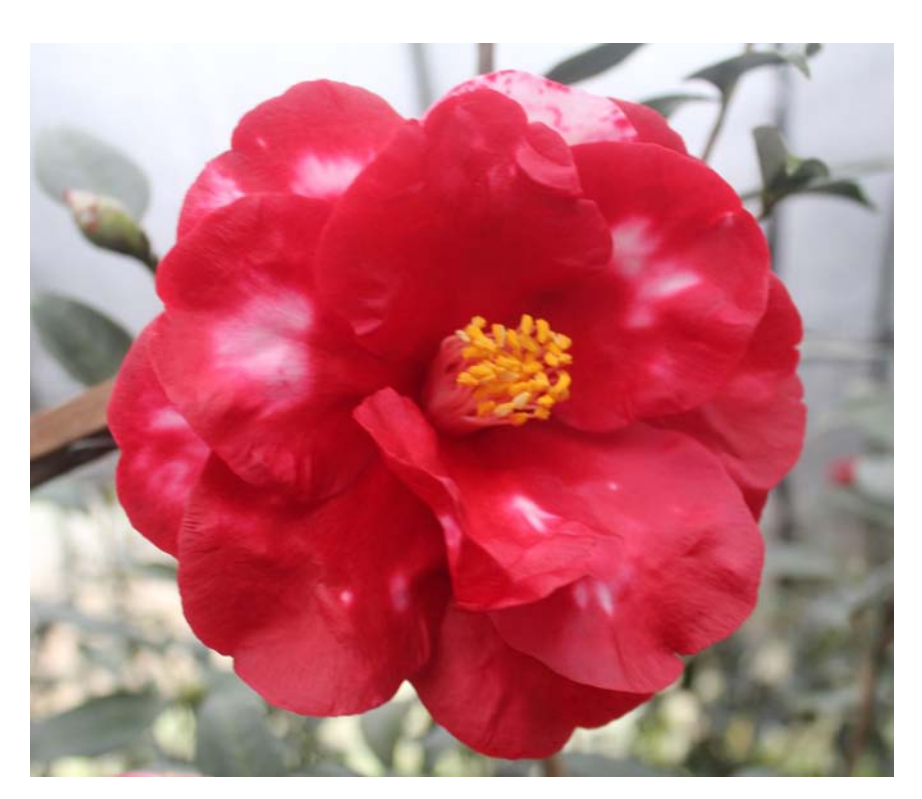
Royal Velvet Var.