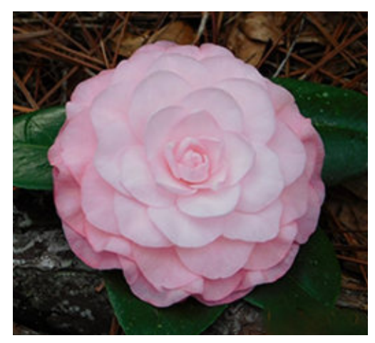
Aileen Wade Chastain

In 2021, WE ARE going to have a spring meeting and a convention in the Fall. Only a hurricane will be able to stop us getting together for the ACCS Convention. Until we see each other in 2021 remember to pay your dues, stay safe, and enjoy all the pretty flowers that you spent so much time nurturing in 2020. It has been so warm that flowers have been more beautiful than in the past few years.