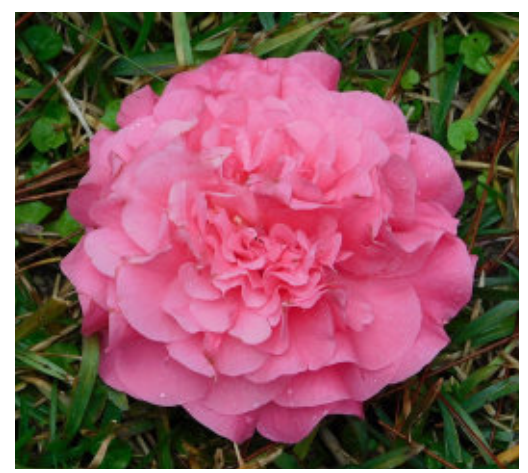
Bill Hightower (Retic)