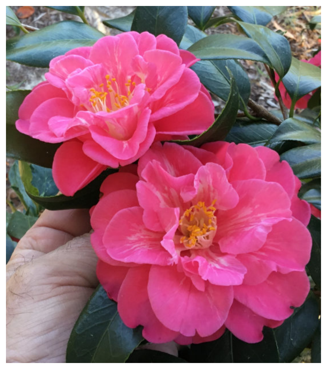
Unnamed Japonica Seedling