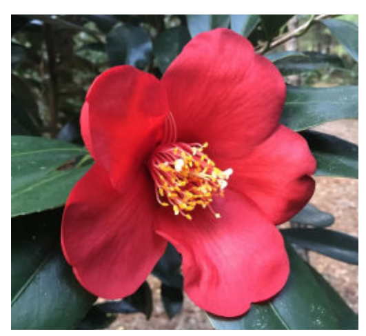
Mark C. (C. Azalea Hybrid)