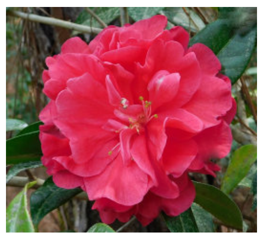
Gayle Lawrence (Retic)