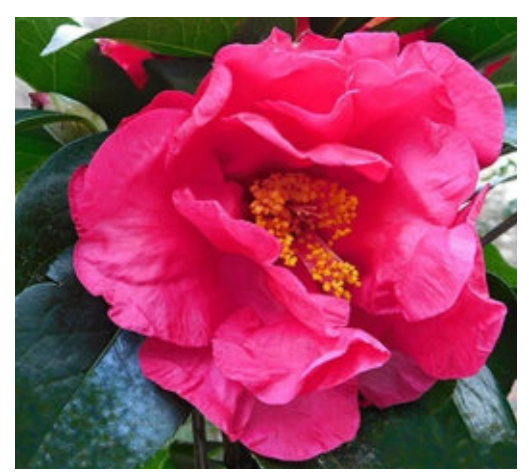
Carl Randolph Maphis (Retic)