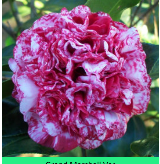
Grand Marshall Var

I do not consider camellias hard to grow. They require little maintenance once established. They're understory plants so they like to be planted in a semi shaded area like under trees. You don't want them planted in too deep of a shaded area or you risk not getting any blooms. Once my garden turned one vear old the plants required little aftercare. The garden has in ground irrigation and other than the occasional fertilization they are not demanding. fertilize my plants with 4-8-12 azalea/ camellia fertilizer twice a year -- once in March, then again in July. A third application of fertilizer is made in September using 0-0-22. Pruning is a