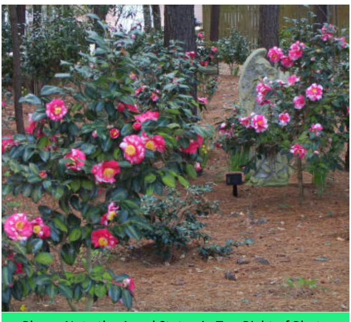
Please Note the Angel Statue in Top Right of Photo

earlier, I know they are both with me in spirit in the garden. For anyone who has visited my garden you know that I have a large statue of an Angel in the garden. At the base of that angel statue are the two bronze markers bearing the names of my mother and grandmother with a granite plaque that I had engraved with this saying: "Those we love don't go away...they walk beside us every day, unheard, unseen, but always near . . . still loved, still missed and very dear. Providing my health allows, my camellia garden will be