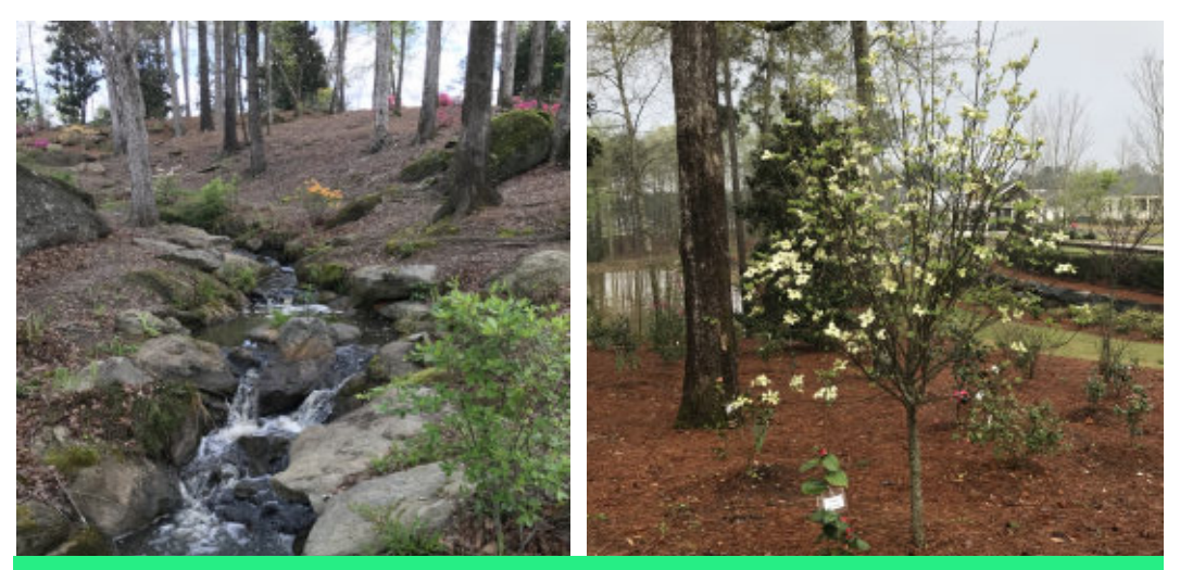
Beautiful Lanscapes of Old Town Real Estate Developent in Columbus, GA

As time went by, I began thinking about the Phase 2 installation. During 2019, I branched further away from Georgia for sources and found many new varieties in such places as Tallahassee, Baton Rouge, and a nursery in California. Before I knew it, I had accumulated another 250 varieties. These were planted in late 2019 and constituted