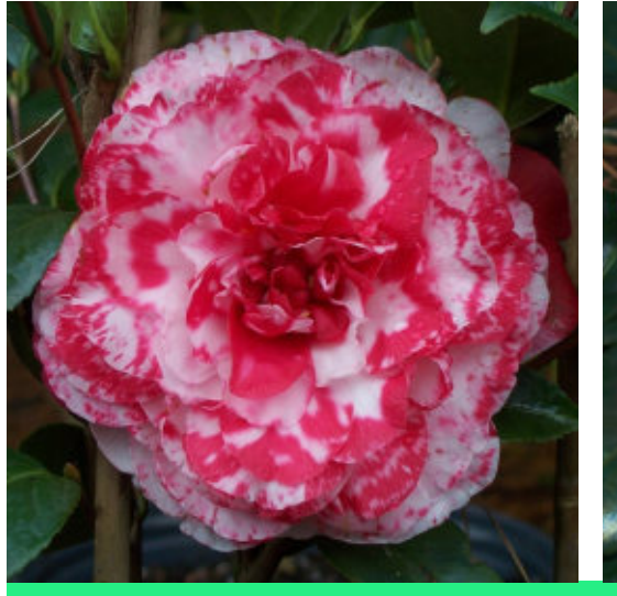
Nuccio's Bella Rosa Var