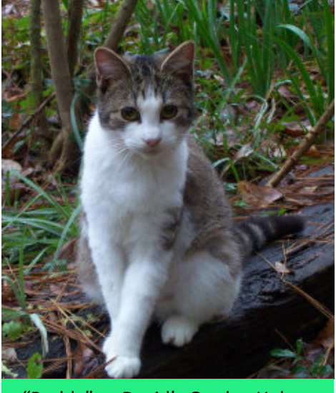
"Buddy" — David's Garden Helper

Over the years I have grown many types of plants. From the mid 80's until 1992 I was really into daylilies! So much so that I had nearly 1500 plants at one point. During the summer of 1995 my daylily garden was on the Region 15 tour. At one time I had a massive brugmansia (aka Angels trumpets) collection consisting of over 100 varieties. Although they were beautiful flowers, after a couple of years of growing them they just