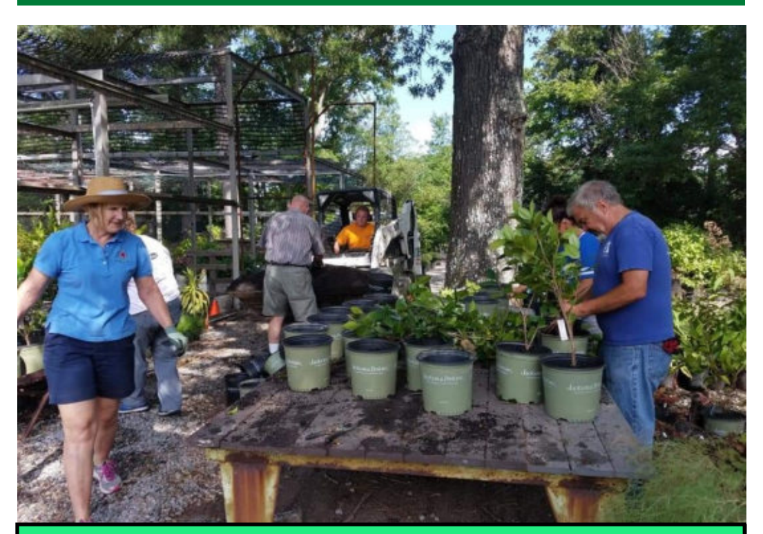
Members of the Virginia Camellia Society Busy Potting Air Layers During an August Hands-On Workshop

For those readers who are advanced growers and hybridizers, the lessons above are too simple and obvious to help you. However, if you are often asked to give advice, think about the kinds of very basic help some beginners might need in order to be successful once they've fallen in love with camellias.