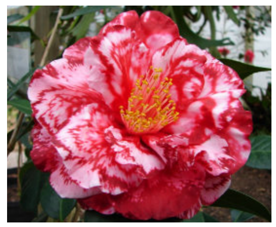
Terrell Weaver Var