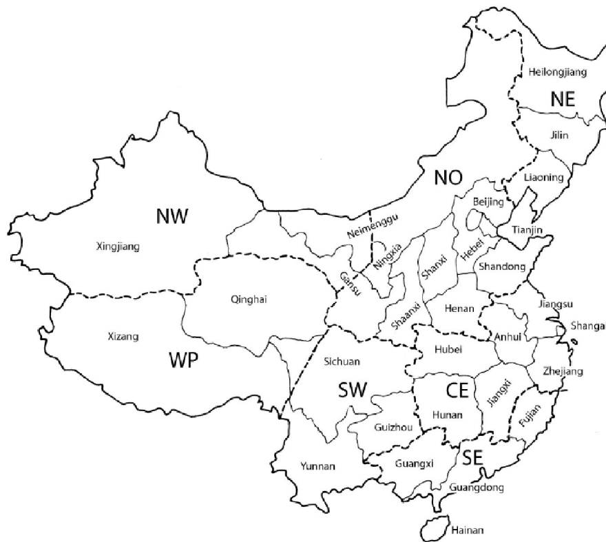
FIGURE 3. Map of China (excluding Taiwan) and its seven subunits as used in this catalogue. NW: Northwestern China. NO: Northern China. NE: Northeastern China. WP: Western Chinese Plateau. SW: Southwestern China. CE: Central China. SE: Southeastern China. Map adapted from Lelej (2002).