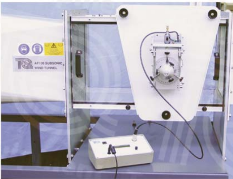
Mounted on side of wind tunnel to measure both lift and drag. Shown fitted with the protractor from the Wind Tunnel.