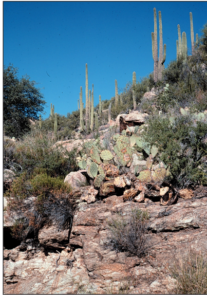
C. David Bertelsen

Habitat: steep rocky slopes and canyon bottoms in desertscrub, semidesert grassland; 2,477 to 4,856 ft (755-1450 m) elevation.