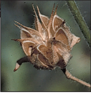
C. David Bertelsen

Habitat: steep rocky slopes and canyon bottoms in desertscrub, semidesert grassland; 2,477 to 4,856 ft (755-1450 m) elevation.