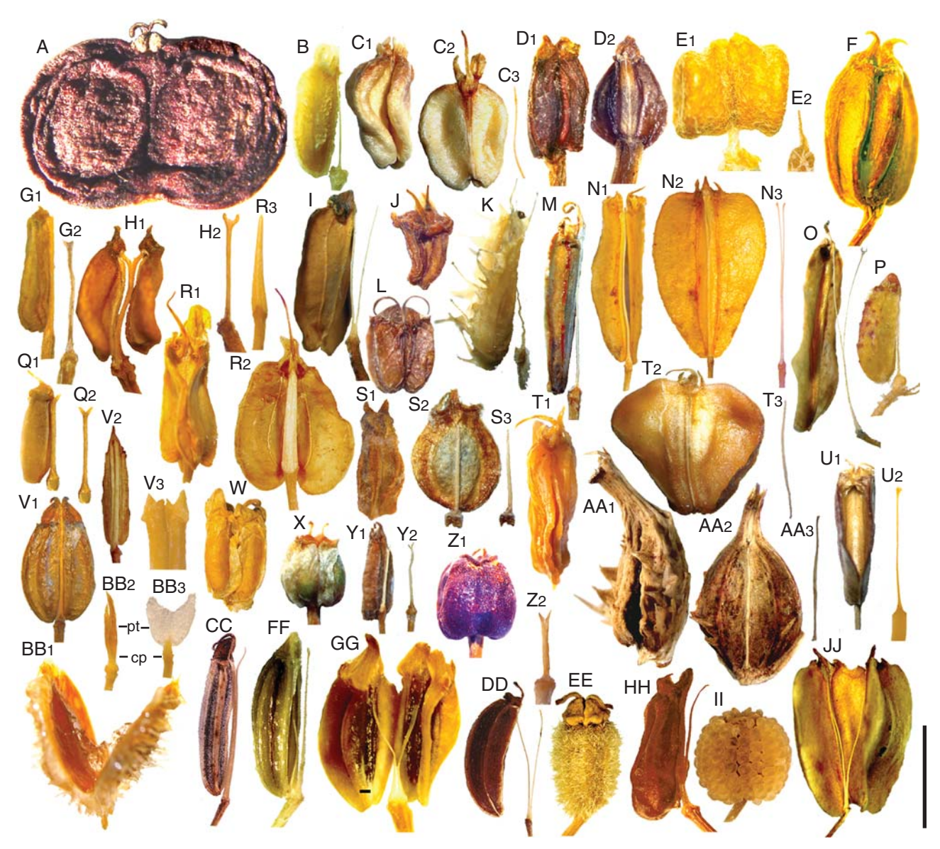
Fig. 1. Fruits of representatives of Apiaceae showing the shape and type of carpophore: in lateral view in A, B, C1 D1, E1, F1, G1, G2, H1, H2, I, M, N1, O, P, Q1, Q2, R, T1, U1, V, W1, X, Y, Z1, AA1, AA2, BB1, CC1–CC3 and DD–JJ, and in commissural view in C2, C3, R2, R3, S2, S3, W2, W3, BB2 and BB3. (A) Mackinlaya confusa. (B) Asteriscium aemocarpon. (C1–C3) Azorella compacta. (D) Bolax gummifera. (E1, E2) Bowlesia incana. (F) Dichosciadium ranuculaceum. (G1, G2) Dickinsia hydrocotyloides. (H1, H2) Diplaspis hydrocotyle. (I) Diposis saniculaefolia. (J) Domeykoa amplexicaulis. (K) Drusa oppositifolia. (L) Eremocharis triradiata. (M) Gymnophyton polycephalum. (N1–N3) G. isatidicarpum. (O) G. robustum. (P) Homalocarpus dichotomus. (Q1, Q2) Huanaca acaulis. (R1–R3) Hermas villosa. (S1–S3) Klotzschia glaviozii. (T1–T3) Laretia acaulis. (U1, U2) Mulinum spinosum. (V1–V3) Oschatzia cuneifolia. (W) Pozoa volcanica. (X) Schizeilema ranunculus. (Y1, Y2) Spananthe paniculuta. (Z1, Z2) Stilbocarpa lyallii. (AA1–AA3) Arctopus echinatus. (BB1–BB3) Choritaenia capensis. (CC) Annesorhiza altiscapa. (DD) Bupleurum mundii. (EE) Diplolophium buchananii. (FF) Foeniculum vulgare. (GG) Heteromorpha involucrata. (HH) Lichtenisteinia trifida. (II) Phlycidocarpa flava. (JJ) Polemanniopsis marlothii. Abbreviations: cp, carpophore; pt, parenchyma tissue. Scale bars = 0.4 mm in V3, 3 mm in others.

Group A. Carpophore absent; ventral vascular bundles as long as mericarps, arranged on opposite sides of the commissural plane (Fig. 3A)