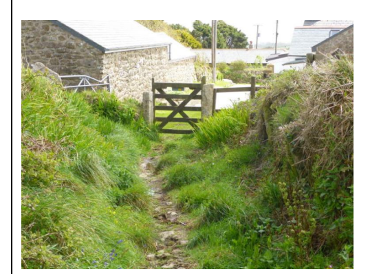
The narrow gate and fence and hedge is now an unauthorised obstruction and must be removed

Things may stay just as they are unless we continue to pursue Cornwall Council. The now unauthorised gate should be removed and restored back to an open lane entrance. We want improvements made to the path and we want good signage from the roads with bridleway way markers sited at key points. We are pushing hard to get the bridleway made usable. Local riders have waited long enough for this victory and now we want to make sure it is usable.