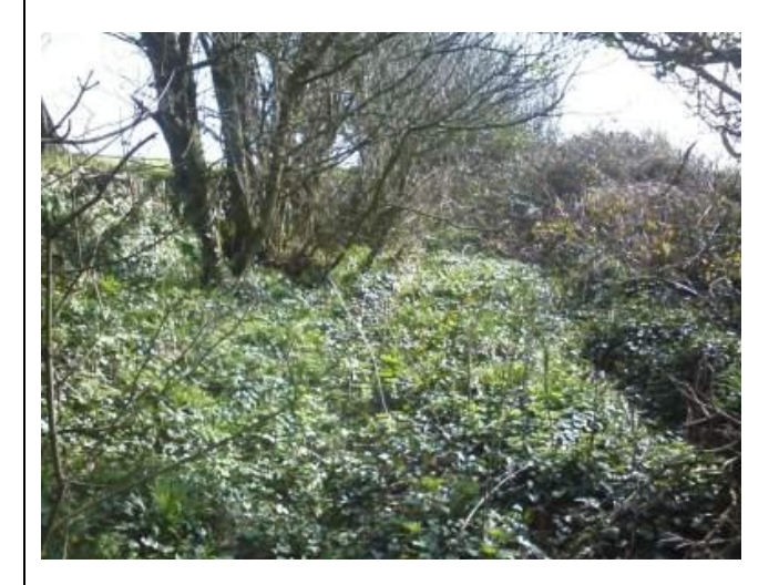
The path before clearance

The "road" to the south through Little Antron is unsealed and is of bridleway standard. It had become overgrown again in recent years and Cornwall Council Highways rather than the Right of Way Team are responsible for its clearance, but it is of very low priority to them hence not cleared.