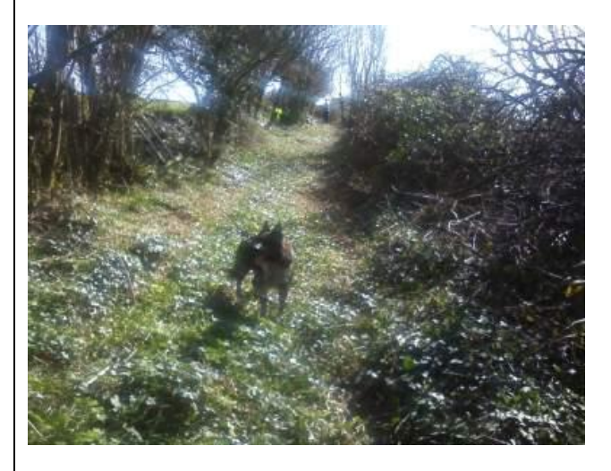
The path after clearance

However this year the Ramblers have organised clearance days on this route under their "REACT" initiative (Ramblers Environment Action Team), working with Cornwall Council.