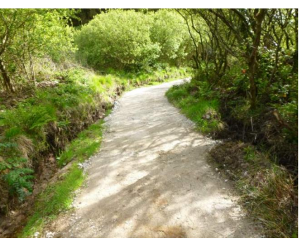
The "Fir Tree Route" - restored

The picture shows just one small section. Over 300 yards of the bridleway have been resurfaced – a fantastic job. Hopefully this work will resolve a bad drainage issue on the bridleway.