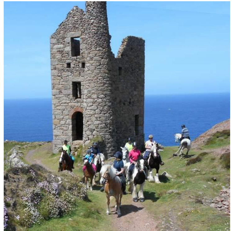
Riders on the Horse Hike from Chapel Carn Brea Pictured at the Botallck Mine. (The Wheal Leisure Mine in BBC Poldark)