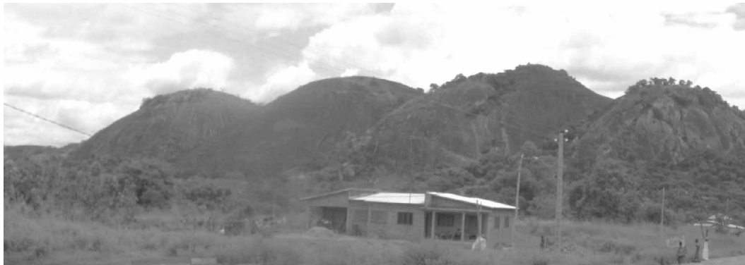
FIGURE 6. Type locality of Hemidactylus beninensis sp. nov. in the Collines de Dassa-Zoumè Département des Collines, central Bénin.

At present known only from the type locality in the relatively hilly region of the Département des Collines in central Bénin (Fig. 6). The area lies adjacent to the Nigerian border and it is likely that this species occurs in that country as well. A juvenile Hemidactylus angulatus was collected at the same site as the types of H. beninensis . The holotype exhibits damage to the skin of the dorsum of the head (Fig. 1). Such damage is indicative of mechanically weak skin, which is associated with regional integumentary loss, an escape mechanism employed against certain predators by a variety of geckos (Bauer et al. 1989, 1993).