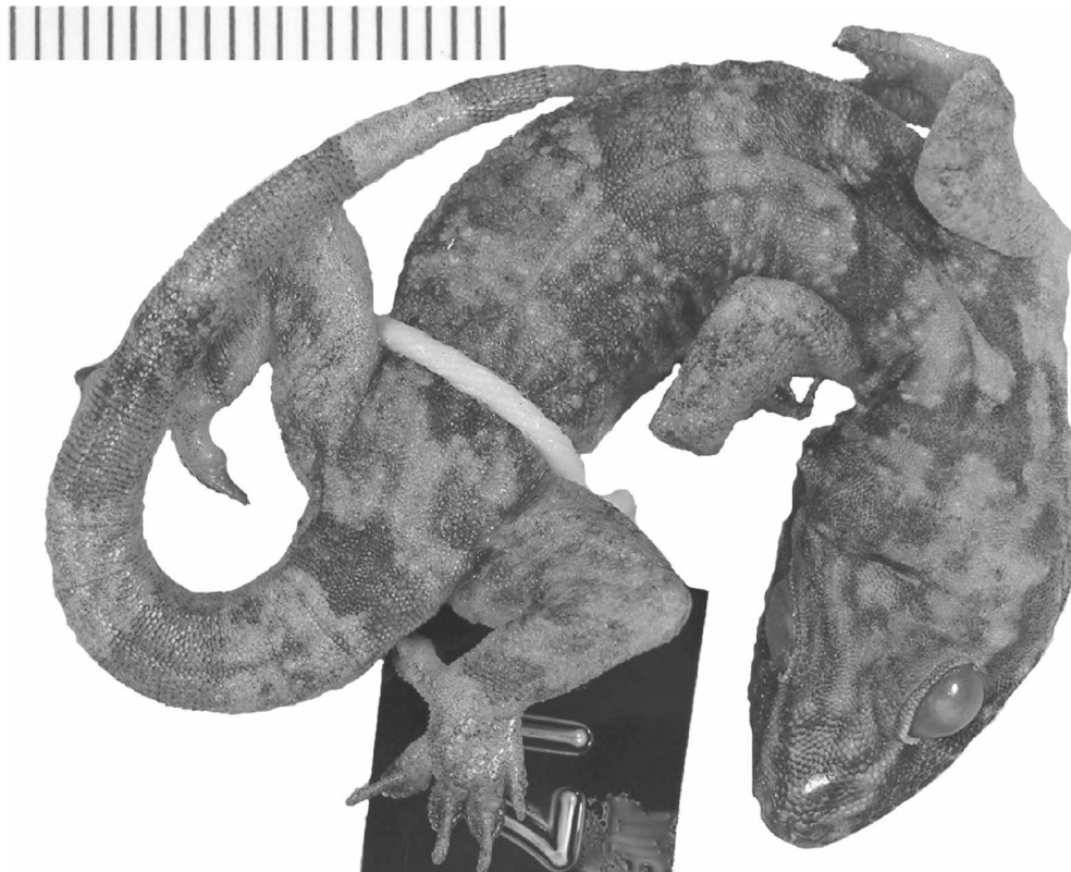
FIGURE 5. Dorsal view of the paratype of Hemidactylus beninensis sp. nov. (IRSNB 2618). Scale bar = 20 mm.

Fore- and hindlimbs moderately long, stout; forearm and tibia moderately long (ForeaL/SVL ratio 0.15; CrusL/SVL ratio 0.17); digits relatively short, strongly clawed; all digits of manus and pes webbed proximally only; distal portions of digits curved, arising from distal portion of expanded subdigital pad; scansors beneath each toe divided, except for distalmost and a few, basal scansors (usually 0–1); scansors from proximalmost at least twice diameter of palmar scales to distalmost divided scansor: 5-6-7-7-7 (left manus), 5-7-6-7-7 (right manus), 5-7-8-7-6 (left pes), 4-7-7-6-6 (right pes). Relative length of digits of manus: IV \approx III > V > II > I ; of pes: IV > III > V > II > I .