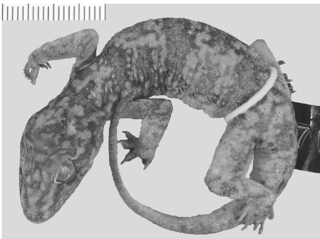
FIGURE 4. Dorsal view of the holotype of Hemidactylus beninensis sp. nov. (IRSNB 2617). Scale bar = 20 mm.

meeting at a point behind the mental, each postmental bordered anteriorly by first infralabial, medially by mental, and laterally and posteriorly by a series of four chin shields, the lateralmost much enlarged and also bordering first and second infralabials; remaining three chinshields smaller, approximately four times the size of a granular gular scale. Infralabials bordered by a row of enlarged and axially elongated scales, decreasing in size posteriorly. Enlarged supralabials to midpoint of orbit 8 (left)–9 (right); supralabials to angle of jaws 10 (right)–13 (left); infralabials 10 (left)–9 (right); interorbital scale rows across narrowest point of frontal 14, between supraciliaries 36.