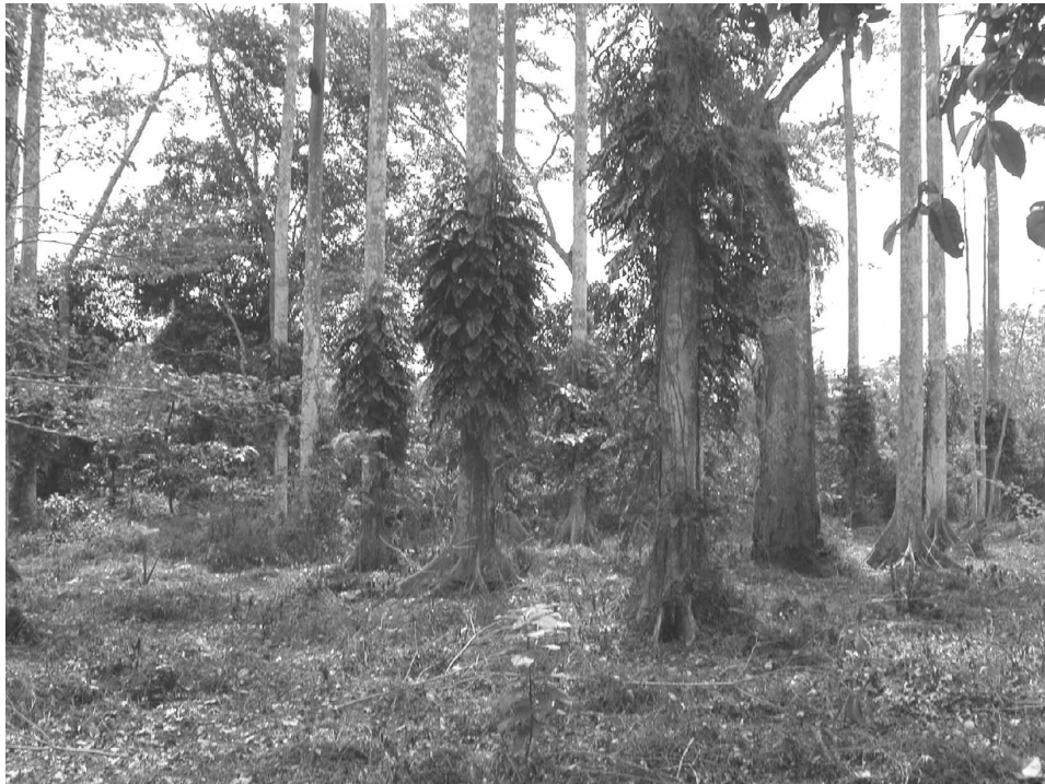
FIGURE 2. Forêt de Dzogbegan, Togo. Habitat of Lygodactylus conraui .

Chutes de Koudou, Parc National du W du Bénin, Département de l'Alibori (11°38'N, 02°18'E): IRSNB 17151-1, 17151-2, 17151-3; Parc National du W du Bénin, Département de l'Alibori: IRSNB 17154; without specific locality: IRSNB 17171-1, 17171-4.