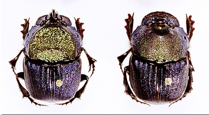
“Birdland” treasure: melanistic Phanaeus difformis .