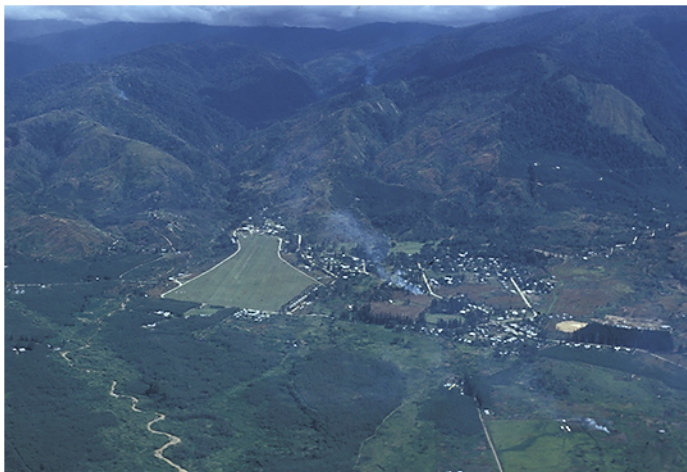
Photo 8: Town of Wau, PNG, showing combination landing strip and golf course; club house at lower end of strip.