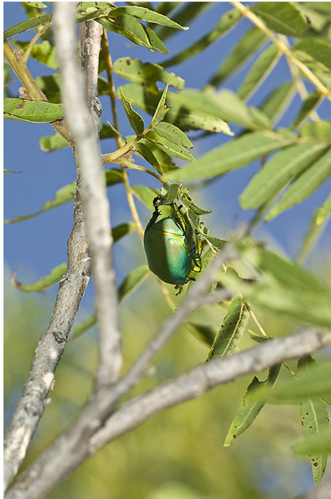
Chrysina woodi (Horn) is sometimes abundant on the walnut trees in the vicinity of Fort Davis, Texas.

be feeding on the tree. I think it's significant that this was at the end of the dry season and perhaps the beetles had congregated in a moister area to await the onset of rains. Even for a weevil guy, this was a very exciting day, but I can only imagine the range of raw emotions racing through the minds of you scarab collectors at this climactic moment.