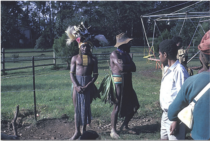
Photo 15: High society at the Mt. Hagen market showing prized head ornaments.