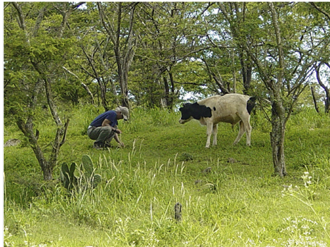
About to sumo wrestle a cow...