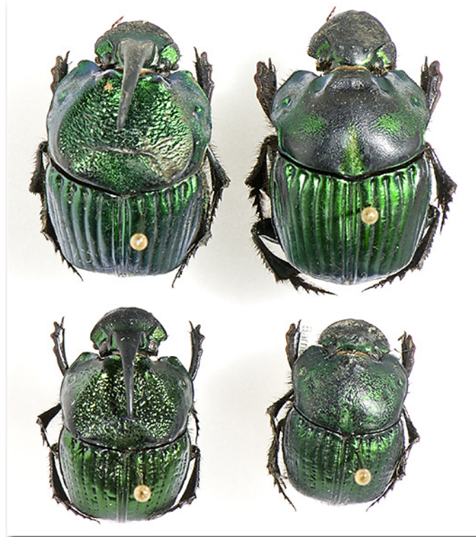
Top: Phanaeus lunaris from the above locality. Bottom: The green form of Phanaeus achilles , also from the same locality. However, it was more common at a lower elevation: Ecuador: Loja, Highway E35, 9.5 km S. Catamayo S 04° 03' 53.3" W 79° 23' 1.7" 1,211 Meters.

USA: Florida, Calhoun County, junction Hicks Creek & Highway 71, 4.6 road miles S. Highway 20, forest adjacent to the creek, 5-7/IV-2007, 1 male, 2 females.