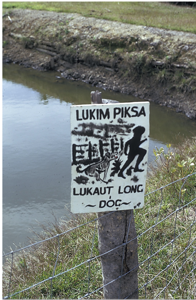
Photo 12: Sign translated reads: Look at the picture, watch out for large dog.

days in the vicinity of Mt. Hagen yielded aphodiines and a number of species of Onthophagus . On Sunday we went to the local native open market which was enclosed by a rail fence, with a large sign at the entrance saying that chewing betel nuts in the compound was forbidden. I wondered about that until reminded that the practice produced lots of red spit which was not pleasant to step on. In the market, men often wore the typical “grass belongum ass” while the women wore colorful robes which were often put on just outside of the compound. It was a colorful place and the “chief” men (Photo 15) often wore native symbols of their “high” class. Nearby native housing was something else. Low, long huts housing adults, children and the valuable pigs all stayed in the same huts and one wondered how the colorful market attire was kept clean. Later, when Papua New Guinea gained self rule, t-shirts and blue jeans were said to be the usual attire and crime became common in the more settled areas. Fortunately, we saw none of that. After a few days we moved to the Baiyer River Bird of Paradise Sanctuary near Mt. Hagen. It was a relatively small piece of mature forest on level ground, rare in places we had been. There were some tailored tracks and a narrow dirt road running through the forest. One of the tracks was guarded by a female cassowary (Photo 16); she had a nest with eggs beside the path and would not let anyone near. Cassowaries can be dangerous; while not as