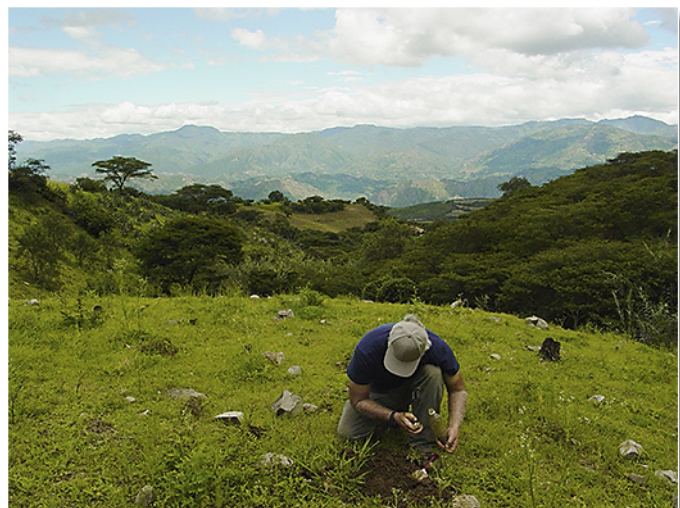
Busy and happy.