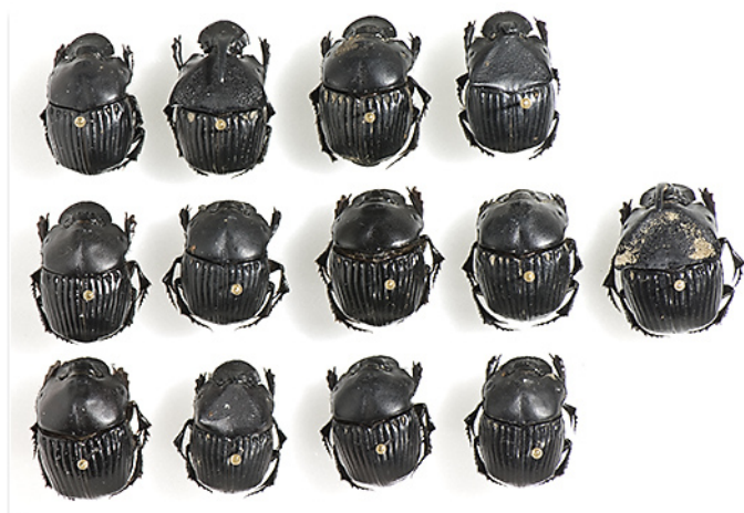
The specimens of Phanaeus triangularis triangularis from west of the Apalachicola River.