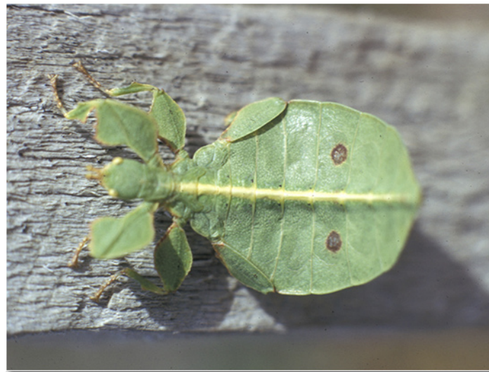
Photo 10: One of the odd, “darned if I know”, insects (phasmid) collected on Mt. Kaindi.

Natives that we met generally ignored us, but a fellow with filed teeth, red from chewing betel nut, was willing to have his picture taken (Photo 11). That was fine, but when I tried to get him to smile and to show off his teeth, I had no luck. Sign language was our only way of asking for anything, and the little pigeon that I learned seemed to be, for the most part, rather crude. For example, the grass skirts worn by either sex was referred to as “grass belongum ass”. Less crude examples