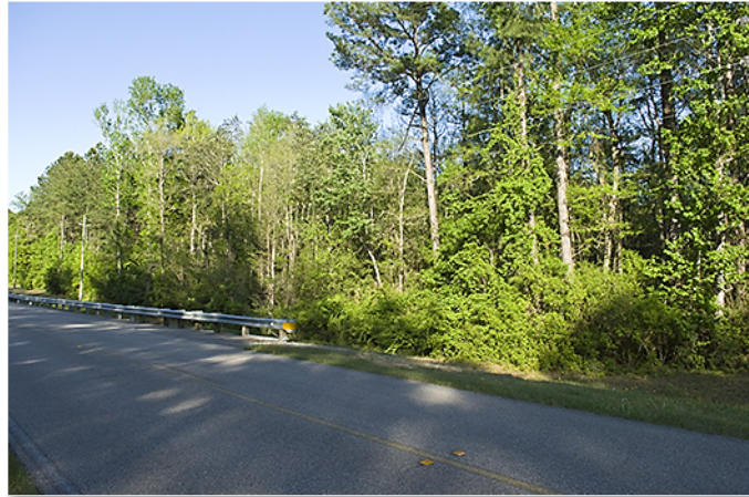
Hicks Creek where it crosses Highway 71, Calhoun County, Florida.

USA: Florida, Calhoun County, junction Hicks Creek & Highway 71, 4.6 road miles S. Highway 20, adjacent to cow pasture, 5-7/IV-2007, 1 male, 1 female.