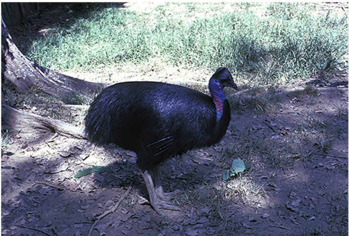
Photo 16: Cassowary that furnished us with one egg that fed four of us.

large as an emu, they are noted for their powerful kick and have been known to kill a person. There was no male in the Sanctuary (natives consider a cassowary a great meal), so the eggs were infertile. The ranger kindly gave us a freshly laid one and the four of us each had a good portion of scrambled cassowary egg for breakfast. Shortly after we arrived, a tailored path with a few steps made with logs held in place with metal pegs did me in. A metal peg caught the heel of my boot and badly twisted my ankle. So for the rest of the time at Baiyer River I collected by driving our Land Rover down the dirt tract. I would limp over to a trap or stand for a period at a very productive sap flow on a tree by the tract. The sap flow attracted lucanids, some scarabs and numerous nitidulids, not to mention many butterflies that got in the way! Collecting was great, but would have been better if I had been more mobile.