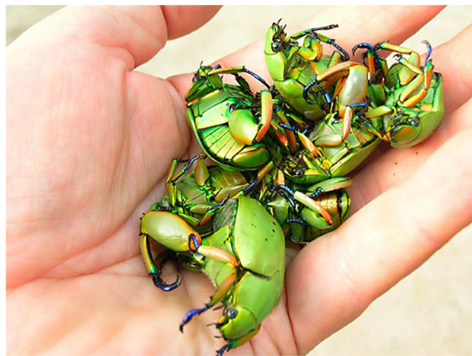
A handful of Chrysina triumphalis .

75 specimens in about 5 minutes of frenzied collecting! For every one I got, five flew away. Not to mention that the tarsal claws on these guys were like fine needles, easily piercing the skin and drawing blood when one pulled them off your arm or hand. But when one sees hundreds of Chrysina within arm’s length, pain is not a factor, right?