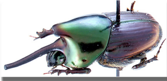
Onthophagus babaulti d'Orb.