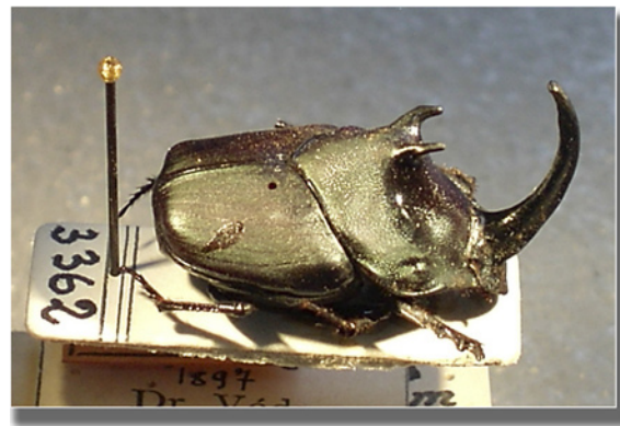
Proagoderus ceratotherium .

Editors Note: Sorry Skippy, the judging was done behind locked doors and we were not allowed in, so it was not possible to photograph them.