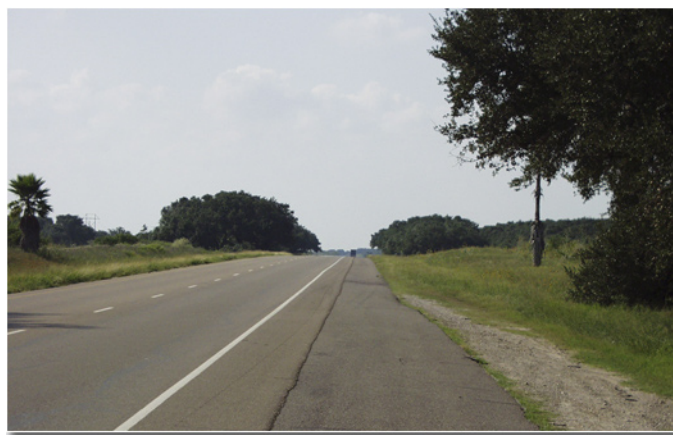
The bands of oak trees crossing Highway 77, otherwise known as "Birdland."

And so I did. There are actually several places where the oaks cross the Highway, and these yielded a few precious purple P. difformis which were among numerous red