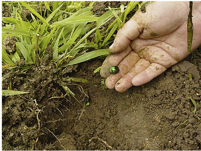
A hand smeared with cow dung. It does not get any better than this!