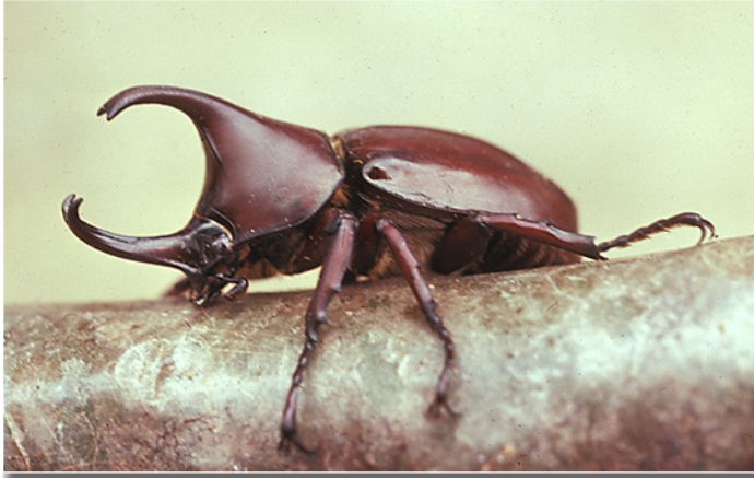
Photo 14: One of many scarabs and lucanids that came to sap flows, a Xylotrupes .