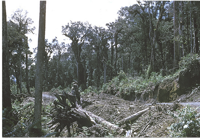
Photo 9: Forest near summit of Mt. Kaindi adjacent to Wau; starting to get cut then; now?