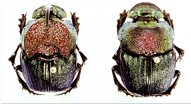
The typical reddish-green color form of Phanaeus difformis .

and green forms. A few more traps were placed due east of Sarita, in open, oak-less habitat. This road extends a few miles before you come to a gate with a guard who will not let you enter Kenedy Ranch. The traps on this road yielded P. difformis with the typical coloration.