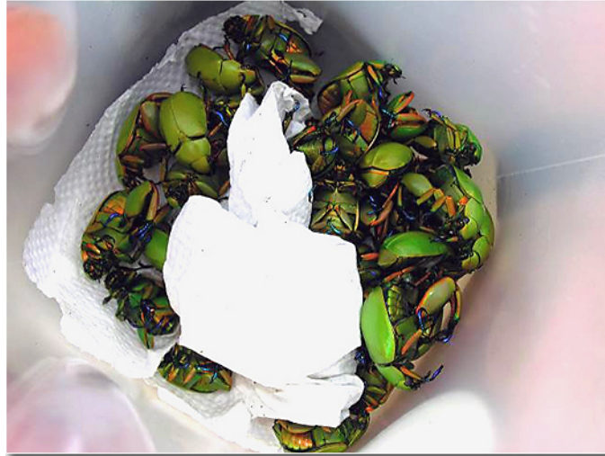
A bucket of beetles.

At this point I must suggest that the true scarab enthusiast find a comfortable seat, sit down, close your eyes, relax and try to imagine this scenario. Picture the tree shaking and the large, bright green beetles falling. First one or two, then 10, 20... then a hundred, then hundreds. It was literally raining Chrysina !! As they fell, some took wing, some hit the ground and stayed there, some ended up on my clothes and on me, some fell onto lower vegetation. Then a few seconds later, as if on some magical cue they all started to fly. At first I grabbed a few from my clothes but soon my hands were full and being a weevil guy, my biggest vial would only hold half a hind leg of one of these beasts, so employing my quick PhD-given thinking skills, I decided to use one of the pillow cases that I use for bagging the leaf litter samples downhill. Stuffing the ones on my hands into the bag, I collected about 20 or so more on my body and then started picking them off the lower vegetation and ground. In all I must have grabbed about