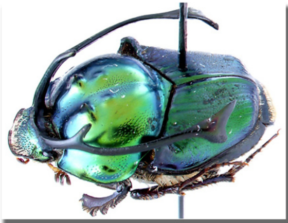
Onthophagus (Proagoderus) rangifer Klug.