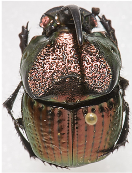
A male of Phanaeus achilles . This is the typical red form from coastal Ecuador.

I suspect the red form of Phanaeus achilles at Montecristi in western Ecuador does the same thing. The first specimen I ever saw came to blacklight at dusk! Once I baited dung traps at night and returned the next morning in rainy weather. Nothing was flying, yet, the traps were full. This may indicate crepuscular flights for this species.