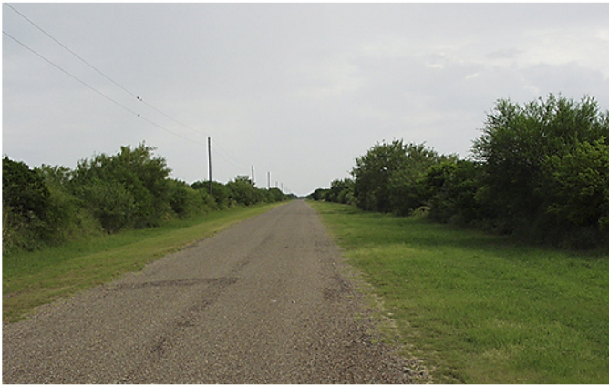
The road from Highway 77 to the entrance to Kenedy Ranch.