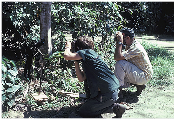
Photo 13: The easy way to take pictures of Birds of Paradise! Be sure that they are well mounted.