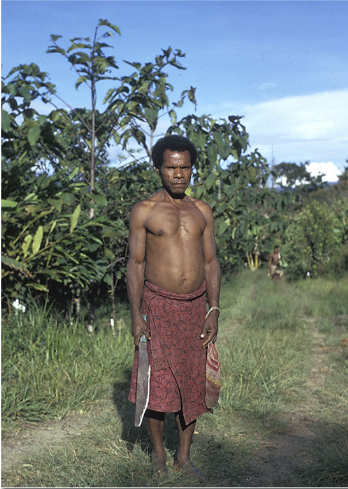
Photo 11: Local who was glad to have his picture taken, but would not smile to show off his filed teeth and very red, betel nut stained gums.

referred to such things as nasty dogs (Photo 12) or stores, etc. At night when running our lights, we would often hear the locals on the mountain side playing a type of flute made from bamboo; the sounds drifting down to us made for an interesting evening. Back in 1974, there was little robbery or problems between whites and natives; whites were mere objects to be mostly ignored. One day the car got stuck and a group of natives helped us out. They then demanded a shilling each, which we didn't have. Things got a little nasty until I remembered that we had a pack of