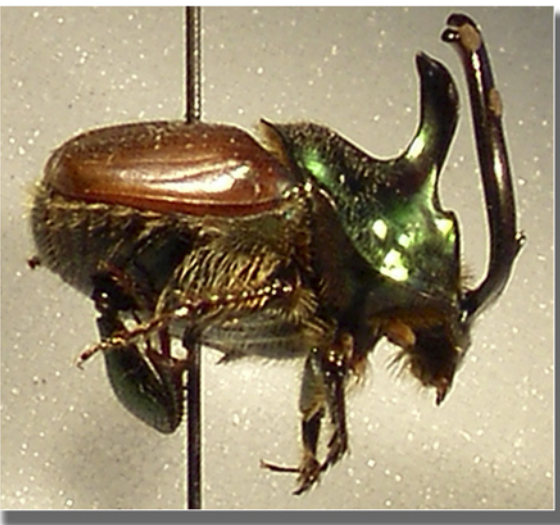
Proagoderus elgoni .