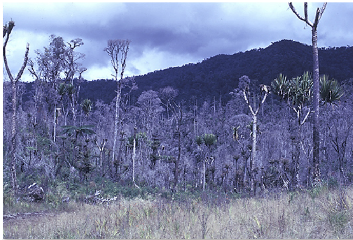
Photo 17: Frost damage on Mt. Hagen, not much of a picture, but rarely seen; pandanus is one obvious survivor.

because he was afraid a cast might allow an infection. We then went collecting at Brown River, a reserve near town. Collecting was quite good, with a number of different scarabs. When we left New Guinea we had collected over 50 species of Onthophagus and many other genera of scarabs and lucanids. It was a great trip, except that on the return I had an aisle seat in order to extend my bad foot; nearly everyone using the aisle managed to kick my foot anyhow! My foot was OK after several weeks back in Ottawa, and sorting and mounting kept me busy in my spare time for the rest of the year.