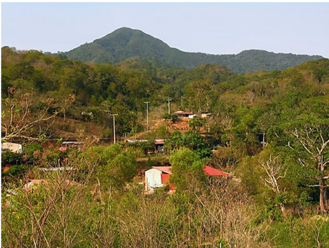
The town of Sierra Morena with Cerro Bola in the background.