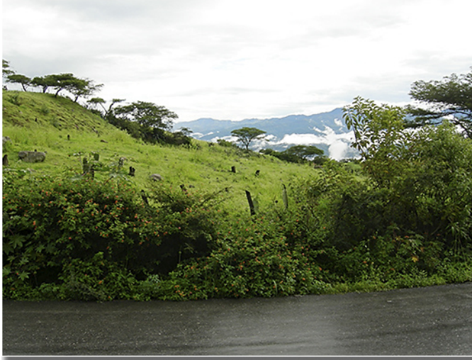
The locality mentioned here: Ecuador, Loja, Highway E35, 24 km S. Catamayo [= 3.0 km N. Nambacola] [= 18.5 km N. Gonzanamá] S 04° 08' 8.5" W 79° 23' 36.4" 1,811 meters.