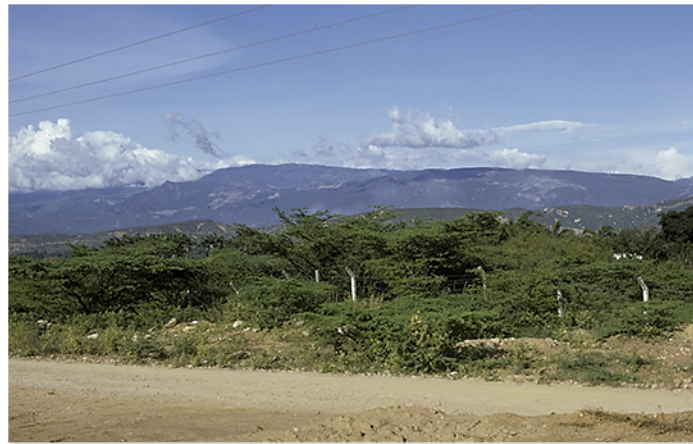
Photo 3: Part of low valley between the mountains of Colombia and Venezuela.

the north coast of Venezuela. Were the beetles the same or different on each side of the pass? We started first on the Colombian side, going daily to the high country just south of Cucuta (Photo 4). Car rental was very costly and we found it far less expensive to rent a taxi and driver for 12 or so hours a day; it was also good that the driver knew the roads, none of which were sign posted. We spent nine days collecting near Cucuta, going up to 9,000 feet in one area of wet, scrub forest with roots so dense that no soil was visible. Stewart had to chop the roots to put in carrion traps. I was skeptical that