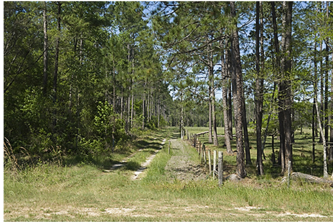
From the same camera position as the above photo, there is a dirt road bordering a pasture, with Hicks Creek to the left. One trap placed on the side of this road attracted Phanaeus triangularis triangularis , P. igneus and P. vindex .