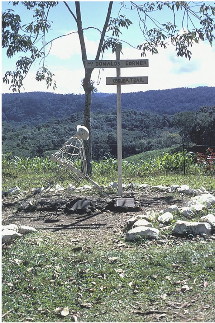
Photo 7: Parts of leftover soldier marking where Japanese were stopped above Port Moresby, PNG, during World War II.