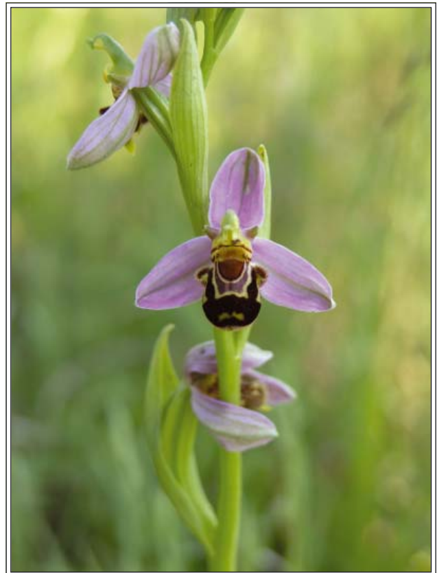
Fig. 3. Ophrys apifera .

So far the species has not been reported for the country in the Bulgarian botanical literature proba-