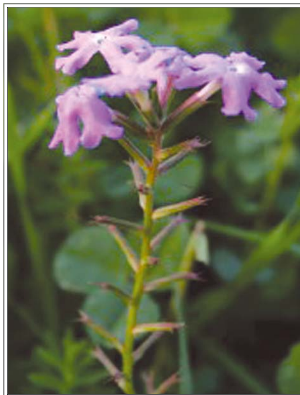
Fig. 2. Verbena aristigera.

Verbena aristigera is an introduced adventive and apparently ours is the first record both for Greece and Europe. The plant is easily identifiable due to its sprawling weedy habit, narrow pinnatifid leaves and persistent, slender, awned-tipped calyx. It is native to South America and we have compared our material with plants from Argentina and from the Transkei in S Africa. It has also spread to W Australia. Growing as it does on floodplains, grass-