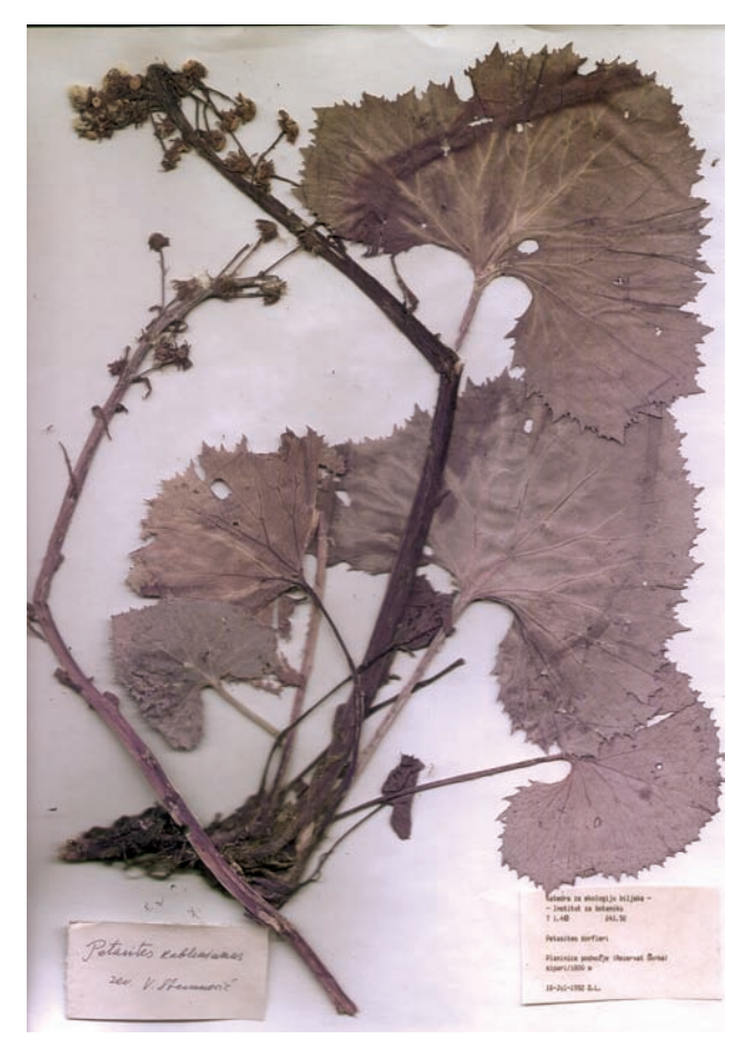
Fig. 6b. P. kablikianus from Mt Durmitor, N Montenegro, misidentified as P. doerfleri (image from BEOU).

Our new Petasites differs from P. paradoxus by its leaf margins which are deeply and acutely dentate-lobed and by its florets which have narrowly triangular, acute corolla lobes (irregularly truncate in P. paradoxus ). It is geographically disjunct and isolated (Fig. 7). It differs from P. doerfleri by its leaf margins with smaller and more numerous dentate lobes,