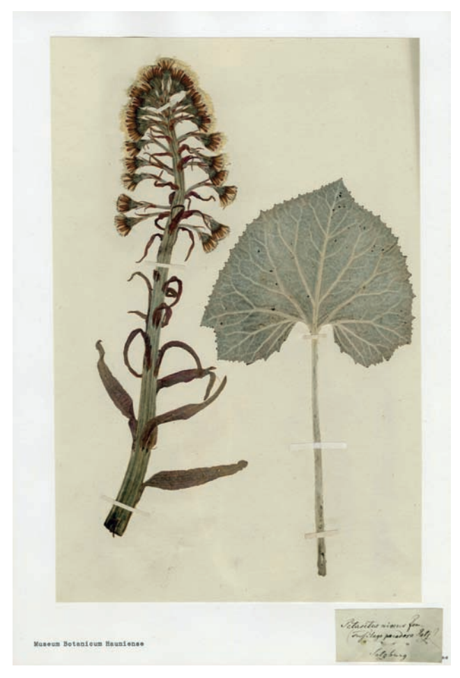
Fig. 2. P. paradoxus, basal leaf and flowering scape (image from C).

Three other species of Petasites are known from Greece: P. albus (L.) Gaertn., P. hybridus (L.) P. Gaertn. & al. and P. kablikianus Bercht., all belonging to Petasites subgen. Petasites. The habitat of our new species is rather unusual for Petasites in Greece. Whereas the other three species are found in river gorges, damp screes, wet places by streams or in semi-shaded forest, P. anapetrovianus was discovered on dry stony and rocky limestone scree slopes far from streams or forest on the way to the summit of Tsoukarella, one of the peaks of Mt Peristeri. Two small patches of the plants were noted, growing near each other. This alerted us to the idea it might represent a new taxon. It was at first thought the plants represented P. paradoxus (Retz.) Baumg. (syn.: P. niveus (Vill.) Baumg.) and thus it would be the first record of this species for Greece and the southernmost occurrence of the species in the Balkan Peninsula. P. paradoxus (Figs. 2 & 3) occurs in the Pyrenees, Alps, in several scattered localities in