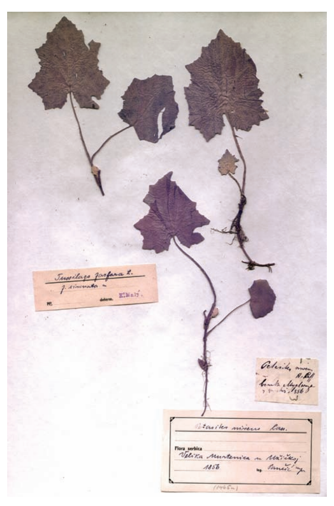
Fig. 4. Tussilago farfara from Mt Murtenica, W Serbia, misidentified as P. paradoxus.

Petasites doerfleri Hayek has leaves persistently white-tomentose on both surfaces and purplishtinged, non-glandular phyllaries. It differs from P. paradoxus , P. kablikianus and our new species by the presence of ligulate female florets and its leaf margins with sharply acute, few and large dentate lobes (Fig. 5, Hayek 1917: tab. 3, fig. 3). It is restricted to N Albania (Mt Prokletije at 1900–2200 m) and has in the past been treated as a separate genus Nardosmia Cass. or subgenus, Nardosmia (Cass.) Petermann (To-