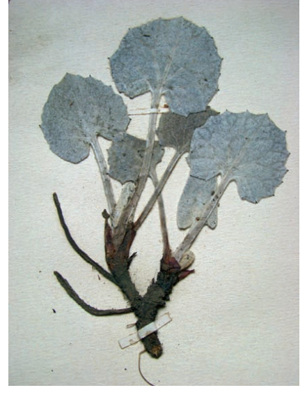
Fig. 5. P. doerfleri from N Albania.

man 1972). Records of P. doerfleri from Hercegovina (Fig. 7) probably refer to P. kablikianus , as proven by the record from N Montenegro (Mt Durmitor).