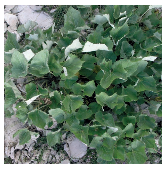
Fig. 1. P. anapetrovianus on Mt Peristeri (photo V. Vladimirov).

Perennial herb, up to 35 cm tall at time of flowering, becoming taller in fruit. Rootstock 1–1.5 cm diam., thickest just below the stem. Basal leaves long-petiolate; lamina triangular-cordate to hastate, 7–12 cm long, 7–3 cm broad, acute or subacuminate at apex, deeply (1–2 cm) reniform-excised and shallowly sinuate-lobed in the lower half, with 1–3 lateral veins bor-