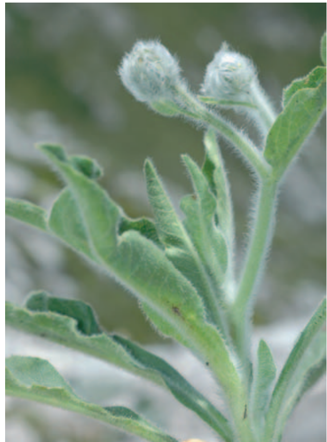
Fig. 1. Hieracium scapigerum subsp. falacronense , living plant at the type locality.

Holotype: Greece, Eastern Macedonia, Nomos Drama, M. Falakron, ridge of the summit near upper lift station („Gipfelgrat nahe oberer Liftstation“), 2109 m s.m. (41.29726°N 24.08217°E), 7.7.2013, L. Meierott-2013/617, M-0223073; Isotype: Hb.Meierott.