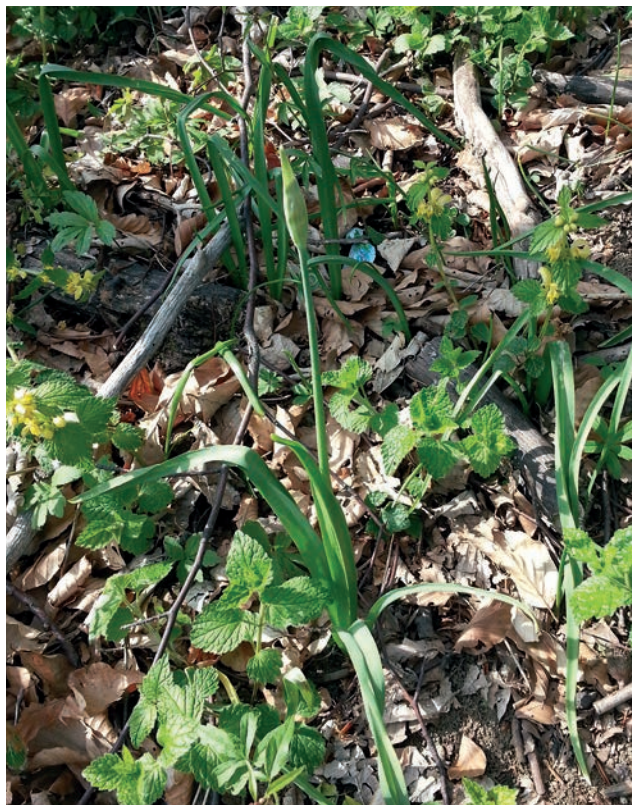
Fig. 15. Nectaroscordum siculum subsp. bulgaricum (in the herb layer of Asperulo-Fagetum beech forest).

Together with Allium ursinum , it forms dense herb synusia in an Aremonio agrimonoides-Fagetum sylvaticae allietosum ursini beech forest. The accompanying species are: Arum maculatum , Cardamine bulbifera , Corydalis bulbosa , Euphorbia amygdaloides , Lamiasrum galeobdolon , and Hepatica nobilis .