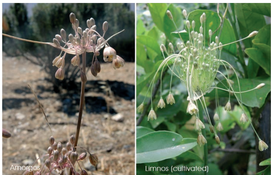
Fig. 3. Allium paniculatum.

Gr Amorgos: N of Egiali, waste ground at beach near houses, 3 m, 36°54'19"N, 25°58'38"E, 03.06.2016, Biel 16.132; S of Katapola, Sarcopoterium -phrygana with Opuntia along path, 36°49'29"N, 25°51'50"E, 06.06.2016, Biel 16.154; Chora,