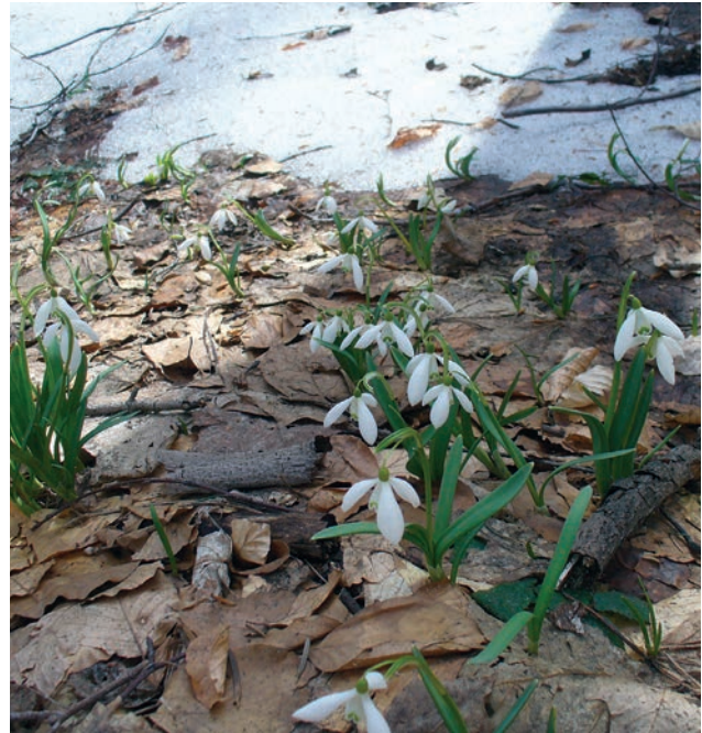
Fig. 14. Galanthus nivalis.

This is a new species for this floristic region. It has