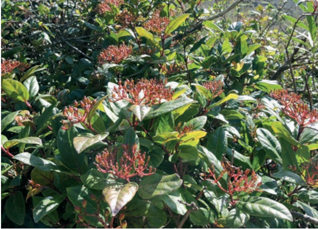
Fig. 2. Viburnum tinus subsp. tinus.

The species has also been recorded from Naxos. Remnant of former planting. Also noted near Aghia Thekla village and Egiali-Kambos.