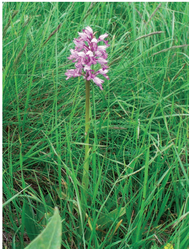
Fig. 16. Orchis militaris.

The species is presented by a small population on an area of 1 m 2 . A small number of flowers has been observed during different years. The species grows in Festuca rubra communities affiliated to habitat E2.33