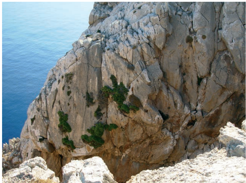
Fig. 4. Staehelina fruticosa on the rocks.