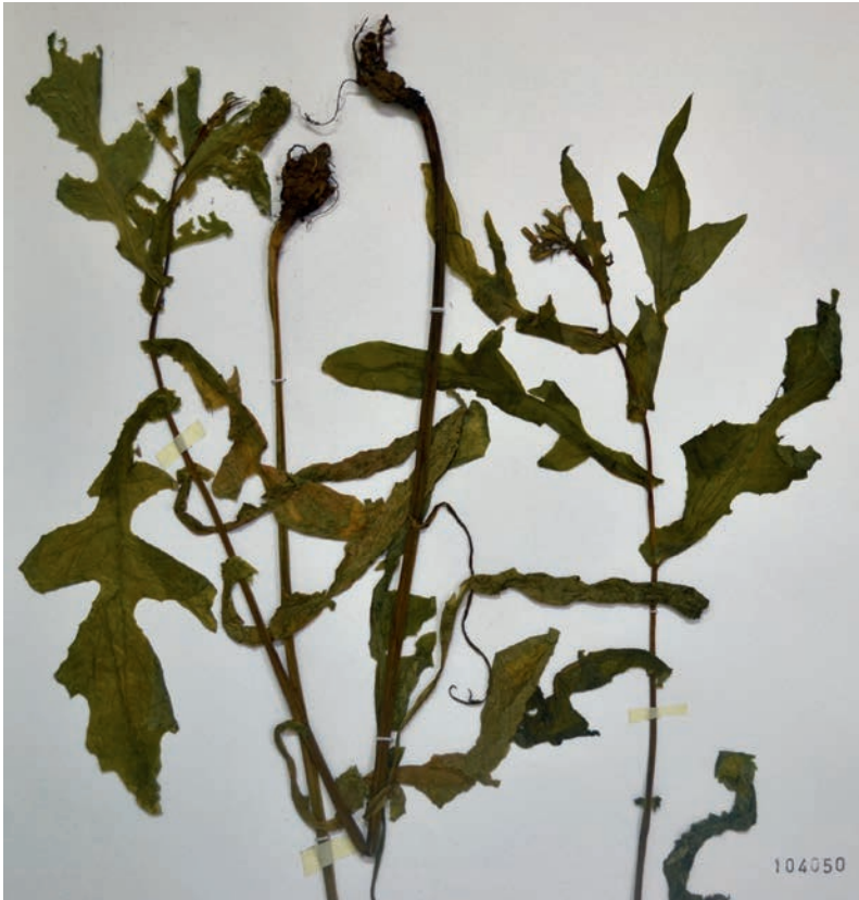
Fig. 9. Lactuca tuberosa (herbarium specimen).