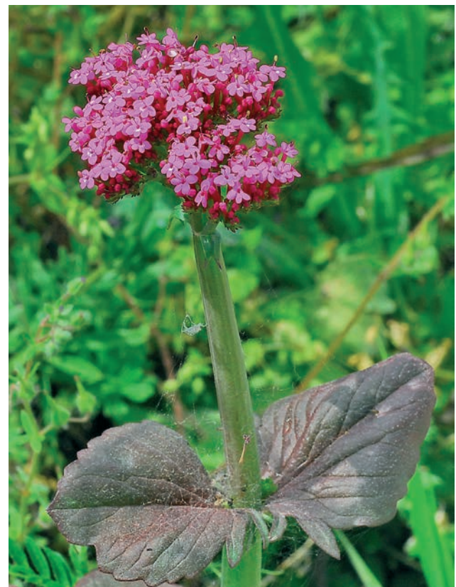
Fig. 6. Centranthus macrosiphon.

New for nomos, eparchia and W Peloponnese.