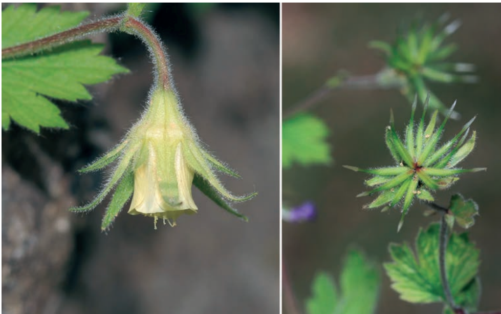
Fig. 28. Geum heterocarpum.

Confirmation for Mt Killini. A number of distribution maps indicate possible localities near Killini, e.g., in Bayer & al. (1978).