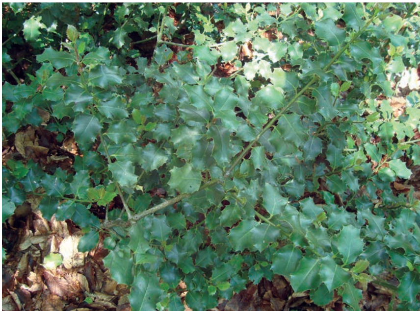
Fig. 8. Ilex aquifolium.

Bu Balkan Range ( Central ): in the lands of Enina village (Kazanlak Municipality), southwards of peak Chilicheto, on mixed limestone-and-silicate terrains in Festucion valesiacae grasslands, 680 m, 42°40'42.91"N, 25°25'15.25"E, 14.07.2010, coll. K. Pachedjieva & D. Dimitrov (SO 104047).