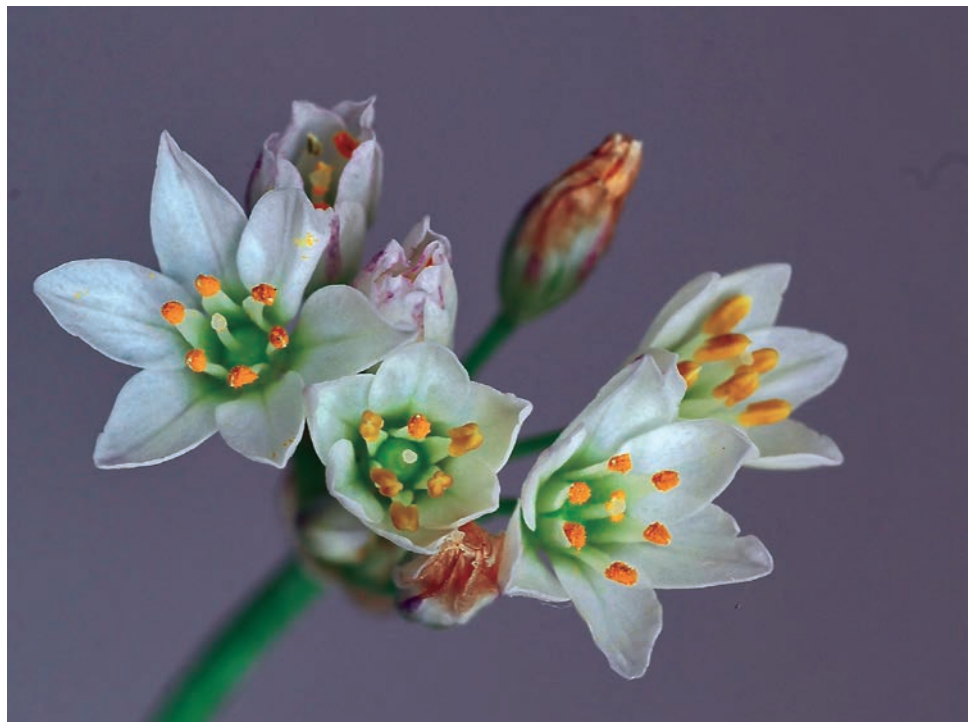
Fig. 7. Nothoscordum gracile.

The species is a medicinal plant included in the Annex to the Medicinal Plants Act. It is distributed in all floristic regions of Bulgaria and has not been reported so far only for the Central Balkan Range (Assyov & Petrova 2012).