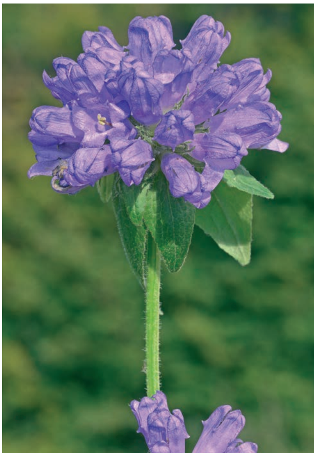
Fig. 20. Campanula foliosa.

Gr Nomos & Eparchia Florinis: Mt Boutsis, SW of Vatochori, along 9 km of forest road, openings in Fagus forest, limestone, 1450–1550 m, 40°39'N, 21°08'E, 15.06.2016, Kit Tan & al. 32148.