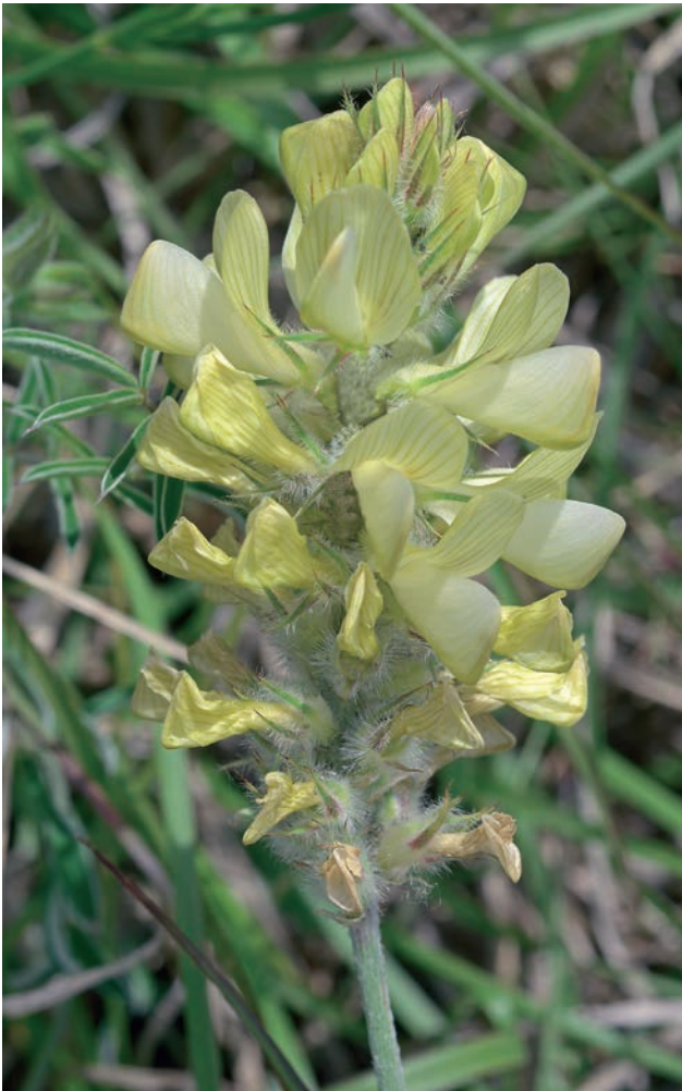
Fig. 23. Onobrychis citrina.

Onobrychis citrina is distinguished by its white-villous legumes, lemon yellow corolla, short racemes and narrowly linear-elliptic leaves. Unlike some white or cream-flowered plants of Onobrychis alba (Waldst. & Kit.) Desv. ( ochroleuca -type), the standard is always a clear yellow. Plants had previously been identified as Onobrychis degenii Dörfner. The latter was described from the vicinity of Allchar (Alšar), SE of Prilep in FYR of Macedonia, and is quite different in leaf shape, dense silvery-grey villous indumentum, and much larger fruits 8–10 mm long (see Fig. 25). The material of O. degenii with which our plant was compared, was