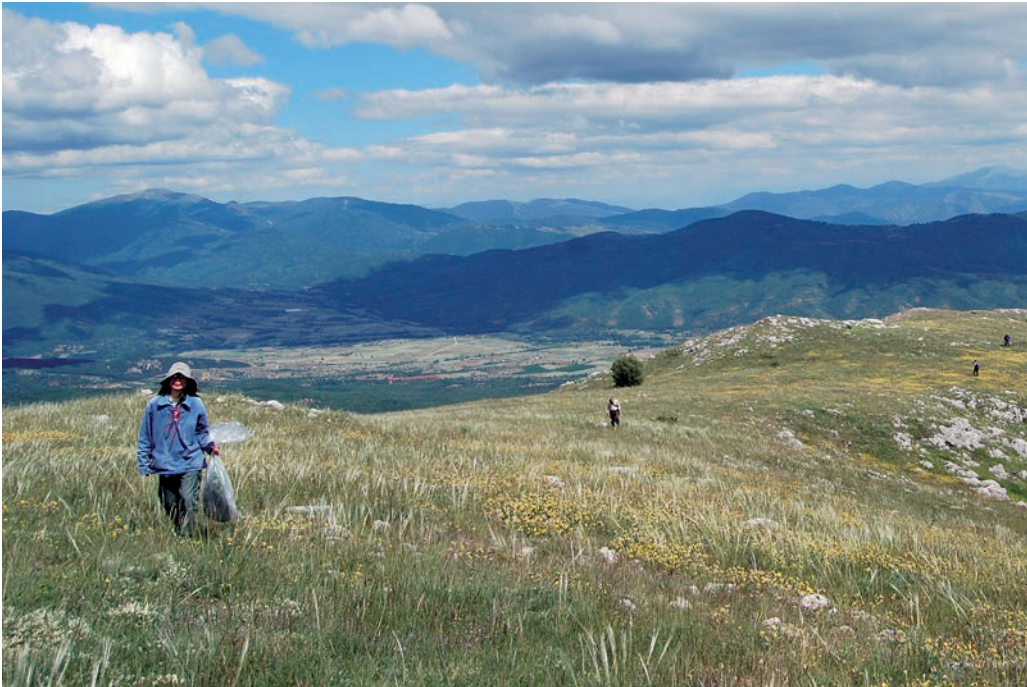
Fig. 18. Kit Tan, Arne Strid, Per Hartvig and Gert Vold near the summit of Mt Boutsis.