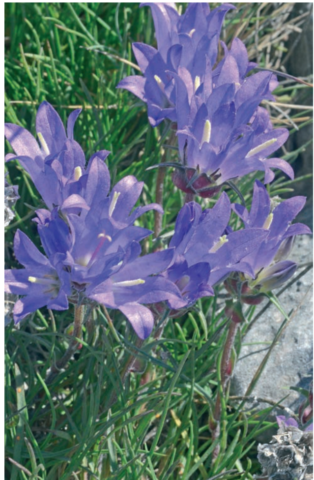
Fig. 21. Edraianthus horvatii.

Gr Nomos & Eparchia Florinis: Mt Boutsis, SW of Vatochori, E slopes of summit area, grassy places and rocky limestone outcrops, 40°39'N, 21°09'E, 1600–1750 m, 15.06.2016, Kit Tan & al. 32164; loc. ibid. , 08.07.1981, Strid & al. 18754 sub nom. E. graminifolius (L.) A. DC.