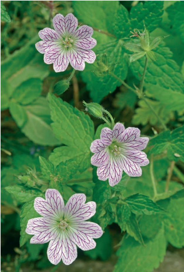
Fig. 22. Geranium versicolor.