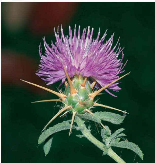
Fig. 26. Centaurea iberica subsp. iberica.

Gr Nomos & Eparchia Korinthias: Mt Killini,