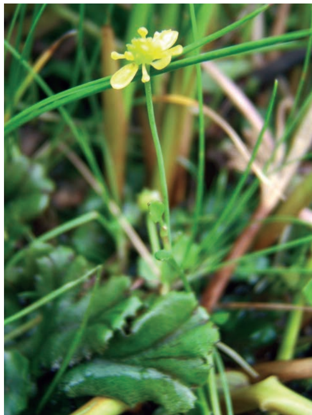
Fig. 12. Ranunculus ophioglossifolius.

This annual hygrophyte species has been known so far from the mountain regions in South Bulgaria: Black Sea Coast, Balkan Range ( Western ), Rila Mts, Pirin Mts and Rhodopi Mts, and also Tundza Hilly Country (Assyov & Petrova 2012). It participates in Calthion