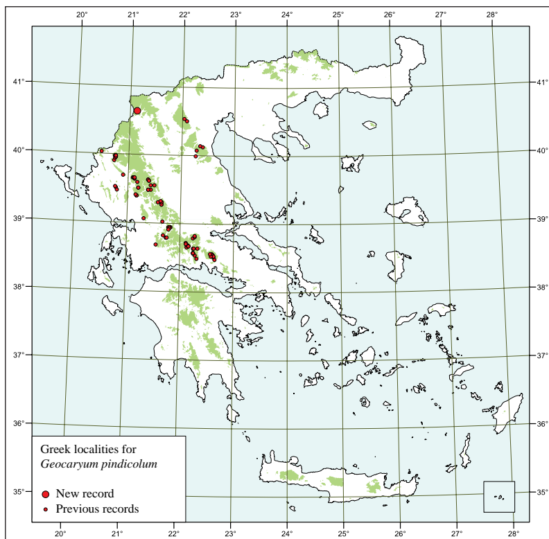
Fig. 19. Geocaryum pindicolum , distribution in Greece.