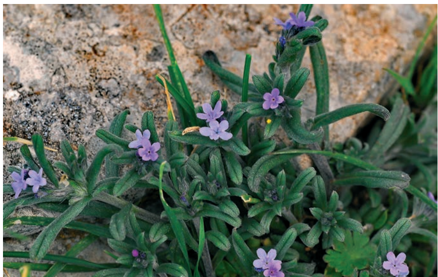
Fig. 5. Buglossoides incrassata.