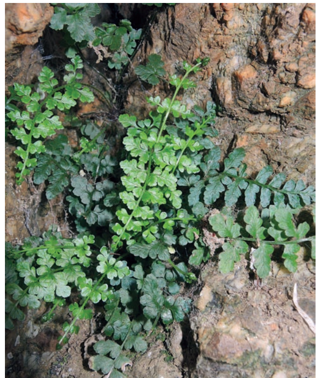
Fig. 1. Asplenium obovatum subsp. obovatum.