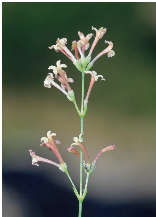
Fig. 30. Asperula aristata.