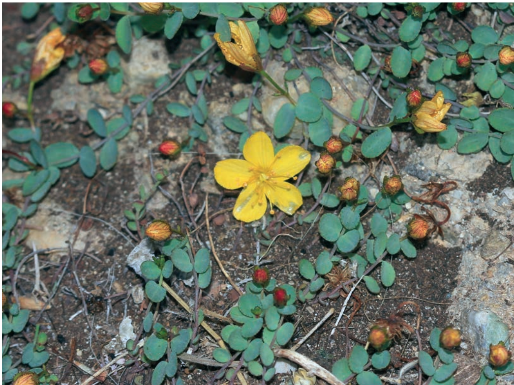
Fig. 27. Hypericum boehlingraabei.

Gr Nomos & Eparchia Korinthias: Mt Killini, Sfedani,