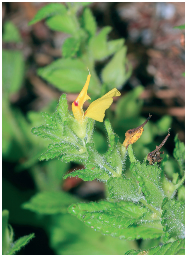
Fig. 29. Rhynchosorys elephas.