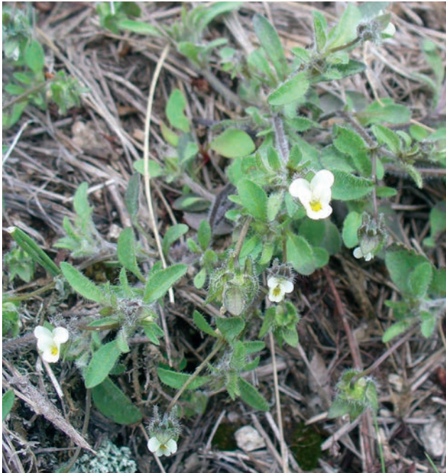
Fig. 13. Viola parvula.

It is a threatened plant, in the Critically Endangered category (Tashev 2015) and listed in Anex III to the Bulgarian Biodiversity Law.