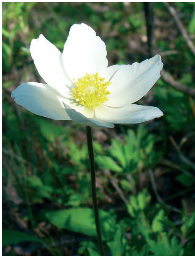
Fig. 11. Anemone sylvestris.

The species is listed in the Red List of Bulgarian Vascular Plants , under Near Threatened category (Bancheva 2009) and is covered by Annex III to the Bulgarian Biodiversity Law. The population grows on an area of about 300 m 2 and numbers above 1000 individuals. It participates in Fraxinus ornus communities affiliated to habitat G1.7C63 Manna tree woods. Accompanying species are also: Cornus mas , Crataegus monogyna , Brachypodium sylvaticum , Clynopodium vulgare , Festuca heterophylla , Fragaria vesca , Hedera helix , Primula veris , and Teucrium chamaedrys .