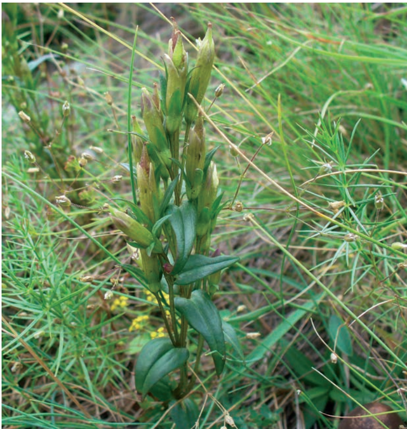
Fig. 10. Gentianella amarella (Demirkapija, photo Y. Marinov).

SOM 58071 (as Gentiana lutescens ), Korudzha and Chifuta (Ispolin massif), 07.1903, Neičev SOM 57926 (as Gentiana lingulata ).