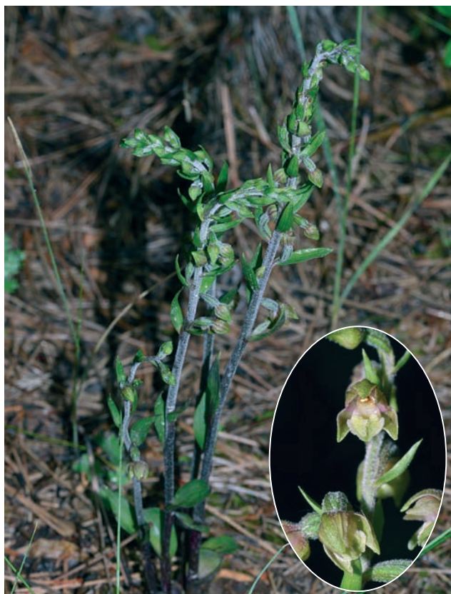
Fig. 17. Epipactis microphylla.

4 Botanical Garden, State Natural History Museum, Øster Farimagsgade 2C, DK-1353 Copenhagen K, Denmark