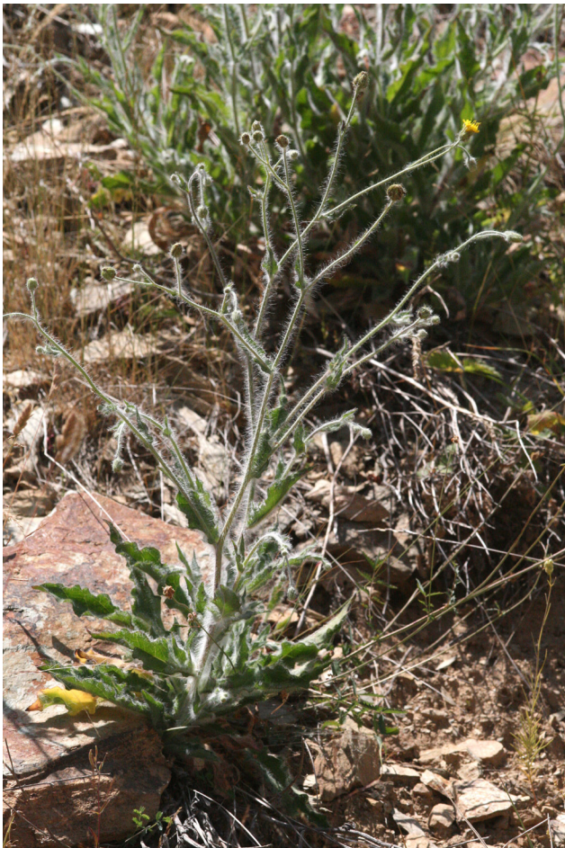
Fig. 2: Hieracium jankae subsp. wagneri (Du-34536, Go-68114).