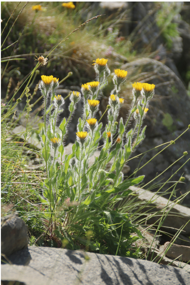
Fig. 5: Hieracium villosum (Du-34503, Go-68091).

P. pavichii and P. leucopsilon (= Hieracium hoppeanum subsp. testimoniale ) are common species in North Greece. P. leucopsilon seems to be always sexual; P. pavichii either sexual or apomictic (Krahulcova & al.