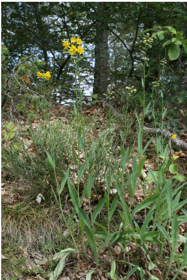
Fig. 3: Hieracium sparsum subsp. weneri (Go-68197).

NE – Nom. Serres, road to Leilias, 1500 m (41°14'55"N 23°34'41"E), slope along the road, Fagus forest, leg. F.G. Dunkel & G. Gottschlich, 17.07.2017, Go-68329, Du-34762, Hier. Eur. Sel.