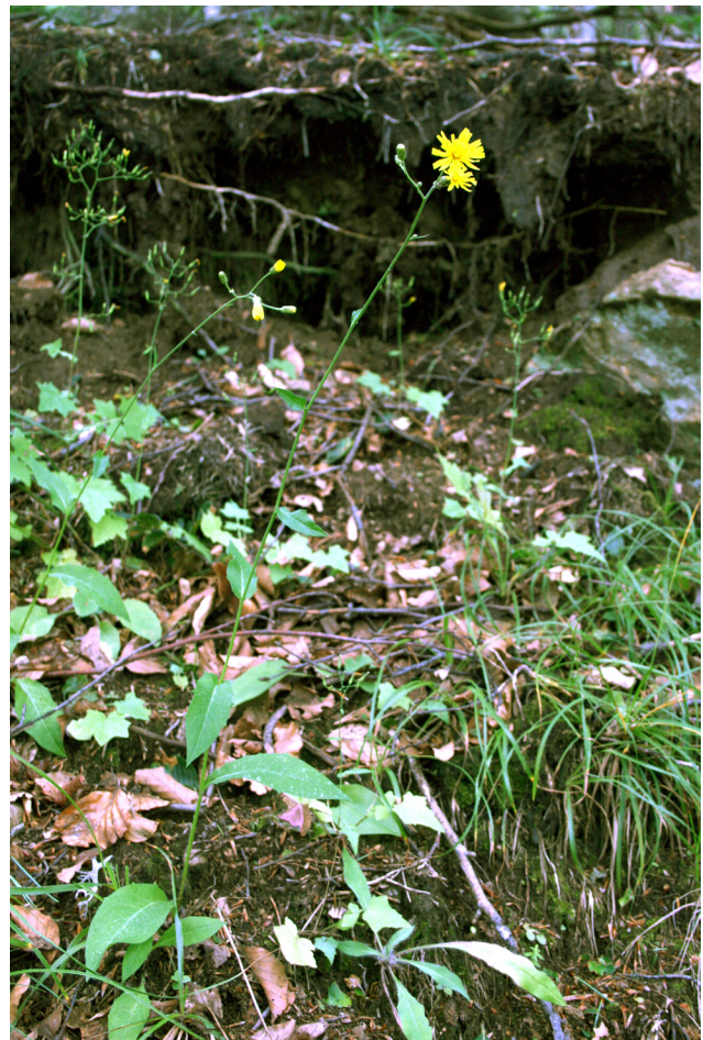
Fig. 4: Hieracium subnitens (Du-34762, Go-68329).