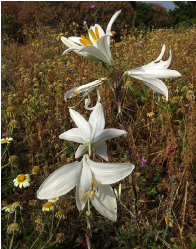
Fig. 5. Lilium candidum.