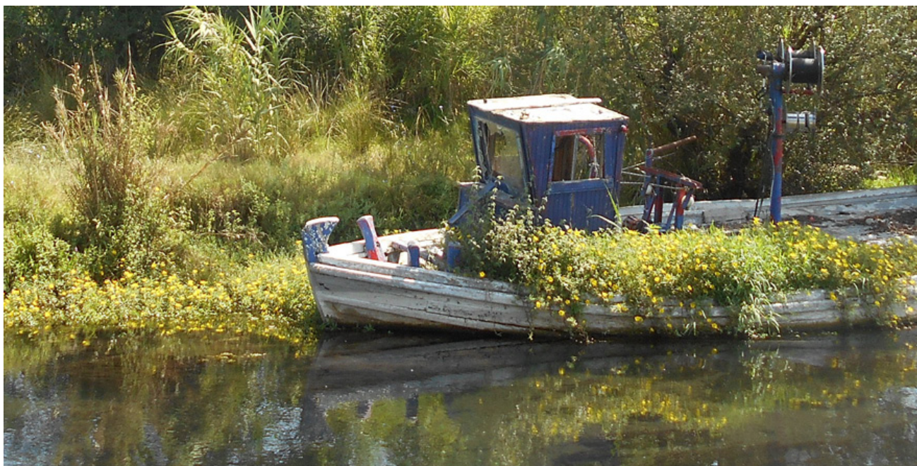
Fig. 20. Ludwigia peploides subsp. montevidensis locally established in old fishing boat anchored at lake shore.

montevidensis (Tan & al. 2009). The third species in the area is L. palustris which is found at the eastern shore of Lake Lysimachia and between Lakes Trichonis and Angelokastro. Ludwigia peploides subsp. montevidensis is both aquatic and terrestrial (see Fig. 20) with stems rooting at the nodes, and its occurrence at the five localities on Lake Trichonis (Fig. 21) has never been previously documented. The first author is currently carrying out his doctoral work on trophic relationships of the fish fauna in the lakes of Aetolia-Akarnanias.