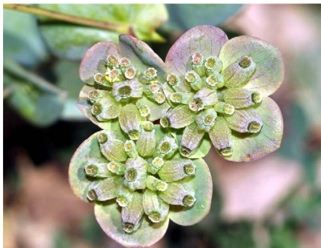
Fig. 24. Bupleurum subovatatum (photo G. Zarkos).

broader stylopodium. As well as open forest it occurs in man-made habitats, e.g., along paths, cultivated cereal fields, vine yards and waste ground. There are a few reports from the Peloponnese, mainly coastal or at low altitude. Our record is at a relatively high altitude.