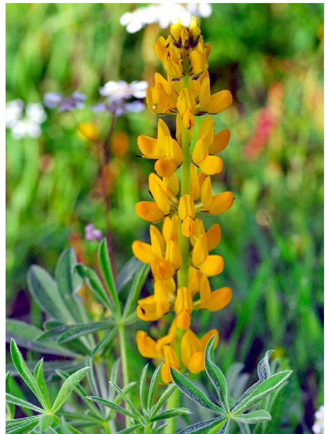
Fig. 8. Lupinus luteus.

Gr Nomos & Eparchia Ilias: Mt Lambia, southern