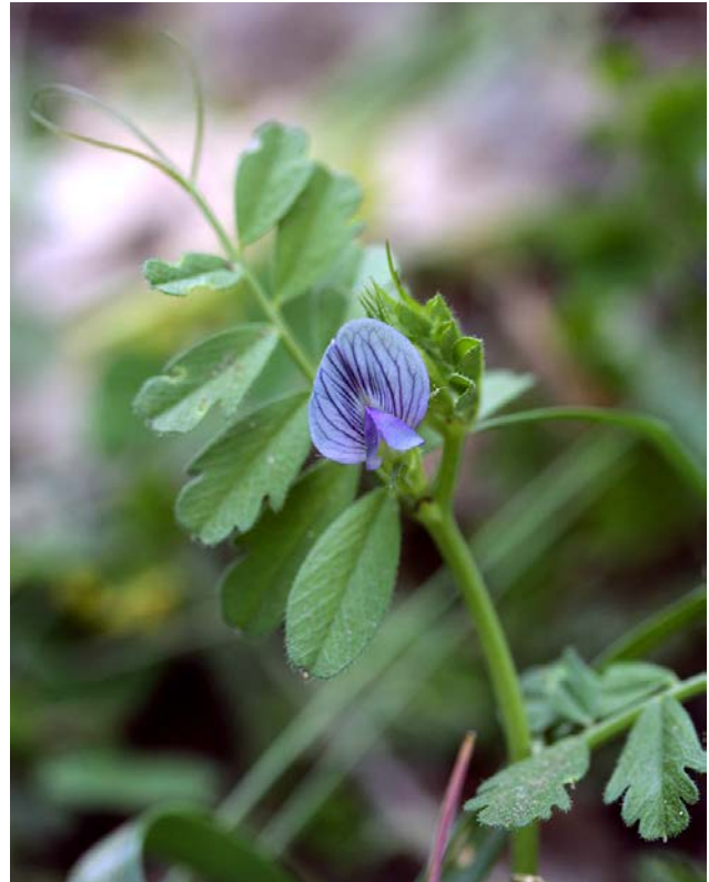
Fig. 13. Vicia incisa.

This is a new species for this floristic region (see Assyov & Petrova 2012).