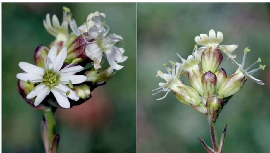
Fig. 30. Silene roemerii subsp. macrocarpa.