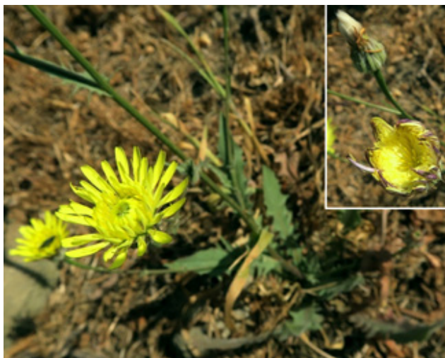
Fig. 1. Crepis foetida subsp. rhoeadifolia (photo B. Biel).

New for Kiklades. Reported from Ikaria and Lesvos in the East Aegean area.