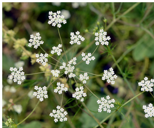
Fig. 23. Ammoides pusilla.

First report for Korinthias in the floristic region Peloponnisos. The species is often confused with B. lancifolium but can be distinguished by the shape of its lower cauline leaves and larger fruits (3.5–5 mm) with a