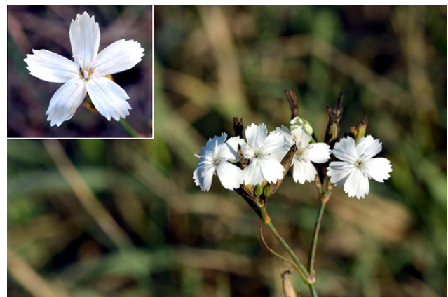
Fig. 28. Dianthus aridus.

Gr Nomos & Eparchia Korinthias: in open Quercus