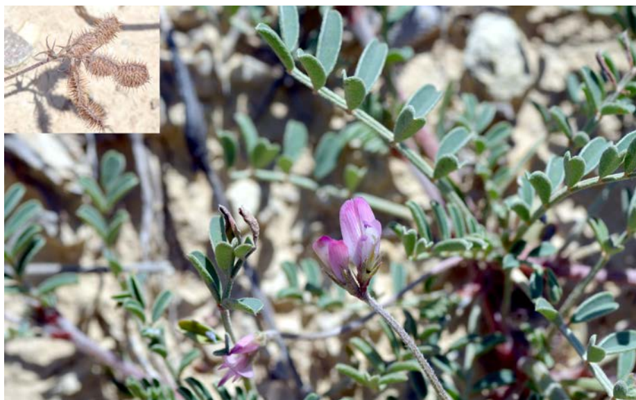
Fig. 32. Sulla spinosissima.

New for Korinthias, surprisingly, never collected or previously noted although fairly widespread in north central Peloponnese. The reddish-pink corolla and short hairs on the calyx tube relate it more to subsp. roseum than to subsp. ochroleucon which has an off-white corolla. Trifolium o. subsp. ochroleucon has a more northwesterly distribution in Greece (N and S Pindos, N Central and North East).