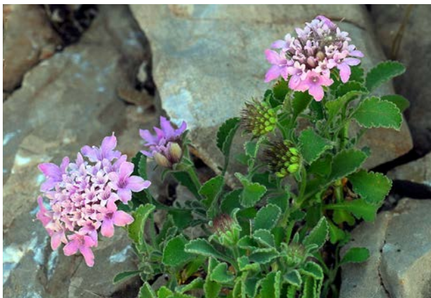
Fig. 7. Pterocephalus perennis.

Gr Nomos & Eparchia Ilias: Mt Lambia, southern lower slopes, 1200 m, 37°52'N, 21°46'E, 16.05.2018, Kit Tan, G. Vold & K. Giannopolous obs. New for Mt Lambia and eparchia Ilias