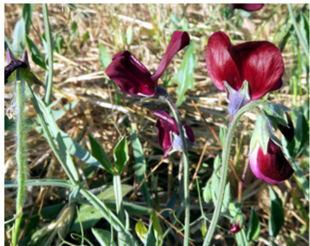
Fig. 2. Lathyrus hirsutus.