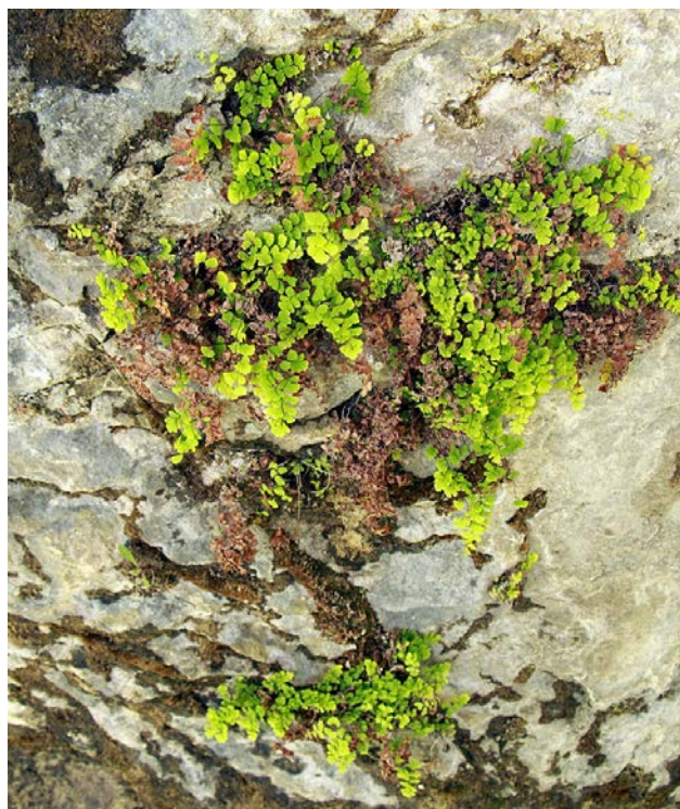
Fig. 12. Adiantum capillus-veneris.

The current record represents a new locality of this Critically Endangered fern species entered in the Red Data Book of the Republic of Bulgaria , vol.1 (Ivanova 2015) and listed in Annex III of the Biodiversity Act. This protected species is already known from the floristic region of the Rhodopi Mts ( Eastern ), from three