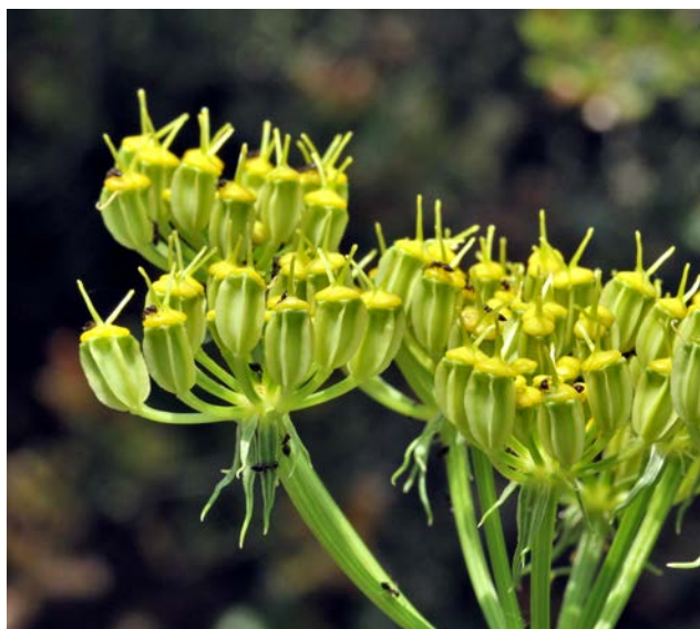
Fig. 25. Heptaptera colladonioides.

Akrocorinthos, west side of Penteskoufi hill, in between limestone rocks just below the summit, 450 m, 04.05.2018, Zarkos & Christodoulou obs.; loc. ibid. , 31.05.2018, Kit Tan & G. Vold 32870; rocky limestone slopes and phrygana east of Lake Stymfalia, 18.05.2018,