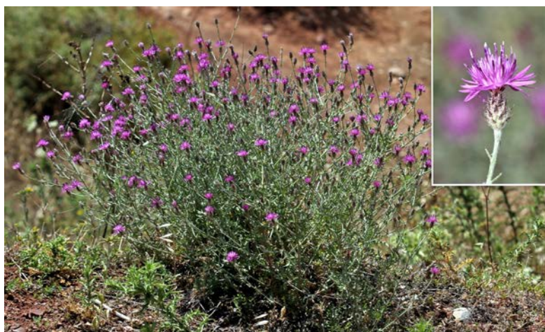
Fig. 26. Centaurea orphanidea.

Gr Nomos & Eparchia Korinthias: Akrocorinthos,