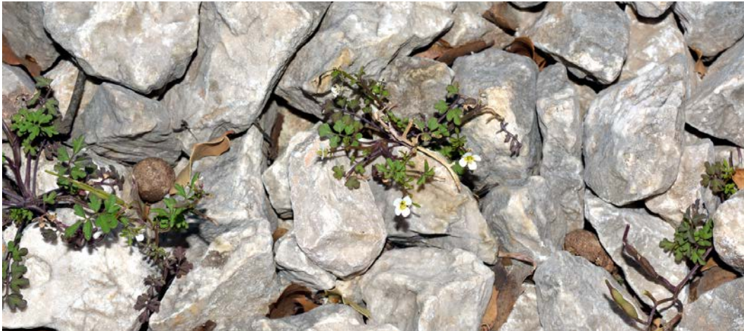
Fig. 27. Cardamine calliphaea.

Endemic to Greece; new for nomos & eparchia. Almost extinct at the locus classicus at Kaiafas, Ilias as most of the large fruiting individuals had been collected before seed is fully ripe. However, there are still many plants in the Vouraikos gorge. The vertical limestone cliffs of the Klissoura gorge in Mesolongiou, the gorge at Leonidio, south Parnon and the Vouraikos gorge are natural habitats whereas at Kaiafas and Kiato, the habitats are man-made.