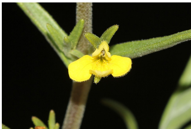
Fig. 34. Macrosyringion glutinosum.