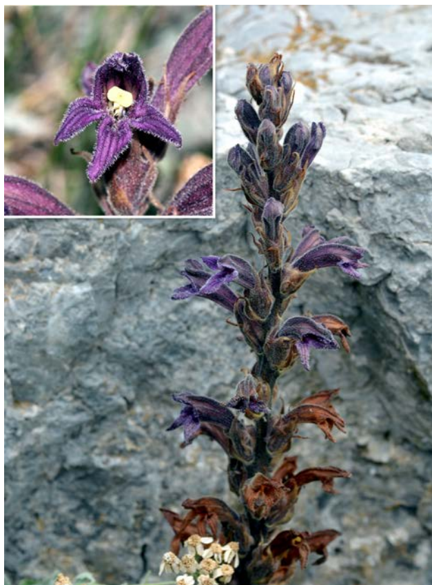
Fig. 35. Phelipanche purpurea.