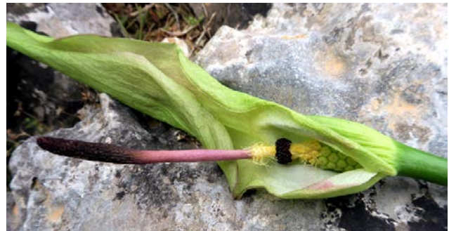
Fig. 4. Arum maculatum.

northern slope of Krikelos, 780 m, 36°54'29"N, 26°01'31"E, 01.06.2016, Biel 16.121; E of Lagadha, rocks with crevices at eastern slope of Krikelos, 790 m, 36°54'28"N, 26°01'32"E, 06.05.2018, Biel 18.029; E-NE of Lagadha, crevices of steep rocky slope, above path to Stavros, 600 m, 36°54'39"N, 26°02'05"E, 28.05.2017, Kit Tan & G. Vold obs.; loc. ibid. , 09.05.2018, Biel 18.044.