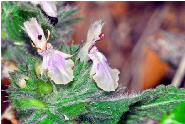
Fig. 9. Stachys germanica subsp. heldreichii.

Gr Nomos & Eparchia Ilias: Mt Lambia, southern