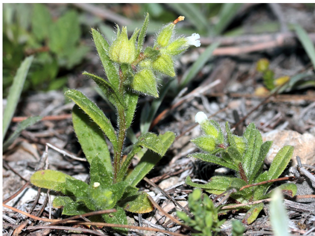
Fig. 15. Nonea echioides.