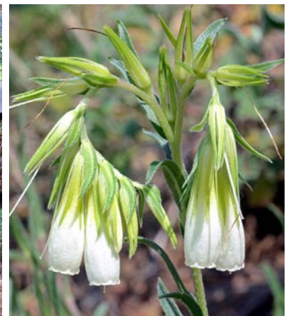
Fig. 18. Onosma kittanae at locus classicus SW of Dadia.