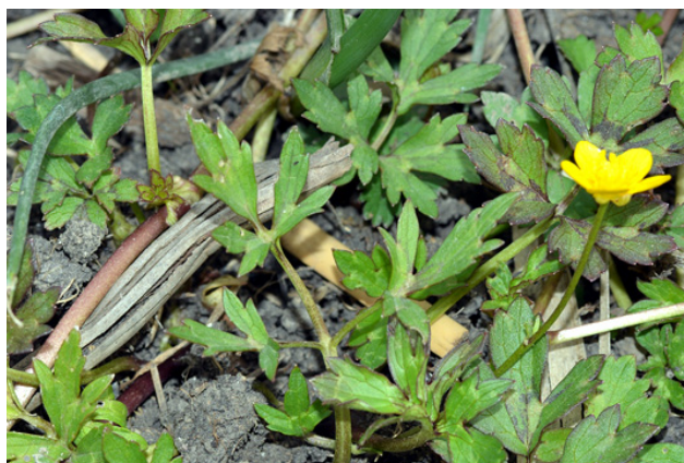
Fig. 36. Ranunculus repens.

New for Korinthias; in Peloponnese, so far reported only from Nomos Achaïas. Several large populations were in flower at the lake edge, together with R. sardous , Galium debile and Potentilla reptans .