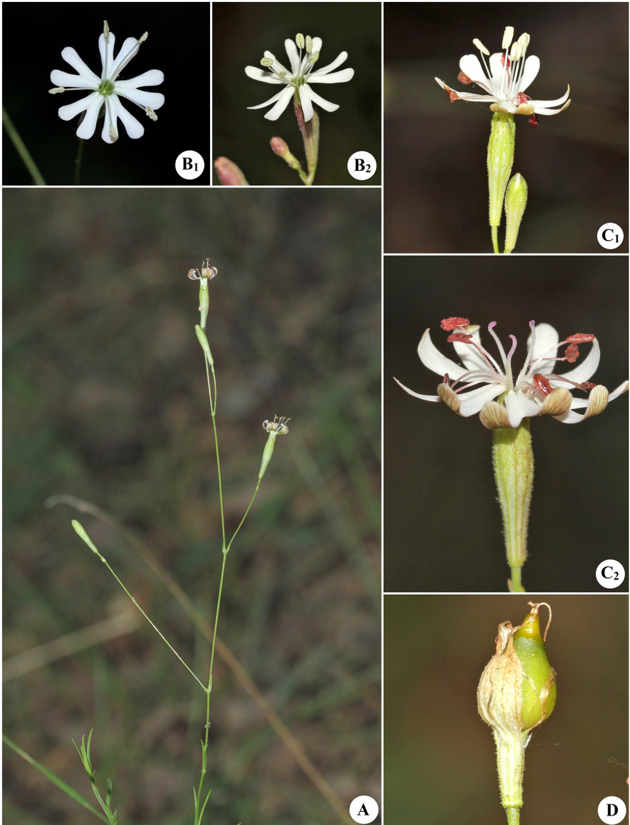
Fig. 29. Silene christodouloui-zarkosii : A, inflorescence; B1 & B2, flowers in frontal view; C1 & C2, flowers in lateral view; D, capsule.