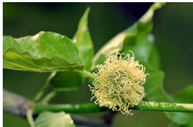
Fig. 33. Maclura pomifera.

First report for the Peloponnese. Native to N. America. Also recorded as planted or escape from cultivation in Kerkira, Prevezis, Pierias and Thessalonikis.