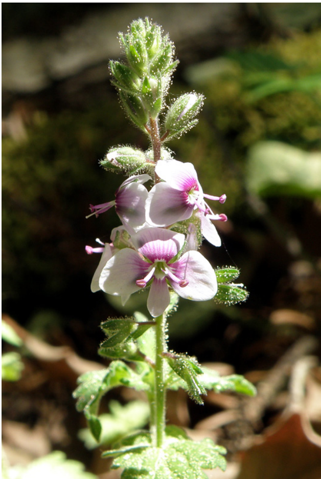
Fig. 37. Veronica chamaedrys subsp. chamaedryoides.

Gr Nomos Arkadias, Eparchia Mandinias: Mt Oligirtos, 1285 m, 11.04.2018, Zarkos obs. New for Mt Oligirtos. Widespread on mainland Greece.