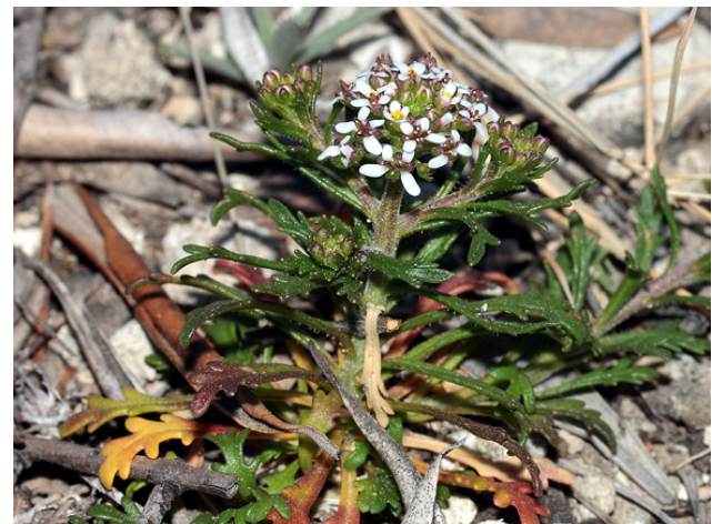
Fig. 16. Iberis acutiloba.

New for nomi. The nearest Greek localities are in the Nestos river delta.