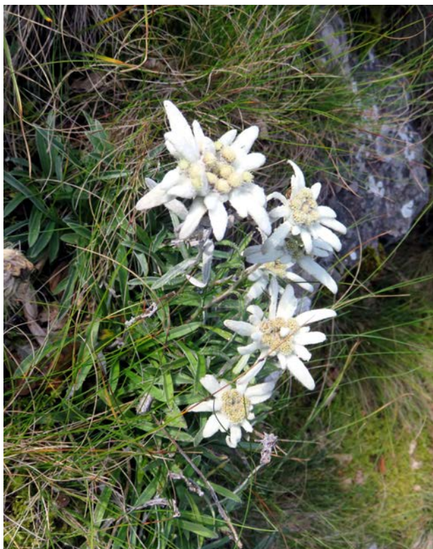
Fig. 22. Leontopodium nivale subsp. alpnum , Ispolin peak locality.

Acknowledgements. Fieldwork was carried out under project 'Flora of the Republic of Bulgaria, vol. 12: Biological Diversity in Asteraceae subfam. Carduoideae and Cichorioideae ', Contract DN01/7, funded by the Bulgarian National Science Fund.