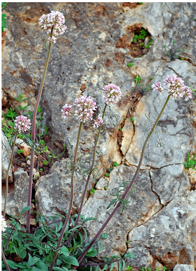
Fig. 11. Valeriana italica.