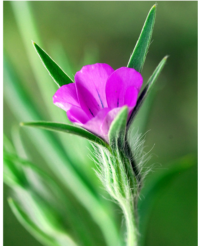
Fig. 6. Agrostemma githago.

Gr Nomos & Eparchia Ilias: Mt Lambia, southern