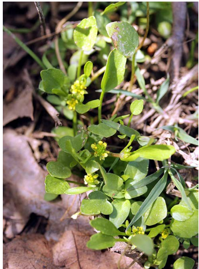
Fig. 14. Ranunculus lateriflorus.