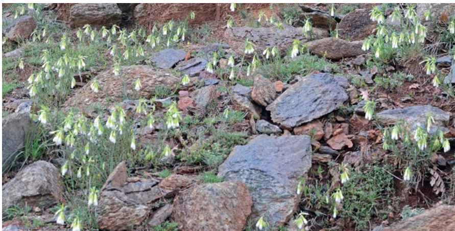
Fig. 17. Onosma kittanae in abundance on rocky serpentine slopes between the villages of Organi and Chloi.

Gr Nomos Evrou, eparchia Orestiados: 6 km N-NE