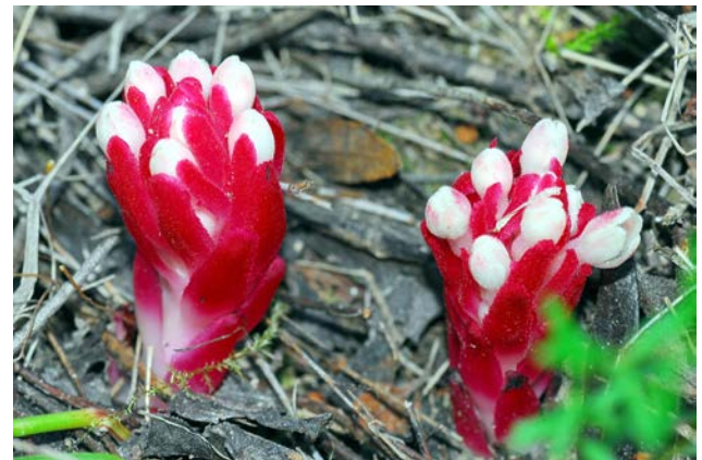
Fig. 10. Cytinus ruber.

Gr Nomos & Eparchia Ilias: Mt Lambia, southern lower slopes, 1130 m, 37°52'N, 21°46'E, 16.05.2018, Kit Tan, G. Vold & K. Giannopolous obs.