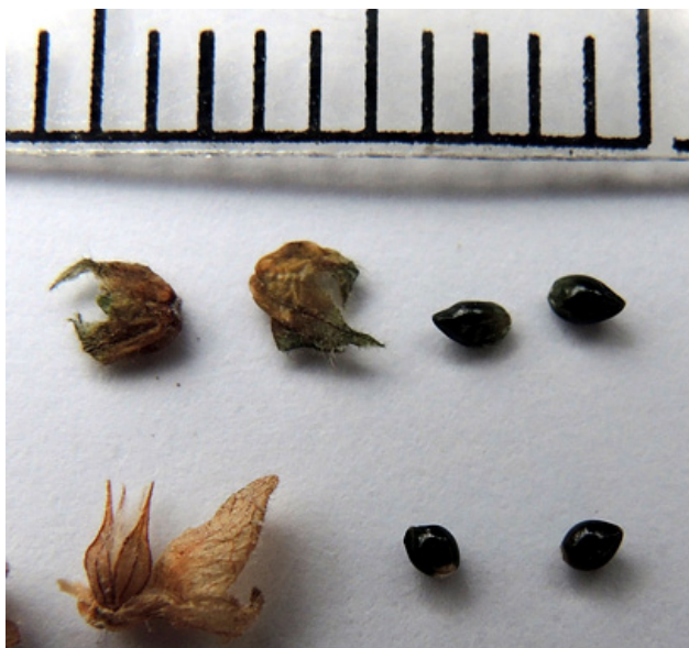
Fig. 3. Seeds of Parietaria officinalis (upper row) and P. judaica.

Gr Amorgos: E of Lagadha, cliffs with crevices at