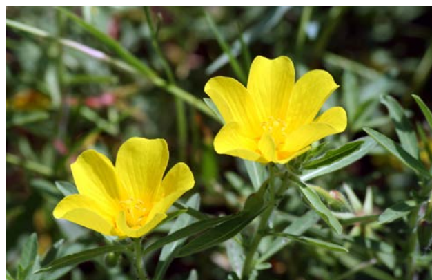
Fig. 19. Ludwigia peploides subsp. montevidensis.

Gr Nomos Etolias-Akarnanias, Eparchia Trichonidos: Abaria area, near village of Panetolio at northern edge of Lake Trichonis, 15 m, 38°34'12"N, 21°33'06"E, 09.06.2015, L. Tsounis obs.; near Dougri, 18 m, 38°35'59"N, 21°34'23"E, 11.06.2015, L. Tsounis obs.; Sitaralona at eastern shore of Lake Trichonis, 23 m, 38°31'03"N, 21°39'27"E, 11.06.2015, L. Tsounis obs.; Kapsorahi, at southeastern edge of Lake