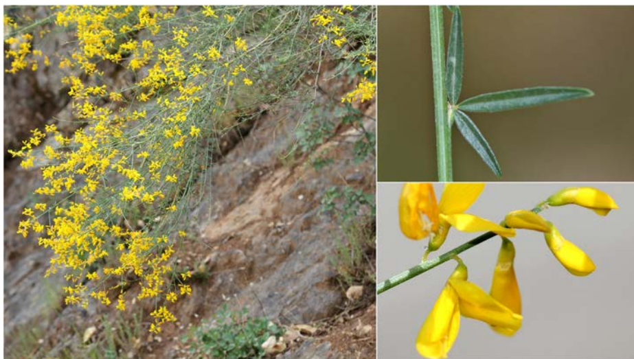
Fig. 31. Gonocytisus dirmilensis.

New for nomos, eparchia and mountain range Parnonas; most southern and eastern localities in Greece. Second record for the Peloponnese, the first being from Nomos