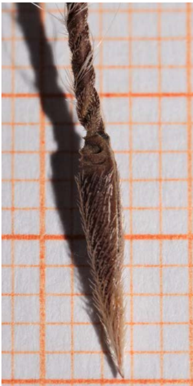
Fig. 6. Erodium botrys – the apical pits of the mericarps.

countries like Greece and in the countries of former Yugoslavia (Webb & Chater 1968; Greuter & al. 1986; Aldasoro & al. 2009). It has been also reported from Bulgaria, from the Struma Valley (in the vicinities of Simitli town) (Stojanov 1924; Stojanov & Stefanov 1925; Stojanov & al. 1967). However, due to lack of herbarium materials, distribution of this species in Bulgaria was regarded as doubtful, or as a result of misidentification of Erodium hoefftianum (Hermann & al. 1931; Stojanov & Stefanov 1933; Petrova & Kozuharov 1979).