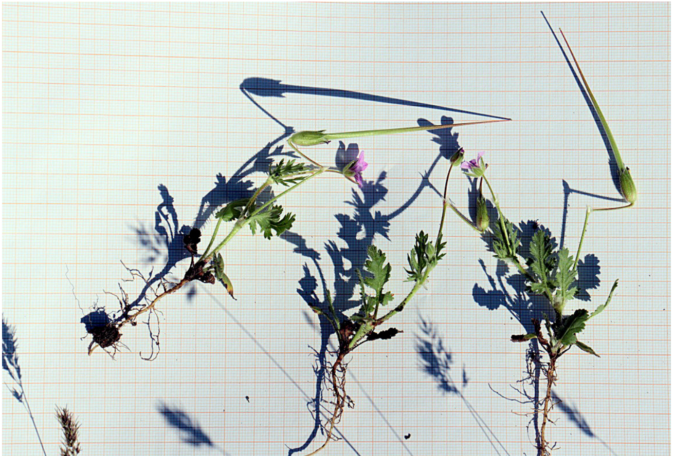
Fig. 5. Erodium botrys.