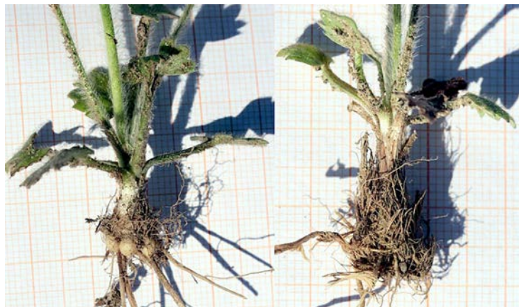
Fig. 3. Rootstock of Ranunculus paludosus.

Ranunculus paludosus is a widespread species in the Mediterranean region of Europe, Turkey, Near East, North Africa, and Cyprus (Tutin & Akeroyd 1993; Hörandl & Raab-Straube 2015). It occurs in the countries neighboring to Bulgaria, namely Serbia, Greece, Macedonia, and European Turkey (Hayek 1927; Sarić 1992; Greuter & al. 1989; Dimopoulos & al. 2013; etc.). Its