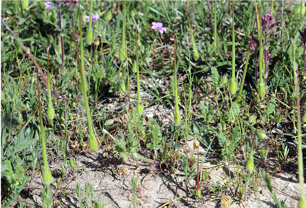
Fig. 7. Erodium botrys in its natural habitat.

lum sibthorpii , Veronica acinifolia , V. verna , Teesdalia coronopifolia , Erophila verna , Aphanes arvensis , Cerastium brachypetalum , Tuberaria guttata , Ornithopus compressus , Hypochaeris glabra , Poa bulbosa , Bellis perennis , Parentucellia latifolia , Juncus bufonius , Plantago bellardii , etc. From the middle of June, their aspect is dominated by tall grasses, mostly Chrysopogon gryllus . Common are also some shrubs and semi-shrubs like Genista rumelica , Cistus incanus , Prunus spinosa , etc. It is impossible to observe Erodium botrys during that period and probably this explains why it has not been found so far.