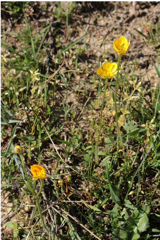
Fig. 4. Ranunculus paludosus in its natural habitat.

In the newly found localities in Eastern Rhodope Mts (Bulgaria), the population of Ranunculus paludosus is represented by small groups (Fig. 4) or clusters, mostly due to its vegetative germination. They consist predominantly of 20–25 individuals. The flowering period is probably from the end of March until the beginning of May (III–V). The habitats in these localities are mosaic, of grasslands and low scrublands. They are dominated by Genista rumelica , Cistus incanus and Chrysopogon gryllus . The species composition of these communities includes Sanguisorba minor , Anthoxanthum aristatum , Moenchia erecta , M. mantica , Centaurea rutifolia , Thymus ssp., Vicia villosa , Asyneuma limonifolium , Rubus ssp., and Rosa ssp. Saponaria stranjensis is another species of conservation significance in one of these localities.