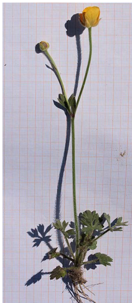
Fig. 2. Ranunculus paludosus.

In the Bulgarian flora, this species (Fig. 2) is most similar to Ranunculus sprunerianus Boiss (see Penev 1970). However, there are some differences between