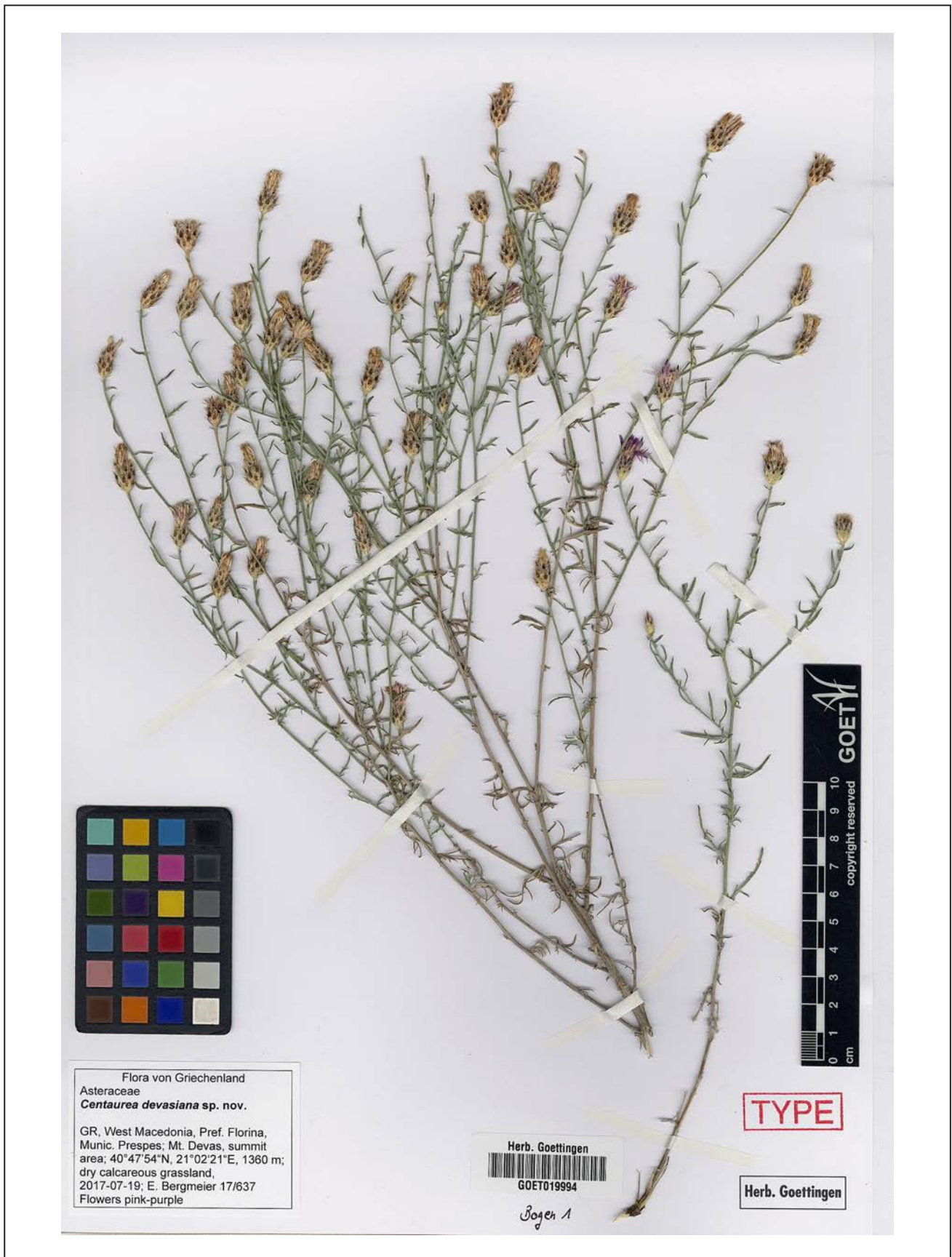
Fig. 1. Holotype (sheet 1) of Centaurea devasiana Bergmeier et Strid, sp. nov.