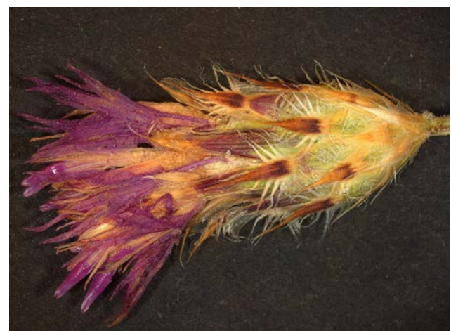
Fig. 3. Centaurea devasiana , achenes and flower head. Photos B. Siegesmund.