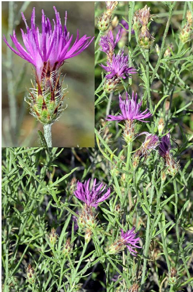
Fig. 2. Centaurea devasiana , habit and flower head. 27 July 2019.

Phenology: Stem growth – May to June, bud stage – June, flowering – end of June to mid-August, fruiting – from mid-July to September.