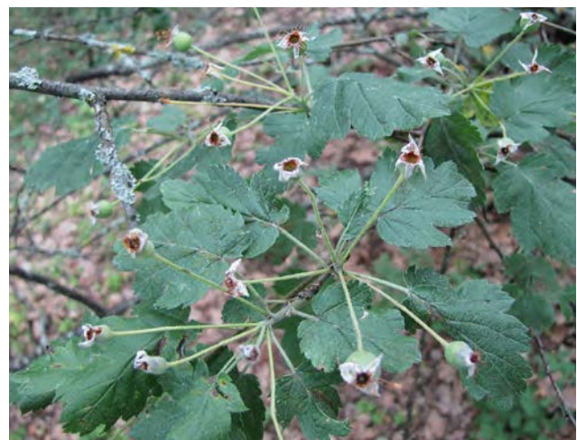
Fig. 7. Malus florentina in an oak woodland just N of Ag. Ioannis WNW of Laimos.