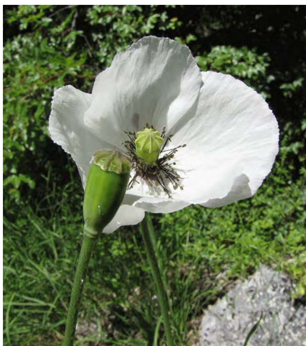
Fig. 6. Papaver albiflorum, flower and capsule, halfway to the summit area of Mt. Devas.