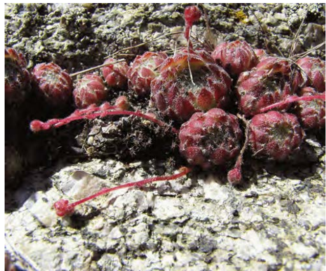
Fig. 4. Sterile Sempervivum ciliosum subsp. octopodes on granitic rock at 2175 m on Mt. Varnous.