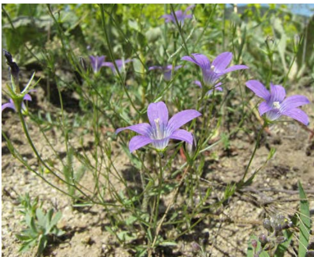
Fig. 3. Campanula phrygia on sandy soil at the margin of a rye field W of Laimos.

Isthmus 4 km W of Laimos, 855 m. Sandy arable field,