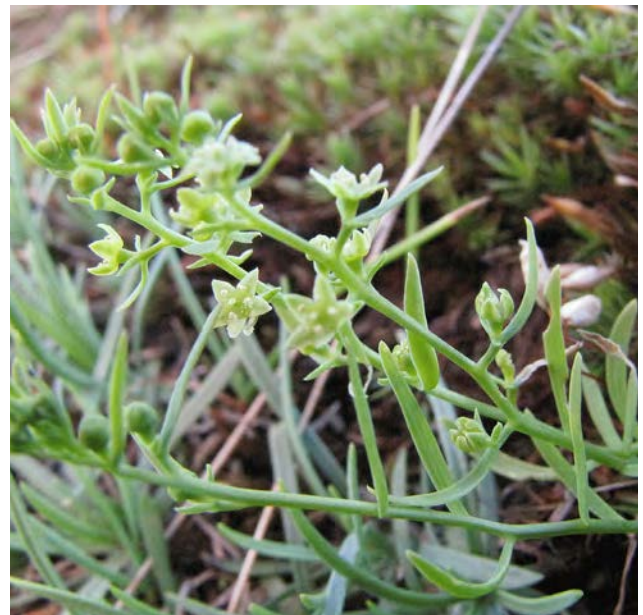
Fig. 9. Tiny Thesium parnassi, Mt. Varnous, summit area near Bela Voda.