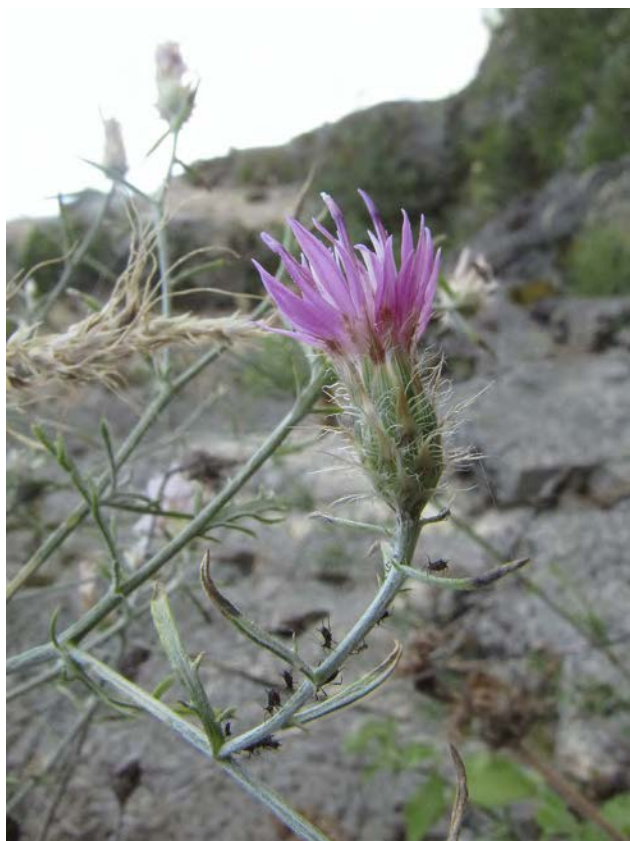
Fig. 2. Centaurea galicicae growing at a vertical limestone cliff SW of Psarades.