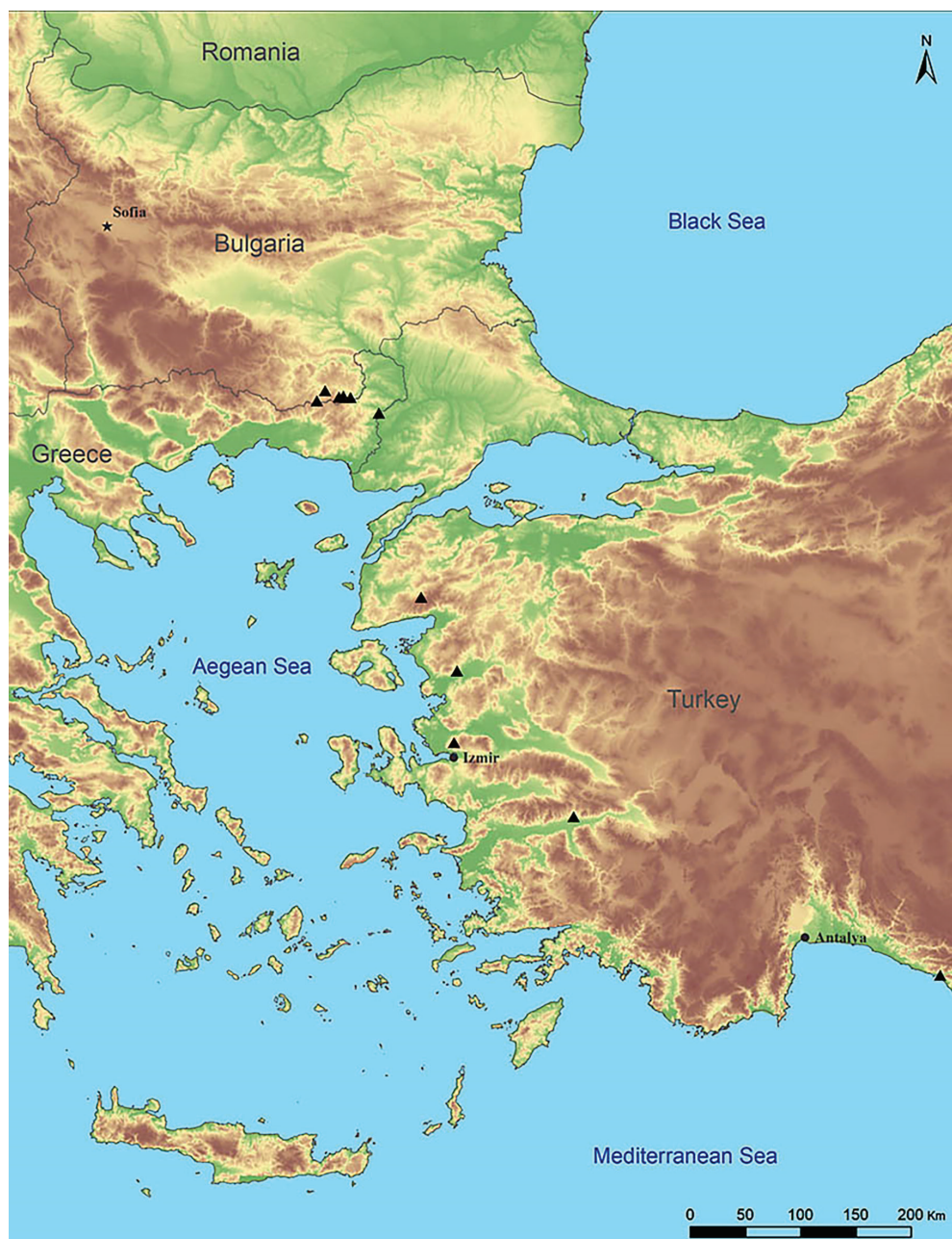
Fig. 2. Distribution map of Lupinus gredensis (solid triangles) in Bulgaria and Turkey.

seminatural dry stony grasslands, among sparse scrubs of Juniperus , only a few individuals were found.