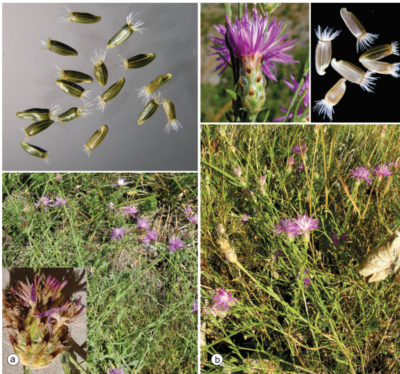
Fig. 1. a) Centaurea devasiana and b) Centaurea marmorea showing habit, capitulum and achenes.

of Ivani Mt belongs to habitat type code 5110 Stable xerothermophilous formations with Buxus sempervirens on rock slopes ( Berberidion p.p.), with the calcareous substrate vegetated by sub-Mediterranean and temperate scrub. The second locality belongs to habitat type code 9180 Tilio-Acerion forests of slopes, screes and ravines.