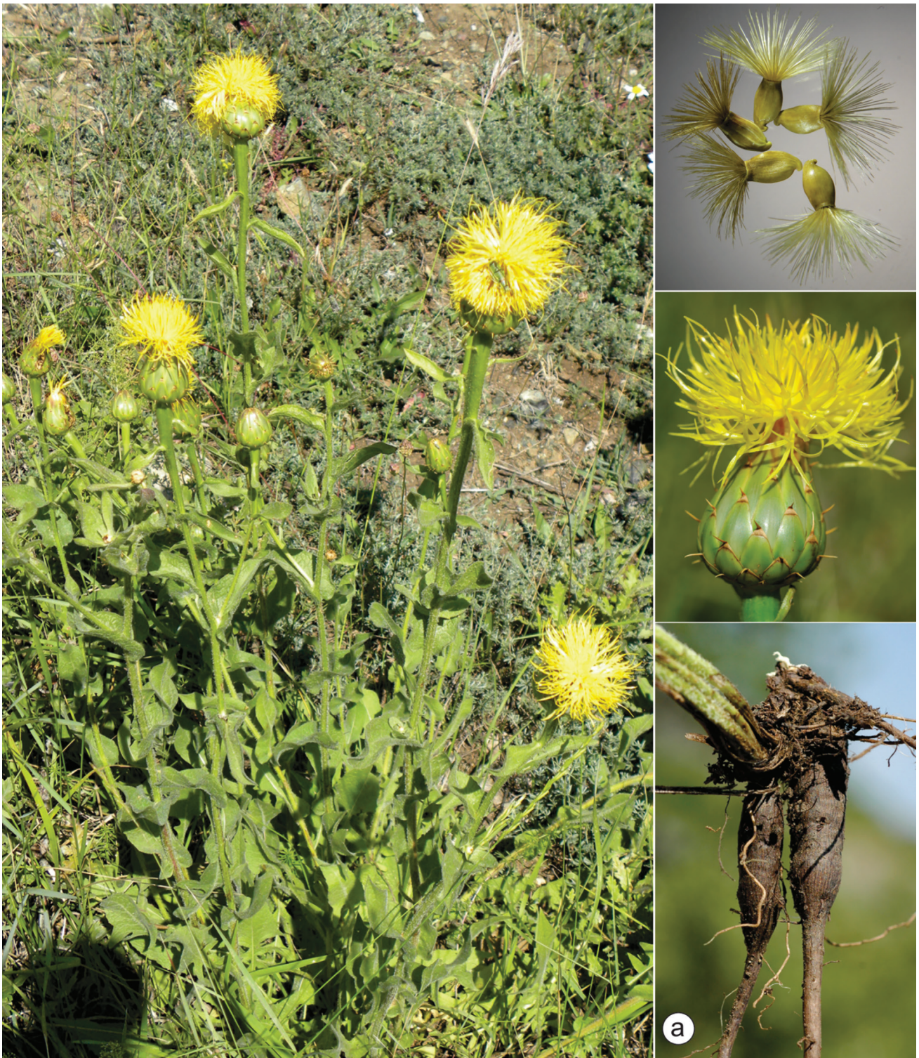
Fig. 2. Centaurea thracica showing habit, capitulum, achenes and tuberous roots (a).

Since the population in Qarri pass comprised fewer than 30 mature plants and the area is freely and unrestrictedly grazed by cattle, we plan to monitor the locality closely every three years.