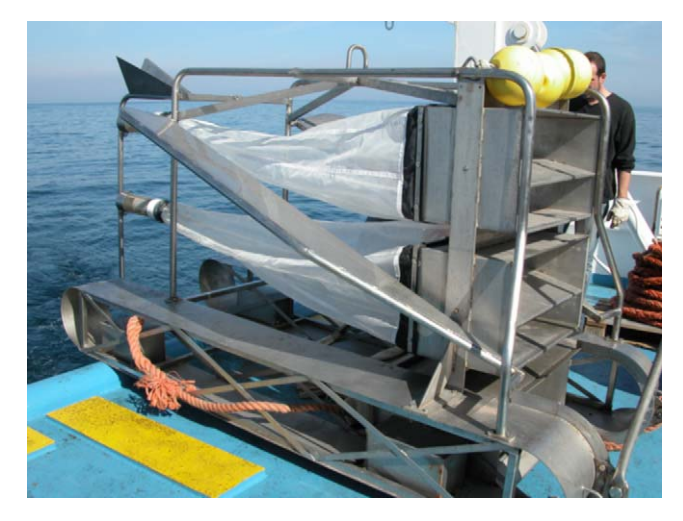
Fig. 2. Epibenthic Sanders sledge dredge equipped with two plankton nets.

Gear: D: rectangular dredge; De: Epibenthic dredge with planktonic nets; Dr: rock dredge; G: grab; I: ingegno; LI: longline; T: trap; TA: Agassiz Trawl; Tn: Trawl net; ROV: Remotely operated vehicle.