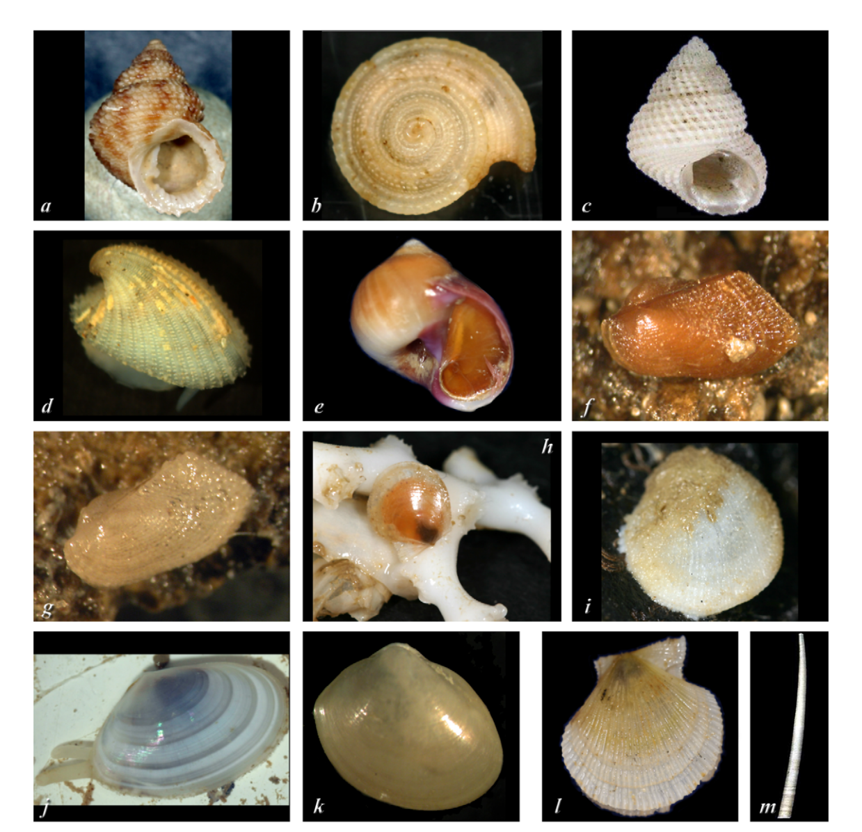
Fig. 5. Molluscs associated with the white corals collected off Cape Santa Maria di Leuca. (a) Danilia tinei; (b) Discotectonica discus; (c) Putzeysia wiseri; (d) Emarginula adriatica; (e) Euspira fusca; (f) Asperarca nodulosa; (g) Bathyarca philippiana; (h) Delectopecten vitreus; (i) Spondylus gussonii; (j) Abra longicallus; (k) Ennucula aegeensis; (l) Pseudamussium sulcatum; (m) Antalis agilis.

were collected for the first time in the SML coral banks by Tursi et al. (2004). Moreover, 9 bivalve and 1 scaphopod living species, belonging to the typical facies at Abra longicallus (Di Geronimo and Panetta, 1973) were found on the muddy bottoms around the coral colonies, namely A. longicallus (Fig. 5j), Bathyarca pectunculoides, Kelliella abyssicola, Notolimea crassa, Ennucula aegeensis (Fig. 5k), Pseudamussium sulcatum (Fig. 51), Parvamussium fenestratum, Yoldiella lucida, Y. philippiana and the scaphopod Antalis agilis (Fig. 5m).