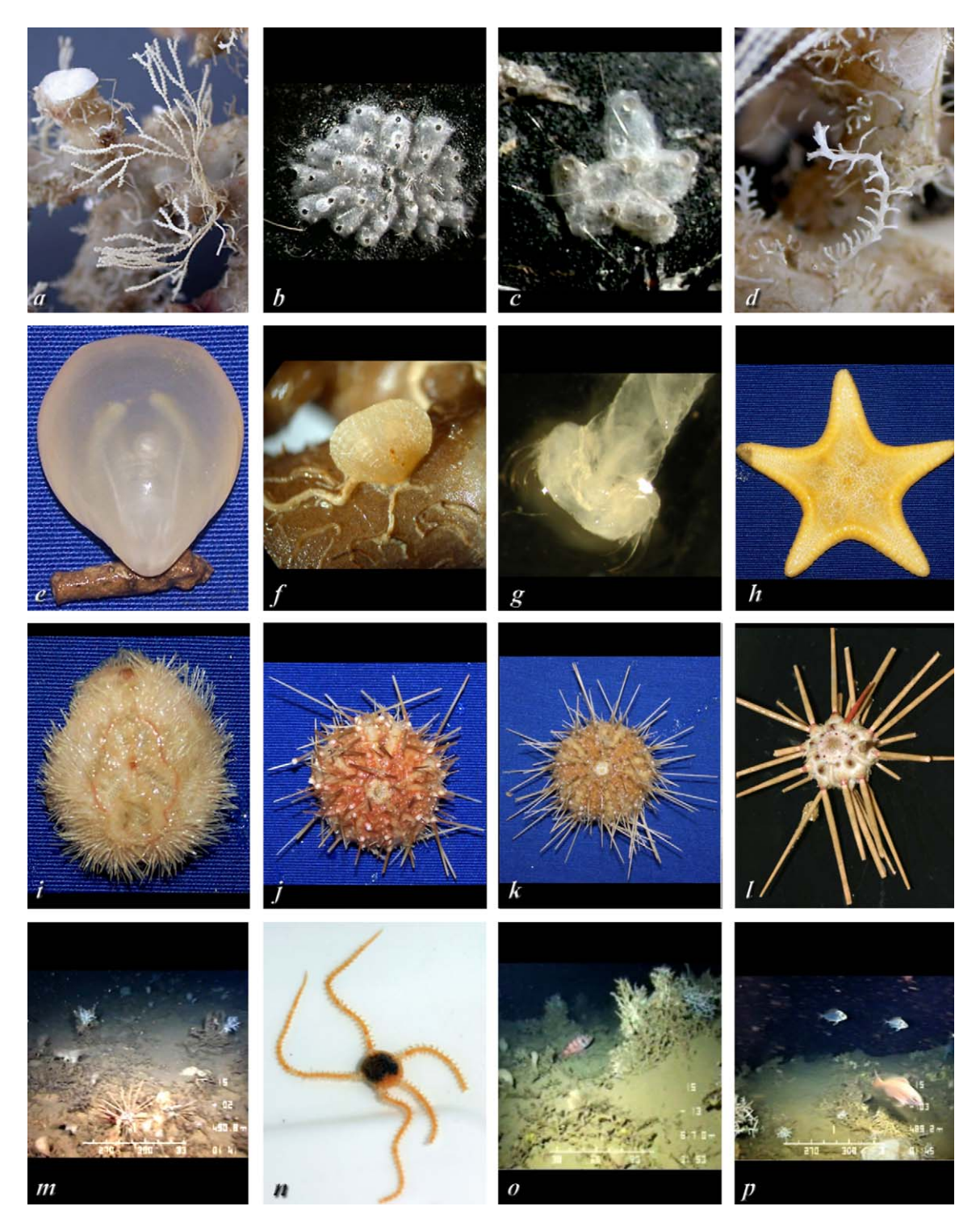
Fig. 7. Bryozoans, Brachiopods, Chetognata, Echinoderms and Fishes associated with the white corals collected off Cape Santa Maria di Leuca. (a) Scrupocellaria delilii ; (b) Schizoporella neptuni ; (c) Herentia hyndmanni ; (d) Tervia barrieri ; (e) Gryphus vitrerus ; (f) Megerlia truncata ; (g) Flaccisagitta hexaptera ; (h) Odontaster mediterraneus ; (i) Brissopsis atlantica mediterranea ; (j) Echinus melo ; (k) Echinus acutus ; (l) Cidaris cidaris ; (m) C. cidaris near the coral colonies ; (n) Amphiura filiformis ; (o) Helicolenus dactylopterus near the coral colonies; (p) School of Pagellus bogaraveo on the coral bank.

encrusting small-sized (millimetric) clasts ( S. capriensis and also some S. vulnerata colonies) or seemingly free lying on the bottom ( S. folini ). A few species constitute the bulk of the bryozoan associations, namely the cheilostomes S. delilii , T. boreale and C. exiguum and the cyclostomes Idmidronea sp. 1 and T. barrieri . Nearly all the other species are represented by very few, sporadic specimens, except for S. crystallina and H. hyndmanni .