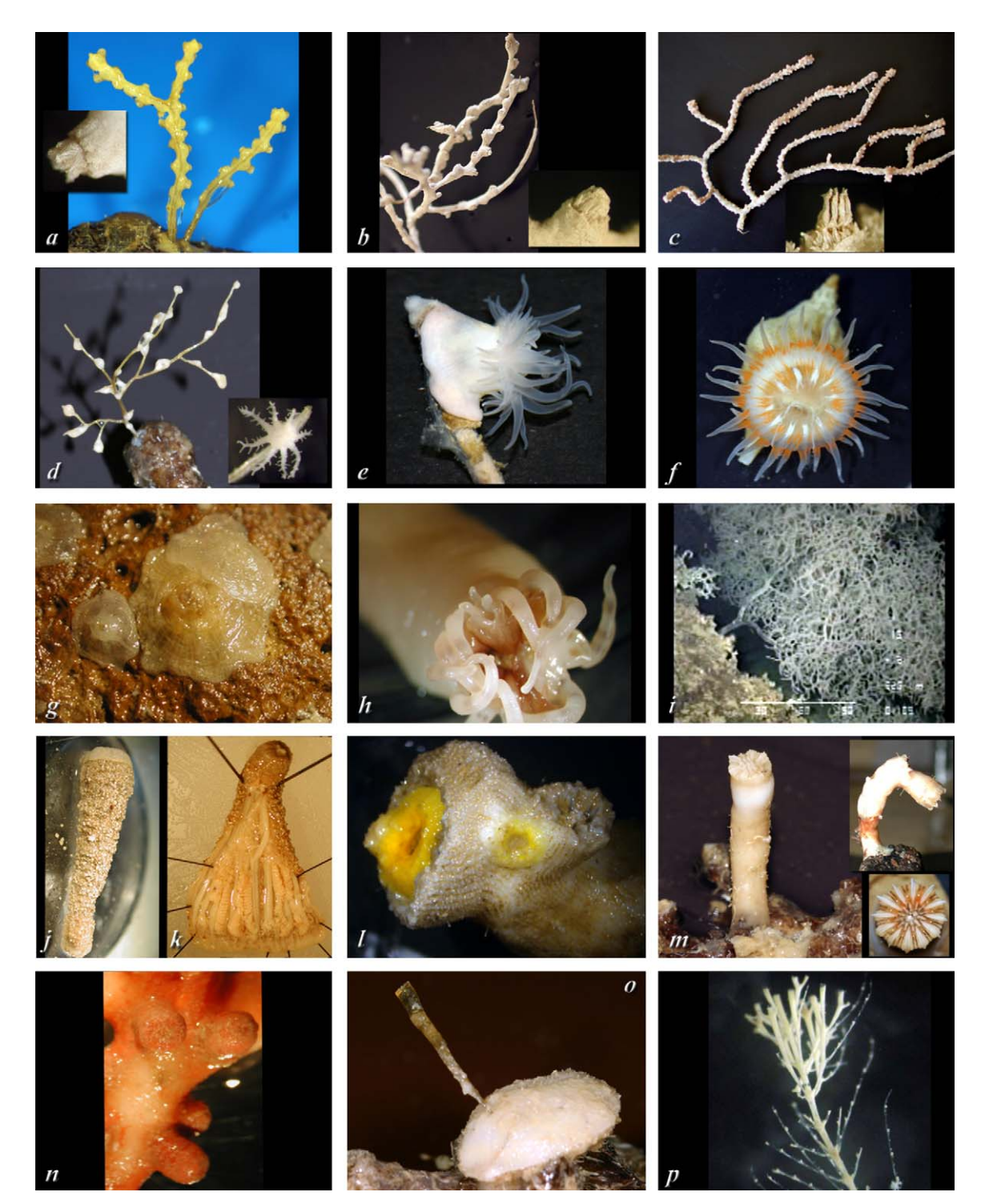
Fig. 4. Cnidarians associated with the white corals collected off Cape Santa Maria di Leuca. (a) Bebryce mollis ; (b) Swiftia pallida ; (c) Paramuricea macrospina ; (d) Dendrobrachia cfr. fallax ; (e) Amphianthus dorhni ; (f) Sargatia elegans ; (g) Kadophellia bathyalis ; (h) Peachia cylindrica , (i) Leiopathes glaberrima ; (j) and (k) undetermined Actiniaria; (l) Dendrophyllia cornigera ; (m) Caryophyllia calveri ; (n) Epizoanthus sp. , (o) Nausithoe sp. , (p) Nemertesia antennina .