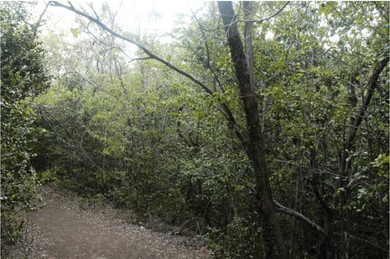
Habitat of White-breasted Thrasher at Presqu'Île de Caravelle, Martinique