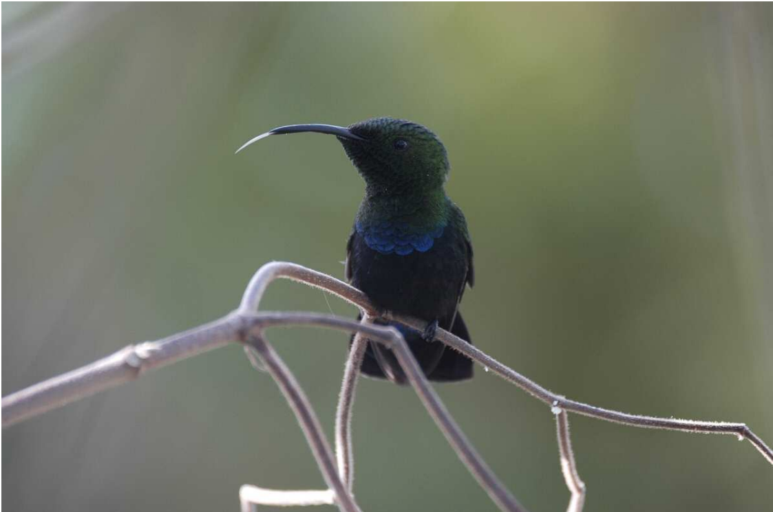
Green-throated Carib - Eulampis holosericeus - Le Diamant, Martinique